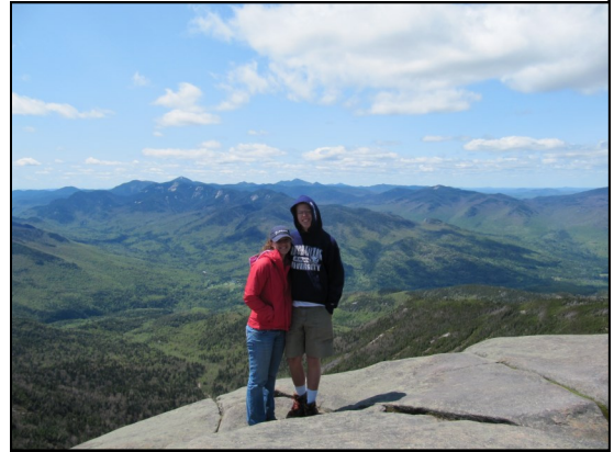
On the summit of Giant Mountain

The Adirondacks are the only mountains in the east that are not geologically connected to the Appalachians. They hold Mount Marcy, one of the tallest mountains in the northeast, and hundreds of other smaller mountains that are easily hiked by all people, regardless of age or physical stature. The country is absolutely breathtaking, with narrow highways winding between rock giants that block out most of the sky normally viewed from your car window. If you want to take a break, the towns and little villages that dot the region are something out of folklore. Driving through them, with their finely crafted wooden architecture and rustic feel, gives you the sense that you have stepped into a simpler and more relaxing period of time.