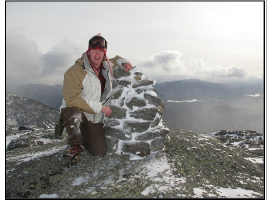
On the summit of Mount Marcy

If you have read this far, I am extremely pleased, because it means you are still interested. Now all you have to do is take the next step. It does not take much to get started, because another great thing about hiking is that it is absolutely free of charge! Log off of your Facebook and turn off your cell phone. Take a day away from the constant social interaction we have become obsessed with in our modern times, and get to know yourself more deeply. Instead of sending apathetic text and Facebook messages, grab a friend and put forward a wholehearted effort into getting to know them just a little bit better. I am sure that you will both learn some amazing things about one another and yourselves. Strap on a pair of solid shoes, throw some water and snacks in a backpack, and step out your door. I promise that you will not regret it. There is a lot to find out there on the wooded trails and rocky peaks, but if you never begin the climb, those new perspectives and vast summit views will forever evade your searching eyes and open mind.