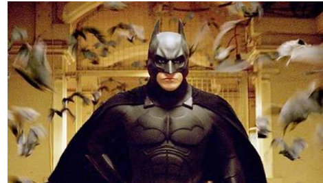
8. Christian Bale as Batman

In 2005, director Christopher Nolan re-imagined the caped crusader in a realistic light in Batman Begins . Tapping into the billionaire side of Batman, Nolan built off the aspects Burton already created and twisted and turned it a little bit.