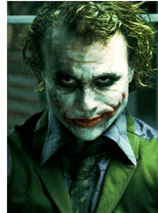
13. Heath Ledger as The Joker, 2008.

In 2008, Christopher Nolan presented to the world a darker, realistic version of the Caped Crusader in The Dark Knight Rises . In the film, The Joker rose up as the main antagonist to Batman. Heath Ledger’s performance of the Joker is one that leaves chills down the spine and goose bumps on the skin. This Joker moves away from the traditional Joker from the comics, away from the comedic pranks, gags and laughing