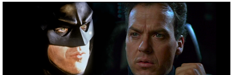
7. Michael Keaton as Batman and Bruce Wayne, 1989

Michael Keaton's performance as Bruce Wayne and Batman is one of the better performances. Keaton separates the personas easily into two different characters but leaves overlapping factors that make the