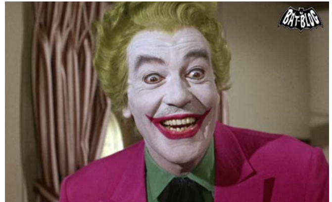
11. Caesar Romero, 1966 Batman

The Joker's first film appearance came in 1966 in the spin-off movie of the 1960's television show. Played by Caesar Romero, this version of the Joker takes a step back from the original comics. Instead of the maniacal mad man that fought against the Batman, the Joker of this film was a satire of the