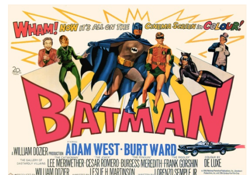
4. Batman 1966 movie poster