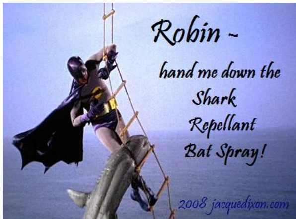
5. Batman and the Shark, 1966.

Adam West as Batman and Burt Ward as Robin 11 , the movie saw the dynamic duo fighting the Penguin, the Joker, the Riddler and Catwoman in a fight to save the leaders of the free world. The film brought the campy feel from the television show with it to the silver screen, with puns and one liners throughout the film. In one scene, while chasing a yacht in the Bat-Copter, Batman was climbing down a rope ladder