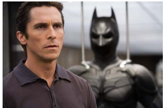
9. Christian Bale as Bruce Wayne, in front of Batman's armor, 2008

push everyone out of the mansion without being suspicious of Bruce. Bale's Batman is on the other side of the spectrum. He is the dark character who will fight a man to his limit, breaking his bones and to near death but without killing him. While interrogating a corrupt cop, Batman hangs him off a ledge of a building connected to a rope. Batman drops the cop from the roof and stops him inches from the ground.