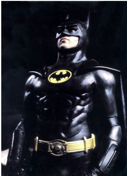
6. Michael Keaton as Batman, 1989.

Batman, in contrast, was a more serious character. Batman would look around and try to find clues to the crime, his intelligence greater than average citizen. In a scene where Bruce Wayne is on a date with Ms. Kitka, a disguised Catwoman, Bruce sees the Bat Signal in the sky and knows the intention was to trick the villains into thinking that Batman was too busy with the police commissioner to worry about them. Another difference between the two films was the personalization of Batman's equipment. In the 1943 film, Batman used a regular car to travel around and fight crime. In the 1966 film, everything used by Batman was personalized with a Bat name or the Bat symbol. For instance, Batman and Robin used the Bat-Copter, the Bat-Boat and the Bat-Mobile, all of which had the same colors and similar Batman details, such as bat shaped fins.