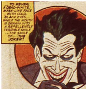
10. The Joker, as he first appeared (Kane, 229.)

The Joker has been a staple in the Batman Universe since the November 1940 issue of Detective Comics. A man with pale white skin, bright red lips that form into a smile and deep green hair, the Joker is a villain like any other. Constantly laughing and giggling, The Joker uses this gag to kill a man in the comics. In the issue, the Joker sends a record to the District Attorney of Gotham. As the record plays, Joker's voice is heard saying,