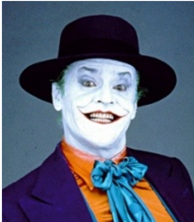
12. Jack Nicholson as The Joker, 1989.

If the Penguin was a big brother who was the know-it-all hot shot, the Joker would have been characterized as the annoying younger brother that the mother told the big brother to bring along.