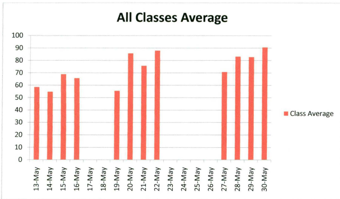
Figure 3. All Classes Average