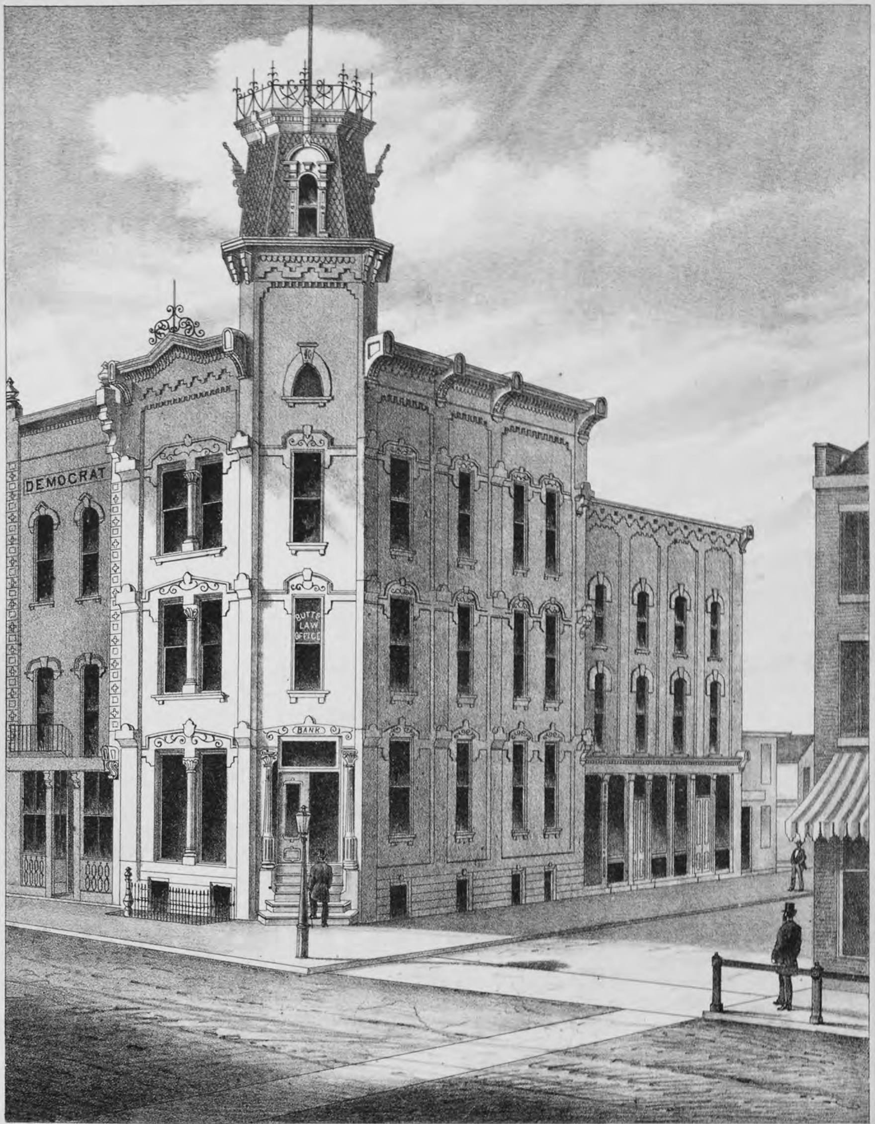
BLOCK OF THE FIRST NATIONAL BANK, ERECTED BY LUTHER GORDON 1873 & 1874, BROCKPORT, N. Y.