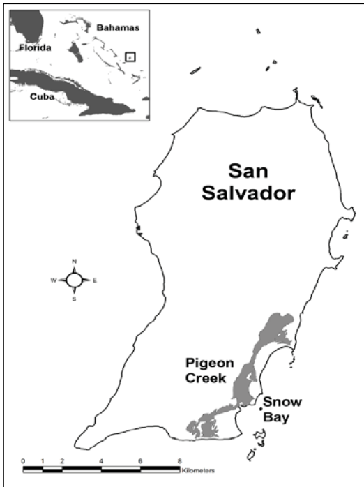
Figure 1. Map of Pigeon Creek and adjacent Snow Bay on San Salvador island with inset of the NE Caribbean region. Adapted from (Krumhansl et al., 2007) Reprinted with permission.

Pigeon Creek was expected to be an important nursery habitat for juvenile grouper, snapper and other reef fishes because juvenile fish populations appeared to be higher in Pigeon Creek than at other areas around San Salvador (Krumhansl et al., 2007). Also, the fishes in Pigeon Creek are similar to those found in Fresh Creek (a confirmed nursery habitat) on Andros Island, Bahamas which also has habitats composed of seagrass, mangrove and bedrock (Layman & Silliman, 2002).