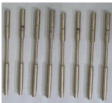
Figure 1: Photograph of the specimen