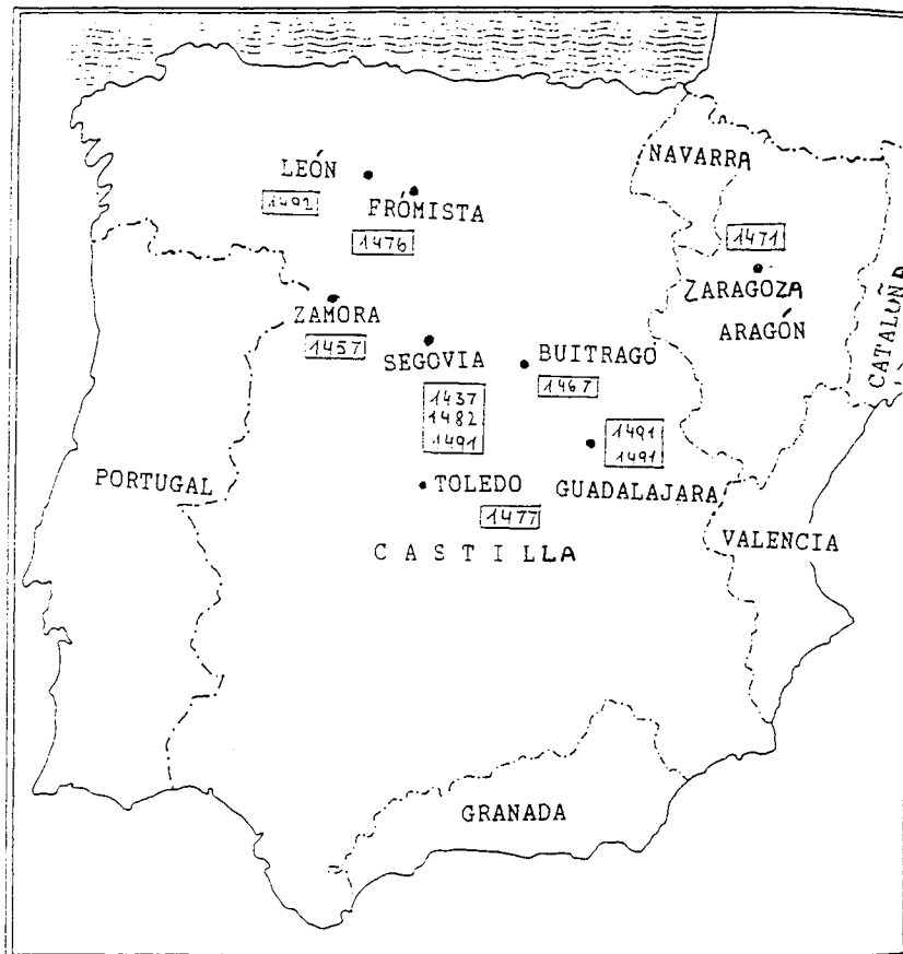
Map of yeshivot and years in which manuscripts were copied