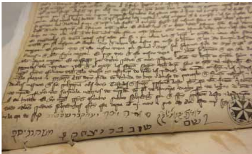
Fig. 2. Hebrew signatures affixed to the agreement on the Old Debts (1294, March 8). © Archivo Municipal de Miranda de Ebro, Libro H0213-053.

The presence during the meeting of two Jewish witnesses from the neighboring towns (David de Haro and Mose de Pancorbo) signaled that the matter of collecting old debts in Miranda concerned not only the town's Jews, but also a much wider network of Jewish creditors catering to Miranda's Christian vecinos . The sincerity of the concejo's commitment to facilitating the entregas was tested only two years later, when the tensions in Miranda exploded into a major controversy, involving several Jewish communities, an eminent royal servitor, and the Crown. The chronology of the events is difficult to reconstruct, but it appears that sometime in the summer of 1296, Diego López de Haro, lord of Vizcaya, who had recently entered the Castilian king's service, complained that he had not received a tribute from the Jews of Haro and the bishopric of Calahorra he was assigned as Fernando IV's servitor. 30 In response, Polo