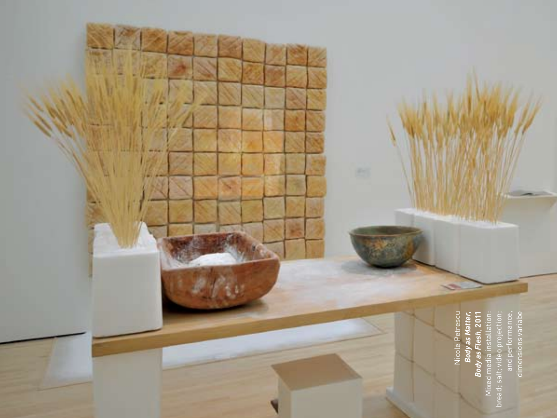
Nicole Petrescu Body as Flesh , 2011 Mixed media installation; bread, salt, video projection, and performance; dimensions variable