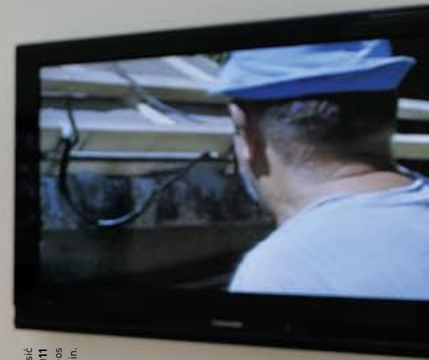
Zlatko Ćosić The Voice of a Pioneer , 2011 Three digital videos on DVDs, 6 min.