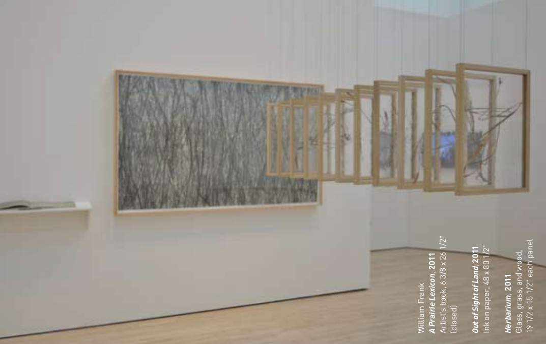
William Frank A Prairie Lexicon, 2011 Artist's book, 6 3/8 x 26 1/2" (closed) Out of Sight of Land, 2011 Ink on paper, 48 x 80 1/2" Herbarium, 2011 Glass, grass, and wood, 19 1/2 x 15 1/2" each panel