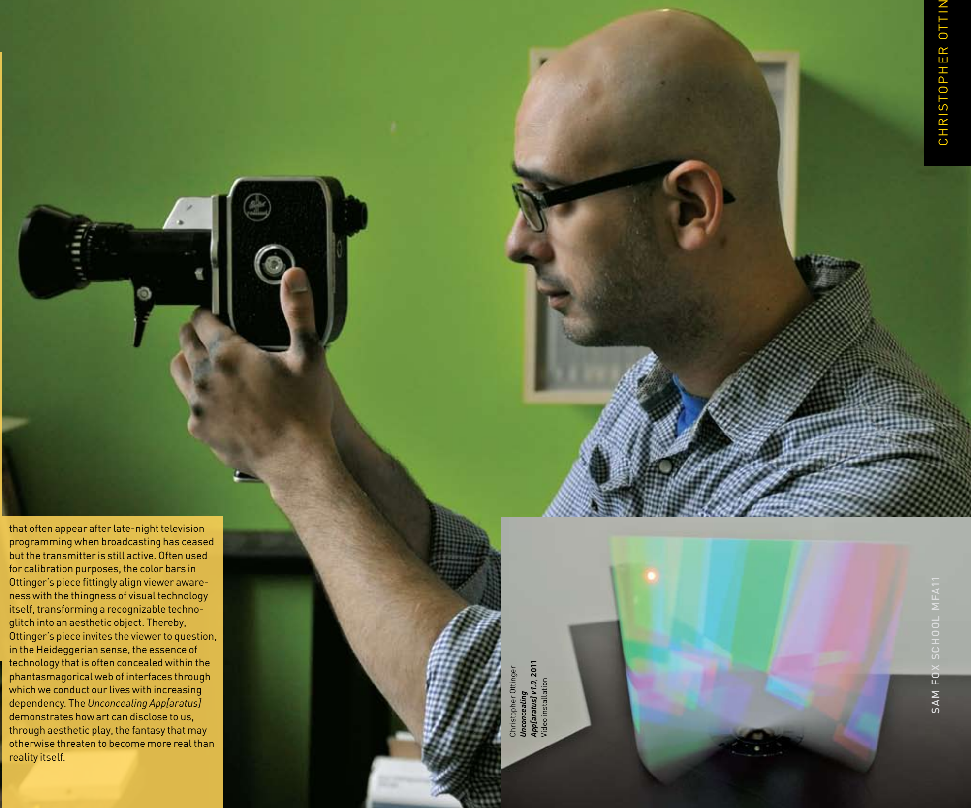
Christopher Ottinger Unconcealing App[aratus] v1.0, 2011 Video Installation

that often appear after late-night television programming has ceased but the transmitter is still active. Often used for calibration purposes, the color bars in Ottinger's piece fittingly align viewer awareness with the thingness of visual technology itself, transforming a recognizable technological glitch into an aesthetic object. Thereby, Ottinger's piece invites the viewer to question, in the Heideggerian sense, the essence of technology that is often concealed within the phantasmagorical web of interfaces through which we conduct our lives with increasing dependency. The Unconcealing App[aratus] demonstrates how art can disclose to us, through aesthetic play, the fantasy that may otherwise threaten to become more real than reality itself.