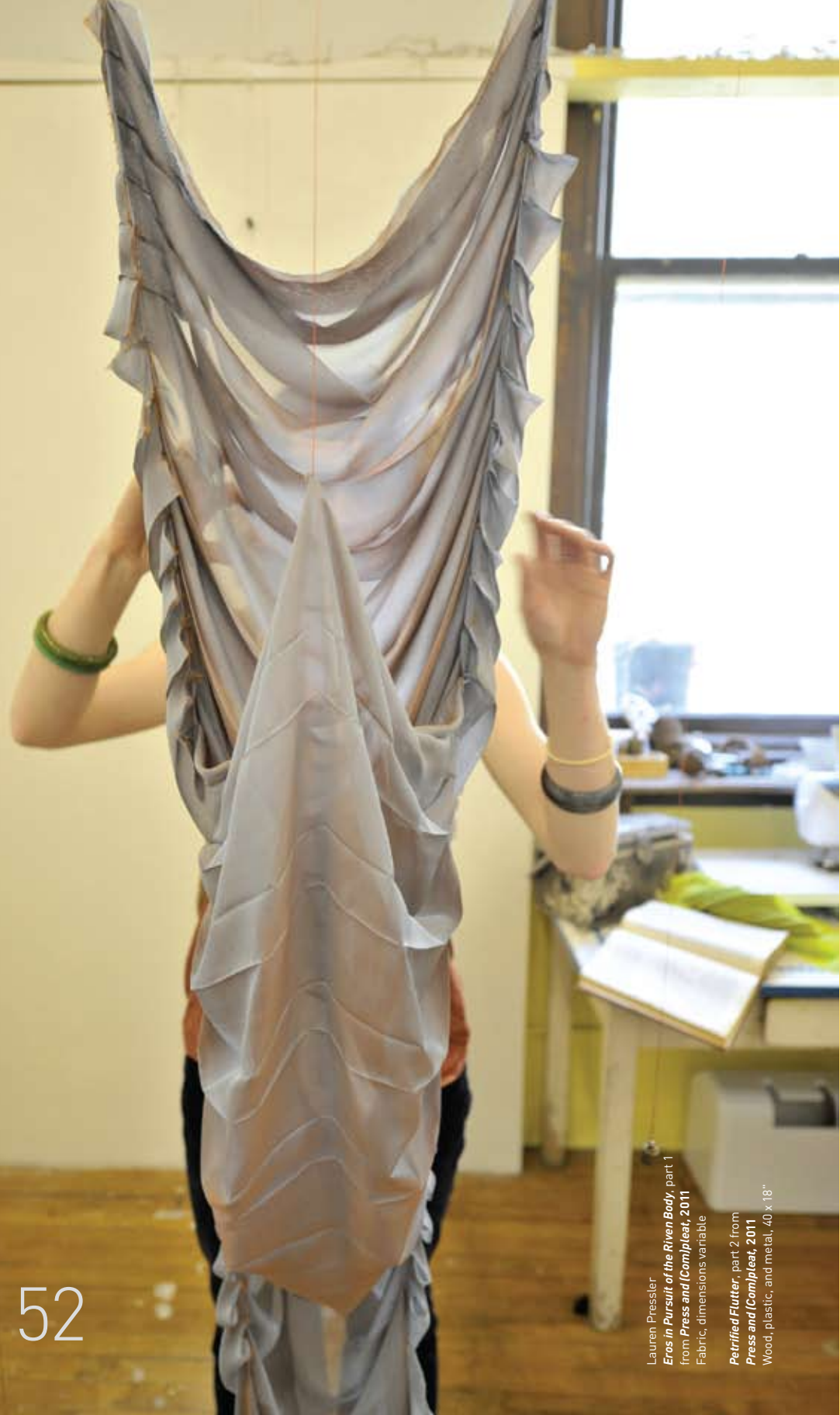
Lauren Pressler Eros in Pursuit of the Riven Body , part 1 from Press and (Com)pleat , 2011 Fabric, dimensions variable Petrified Flutter , part 2 from Press and (Com)pleat , 2011 Wood, plastic, and metal, 40 x 18"