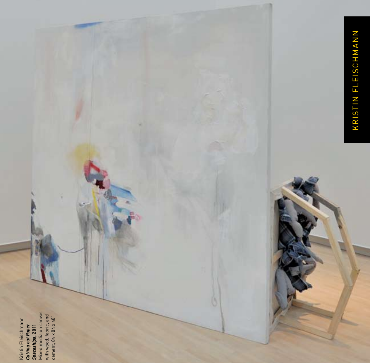
Kristin Fleischmann Cutting out Paper Spaceships, 2011 Mixed media on canvas with wood, fabric, and cement, 84 x 84 x 48"

Outside, fabric tubes shape a beginner's question: What is a little boy? An answer: Blue plaid, with unexpected projections. But the blue is soft and hand-stitched, domestic with plastic buttons. Its form reflects your early mind with its clumsy tentacles of thought. A rudimentary mathematics: girl to boy, and vice versa, the addition and subtraction of parts.