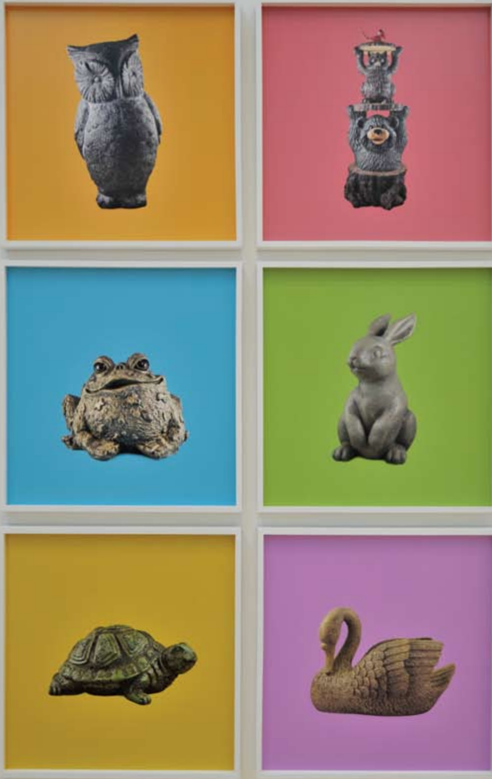
Andrea Degener Owl, Totem, Frog, Rabbit, Turtle, and Swan , from Object Series 1, 2011 Six digital C-prints, 30 x 31" each

Culture has its curiosities. We all interact with them in some shape or form, be it aware or unaware of their constant presence. To present one of culture's oddities is to challenge its form and function in a new way that cannot be found in normal contexts.