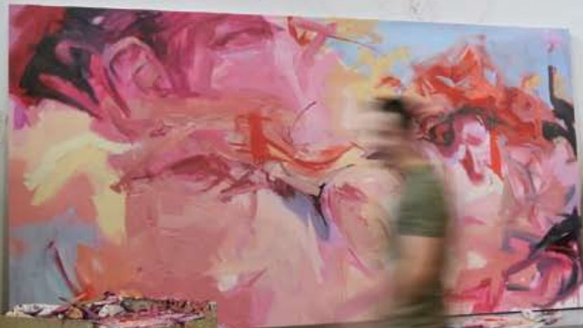
Jordan McGirk Rupture, Rapture , 2011 Oil on canvas, 84 x 120"

There is a trajectory to these paintings. The bodies become less and less defined until it seems they have exploded into the very energy that formed them. In the final painting, Rupture, Rapture , the face is merely an outline in a corner of the vast canvas. Elsewhere there is an ear, an eye—the body is disintegrating; its reds and pinks and deep yellows give way to the blue of world, encroaching the borders like bliss.