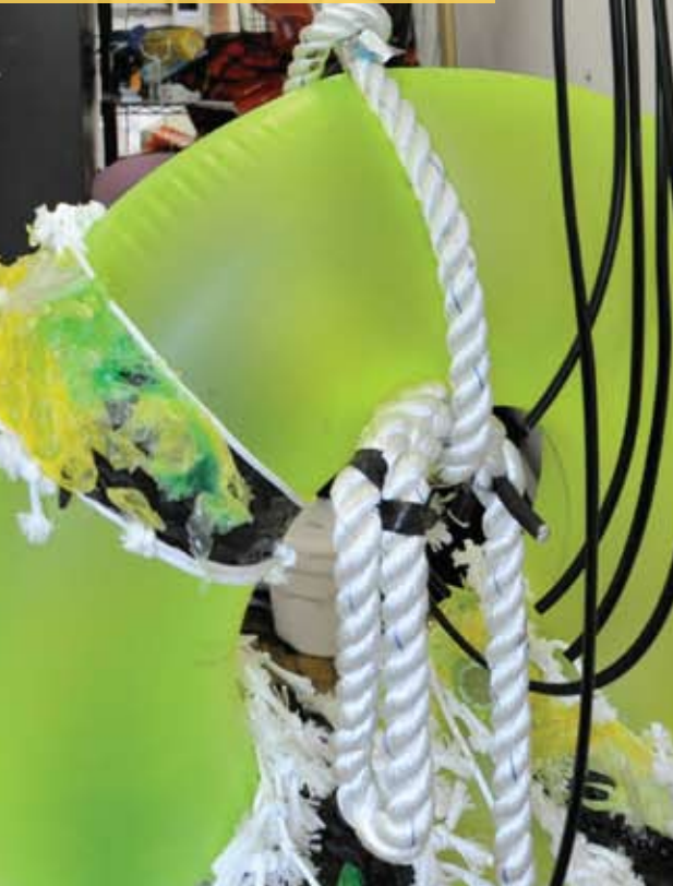
Kara Daving Rainbow to windward, foul fall the day, / Rainbow to leeward, damp runs away, / Put plastic in our future, the human odyssey may conclude, / Put plastic in our past, and amend this here feud., 2011 Acrylic, plastic, and mixed media, 168 x 84"

Gold was not found, only plastic debris As if a distant land were on a consumer spree