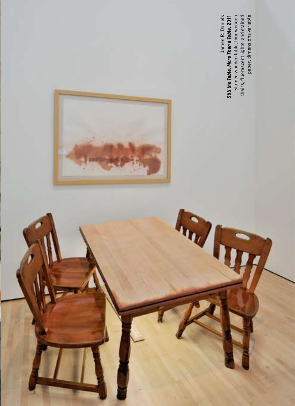
James R. Daniels Still the Table, More Than a Table, 2011 Stained wooden table, four wooden chairs, fluorescent lights, and stained paper, dimensions variable

I am interested in working with a range of objects for three distinct reasons: the materiality of the object that provides it with its idiosyncratic features; the object's ability to represent something outside of itself through the forming of an association, with the potential for the artist to either embrace the inherent association or modify it; and the object's capability to construct narratives based on metaphor.