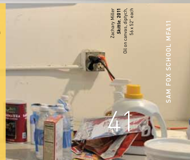
Zachary Miller Skittle , 2011 Oil on canvas, diptych, 56 x 52" each

My artistic practice investigates color as it pertains to painting and consumer culture. Researching this vein has generated a body of work that mixes the chromatics of consumer goods packaging with the canvases of color field abstraction. Branding's trademark colors make up the commercial surfaces of our common experience. Exploring how they intersect with a painterly notion of color has allowed me to consider the contemporary moment through an oblique angle.