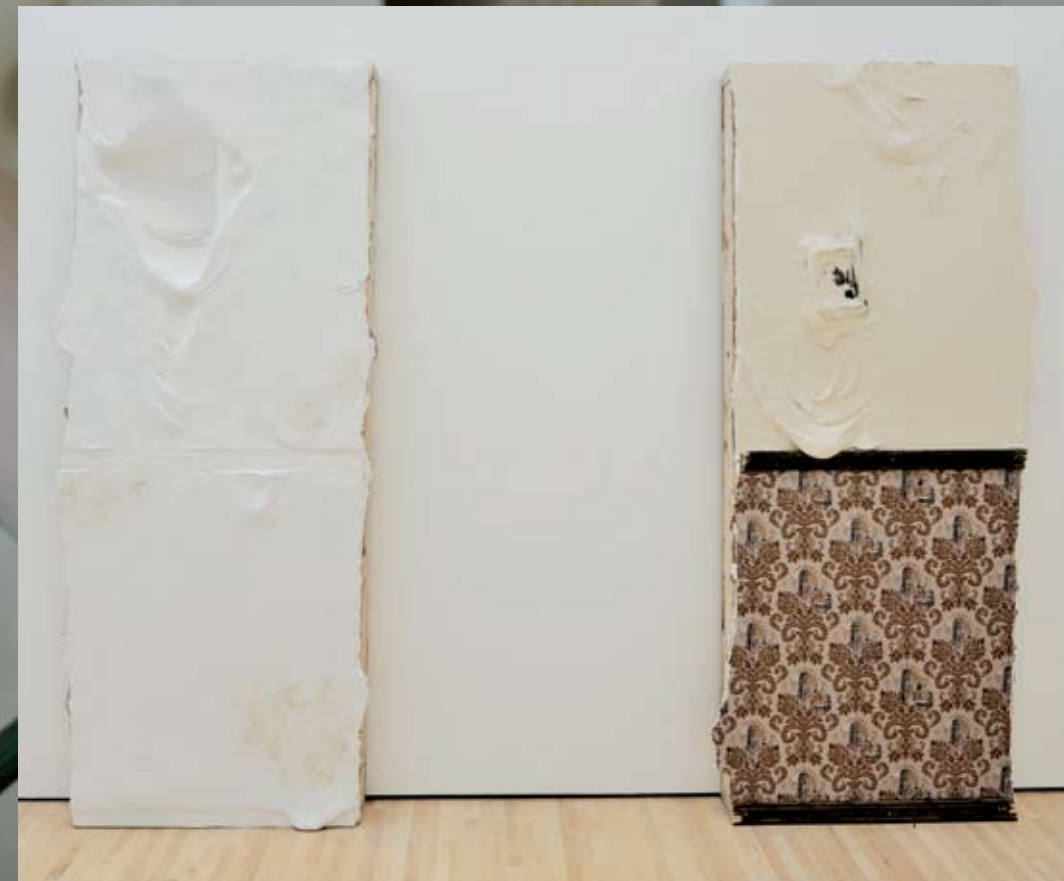
Whitney Sage My City, My Home, My Body , 2011 Drywall, wood, joint compound, and ink, 84 x 32 x 6" Whitney Sage My City, My Home, My Body , 2011 Digitally printed wallpaper, drywall, wood, latex paint, ink, joint compound, and picture frame with postcard, 84 x 32 x 6"

nor is it voyeuristically aestheticized. Rather, one gets the impression that in this work, Detroit is seen through the eyes of an insider, which is indeed what Sage is. Her work bears the scuffmarks and indentations of domestic use; these blemishes are traces of previously extant bodies. A crooked picture frame—containing a postcard of Detroit's Book Tower, a memory of a brighter era in a struggling city—is devoured by an amoebic wall. Book Tower reappears below, subtly inlaid into the florid wallpaper that is echoed in a decorative low relief in the other panel. This design is a visual staccato to an otherwise neutrally colored, smoothly surfaced work. When these details are considered, the works' signification—of Detroit, its structures, and the bodies within them, past and present—becomes apparent. In the attention to detail with which Sage has carefully, if not lovingly, constructed her works, a quiet, insistent spirit of Detroit persists through the rubble.