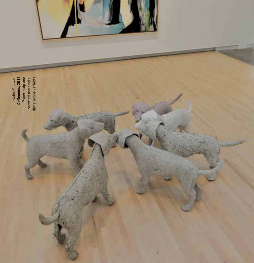
Katie Millitzer Colloquies , 2012 Paper pulp and recycled materials, dimensions variable