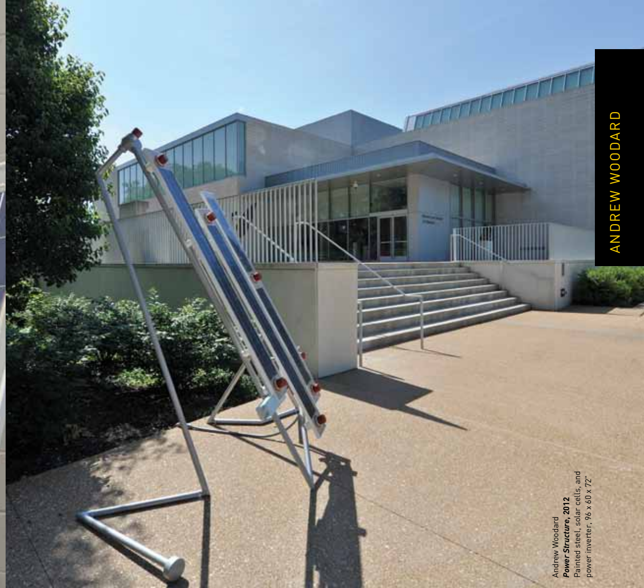
Andrew Woodard Power Structure, 2012 Painted steel, solar cells, and power inverter, 96 x 60 x 72"

My research and artistic production in the field of public sculpture have been influential in my decision to base my practice upon solution-driven tactics. Through embedding energy-producing devices in my work, I am invested in the creation of art that interfaces with the public both visually and pragmatically. My ideological basis stems firstly from an admission that our current way of life is unsustainable and has wrought devastating impact on our environment, culture, and communities.