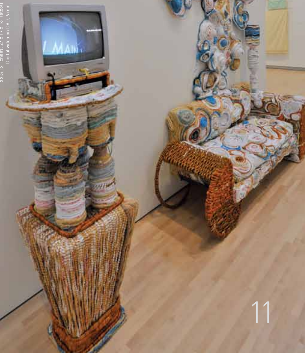
Ifeoma Ugonnwa Anyaeji Oche Onodu (Sitting Chair) , 2012 Repurposed plastic bags, bottles and cans, metal rods, wood, and twine, 120 x 67 3/16 x 55 3/16" (chair); 27 x 17 x 16" (stool) Digital video on DVD, 6 min.

Aesthetic recycling should not end in protest against high culture and beauty, as seen in subversive forms of much contemporary art. Neither should reuse be allowed to drift into a mere panoply of reclaimed materials. There should be an alliance to foster intervention and function since the problem of environmental waste is one that affects all fields. As much as I see the limitations of recycling, the intention of my work is not to oppose it nor to criticize its drawbacks. Rather, I call for alternative systems to environmental waste disposal practices: a creative practice that offers more pragmatic solutions rather than strictly visual commentary.