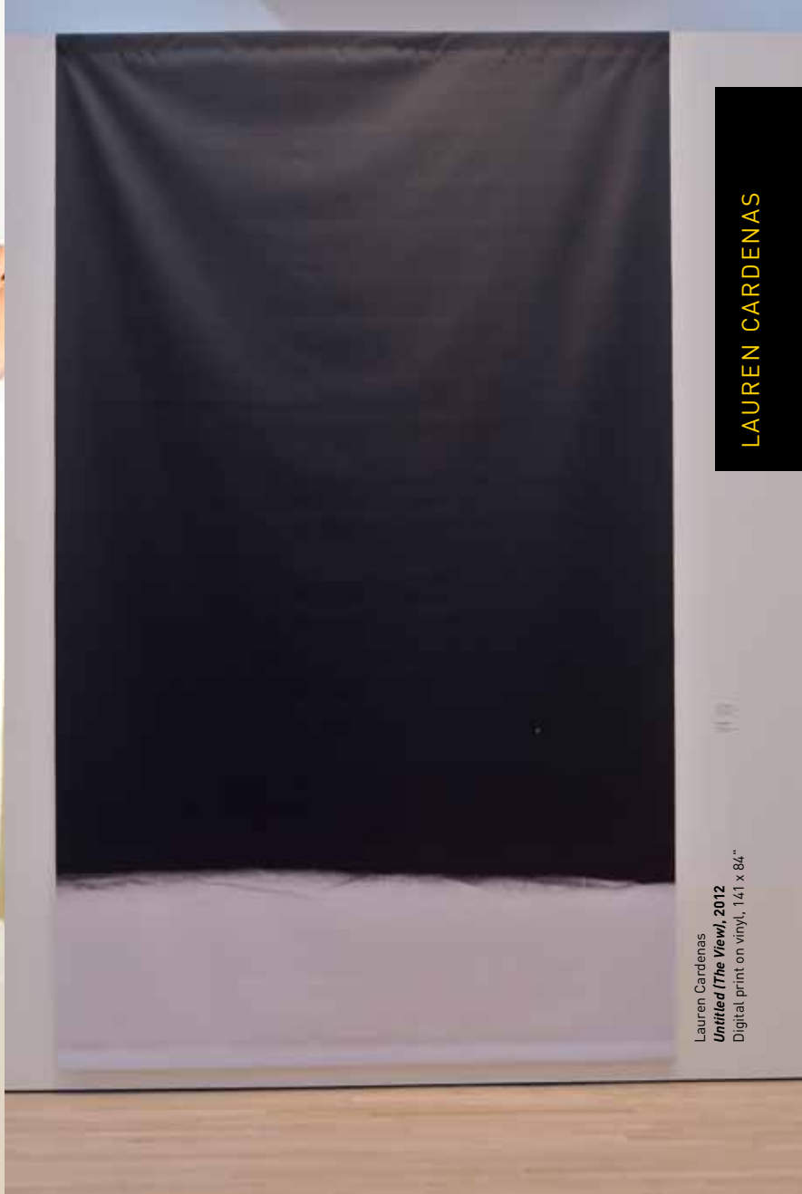
Lauren Cardenas Untitled (The View), 2012 Digital print on vinyl, 141 x 84"

While not a meditation on mortality per se, the work tethers us to something else. Time exists only as a single moment when the final separation of the mind from the body has a point of happening. In this sense the work is a rehearsal of an encounter with something perhaps called "the infinite." Or perhaps it is only a prescient gift, remembering forward. The artist gives a gift here not of herself, but as a messenger from the void she has come to know.