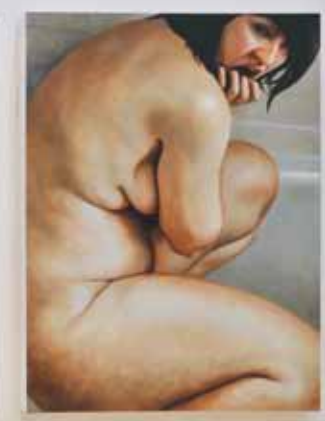
Natalie Baldeon To the Core , 2012 Oil on canvas, 48 x 36" Disjunction , 2012 Oil on canvas, 48 x 64" Autophagia (Now I Have Everything) , 2012 Oil on canvas, 48 x 36"