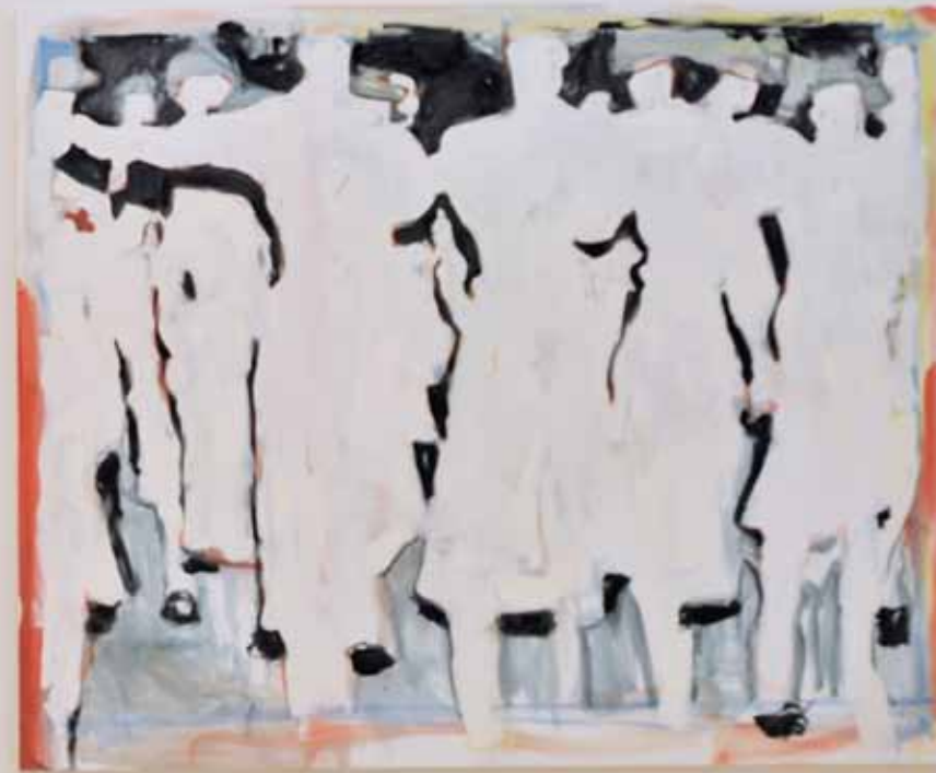
Michael T. Meier Under the Influence , 2012 The Frequency of Things , 2012 Oil on canvas, 69 x 84," each