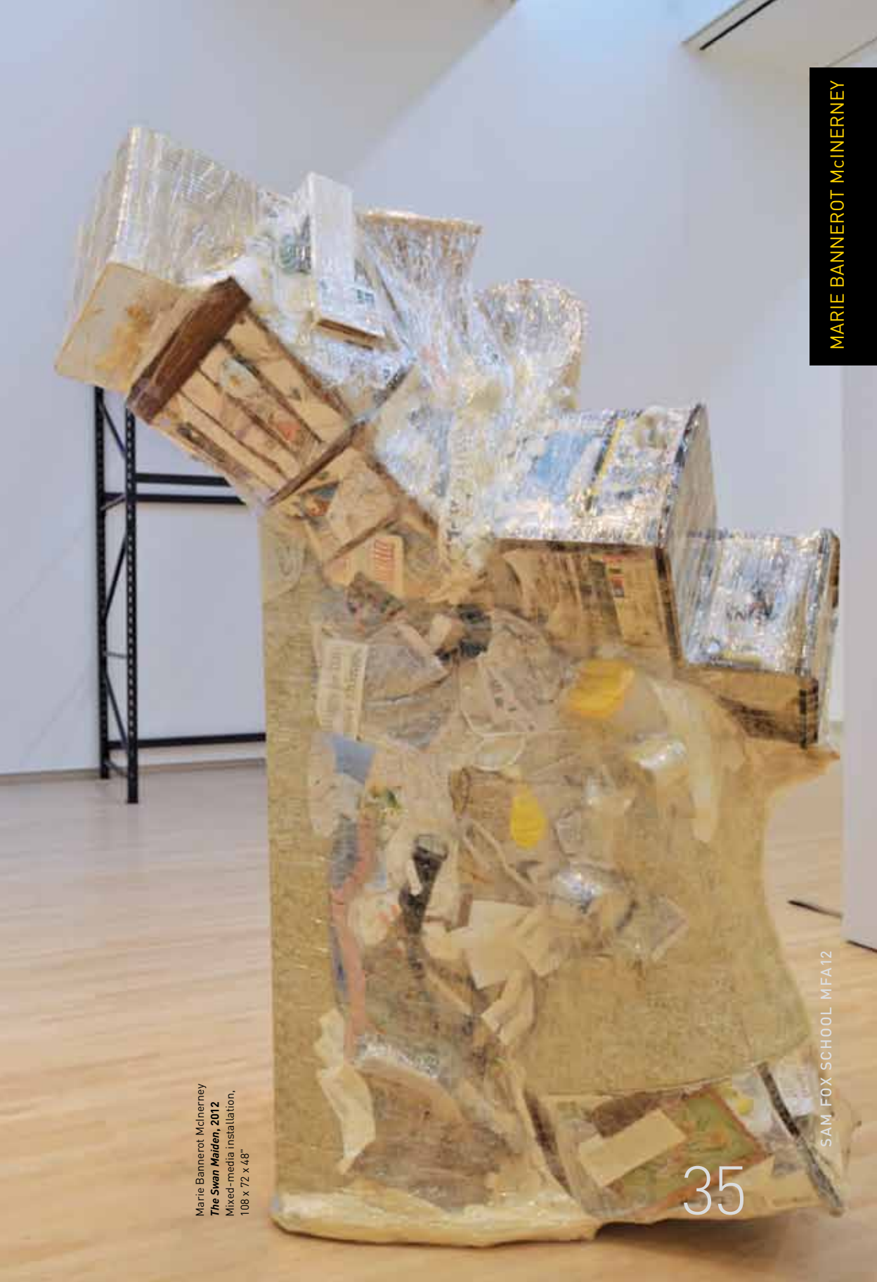
Marie Bannerot McInerney The Swan Maiden , 2012 Mixed-media installation, 108 x 72 x 48"