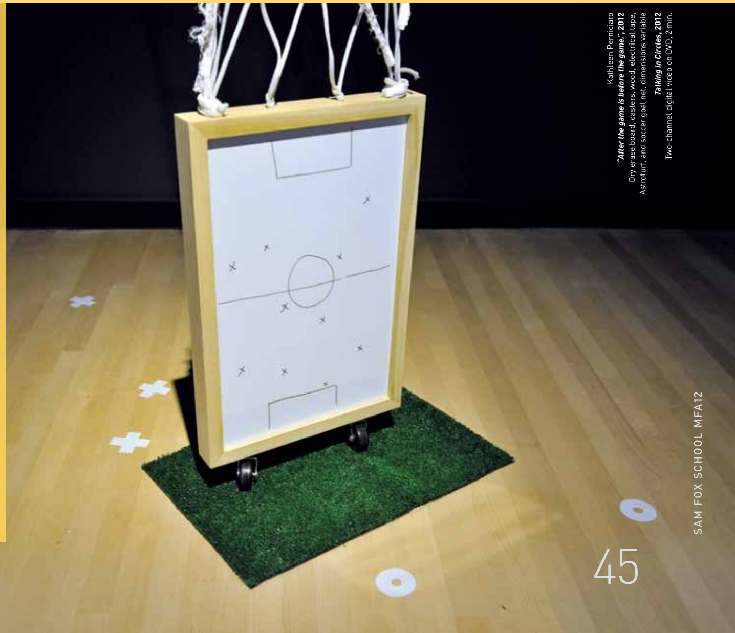
Kathleen Perniciaro "After the game is before the game." , 2012 Dry erase board, casters, wood, electrical tape, AstroTurf, and soccer goal net, dimensions variable Talking in Circles , 2012 Two-channel digital video on DVD, 2 min.