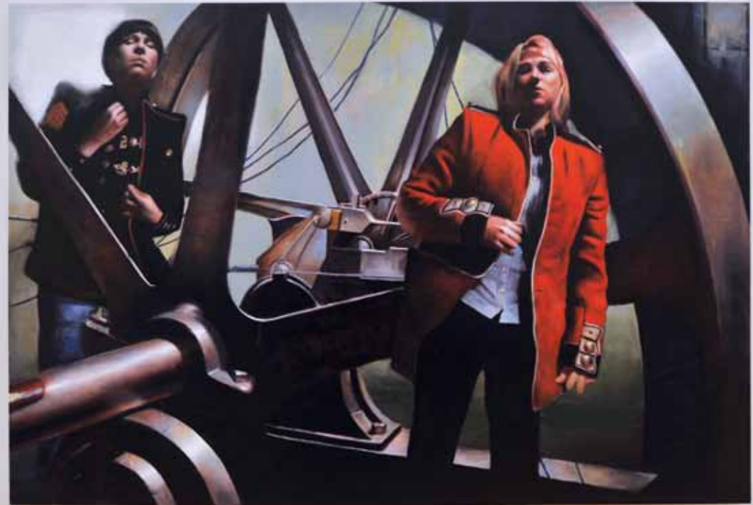
E. Thurston Belmer Still Life, 2012 Oil on canvas, 81 x 120"