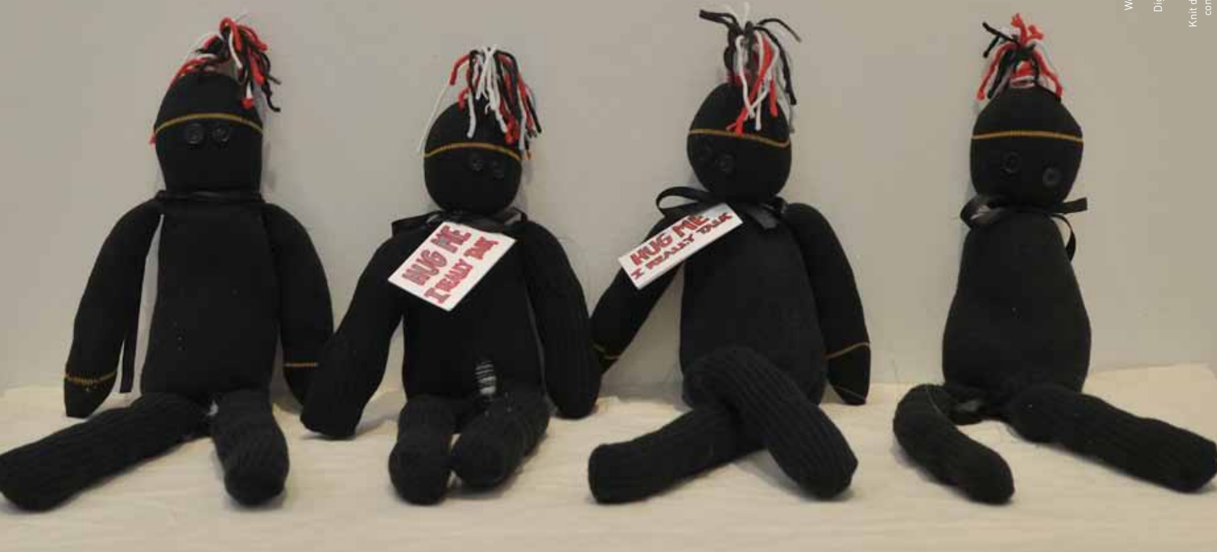
Erin Falker Jezebel , 2012 Wood wall, molding, fabric, and stepstool, 96 x 36 x 6" Digital video on DVD, 13:24 min. They Really Talk , 2011 Knit dolls on wood shell with audio component, dimensions variable