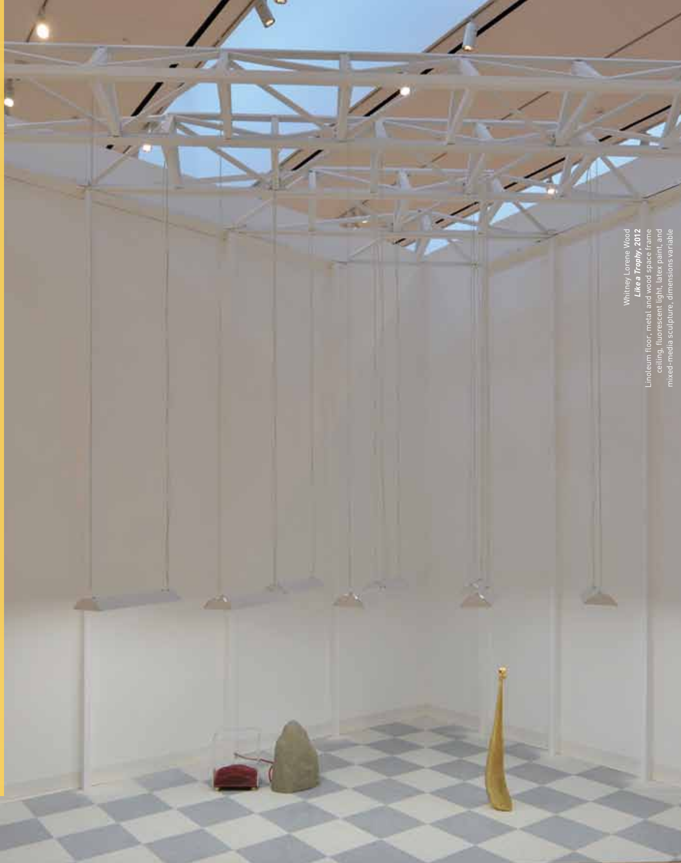
Whitney Lorene Wood Like a Trophy , 2012 Linoleum floor, metal and wood space frame ceiling, fluorescent light, latex paint, and mixed-media sculpture, dimensions variable

Because the machine won't stop. Like a Trophy knows this, and yet still performs our frail beauty, our silly sex. "You are the uninitiated," the hero declares, "and you arrive missing your instruction manual." Wood's cast of characters are profound not because they are lost souls, but because they have souls to lose. And lose and lose and lose.