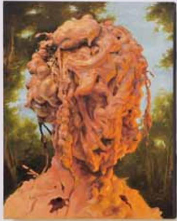
Adrian Cox Border Creature: Portrait I, 2011 Oil on canvas, 31 x 24" The Lovers, 2012 Oil on canvas, 34 x 47" Border Creature: Portrait III, 2012 Oil on canvas, 31 x 24"