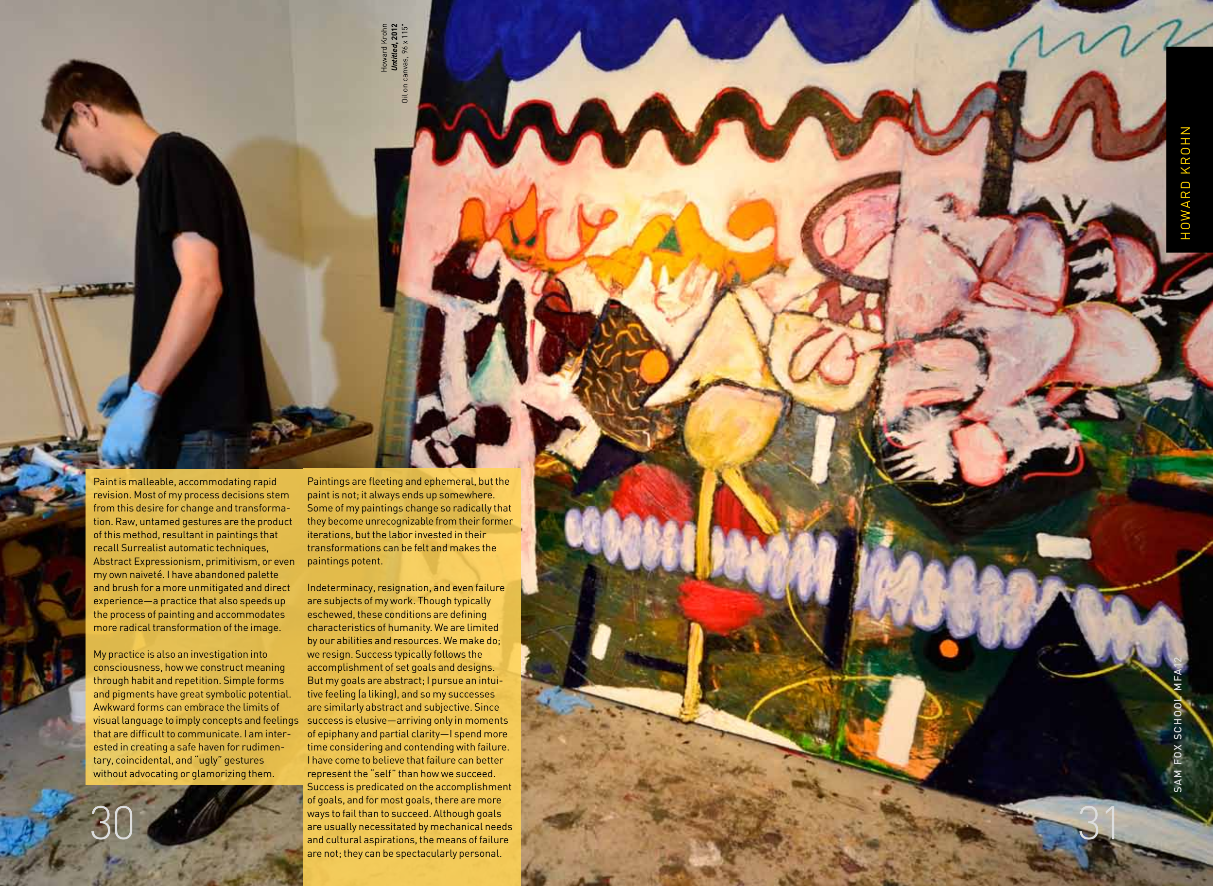
Howard Krohn Untitled, 2012 Oil on canvas, 96 x 115"