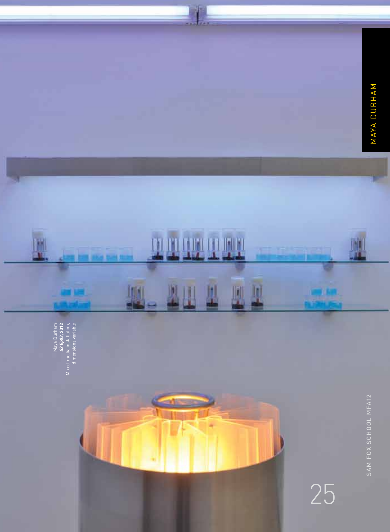
Maya Durham 52 Ep03, 2012 Mixed-media installation, dimensions variable

Long after the catastrophe and the girl's disappearance, the white coats remembered her final creation, the way it huddled wetly in the petri dish. When she shone a light upon its translucent skin, the white coats saw a matrix of veins plunging, twisting deep through the shivering flesh. Only then did it take its first breath.