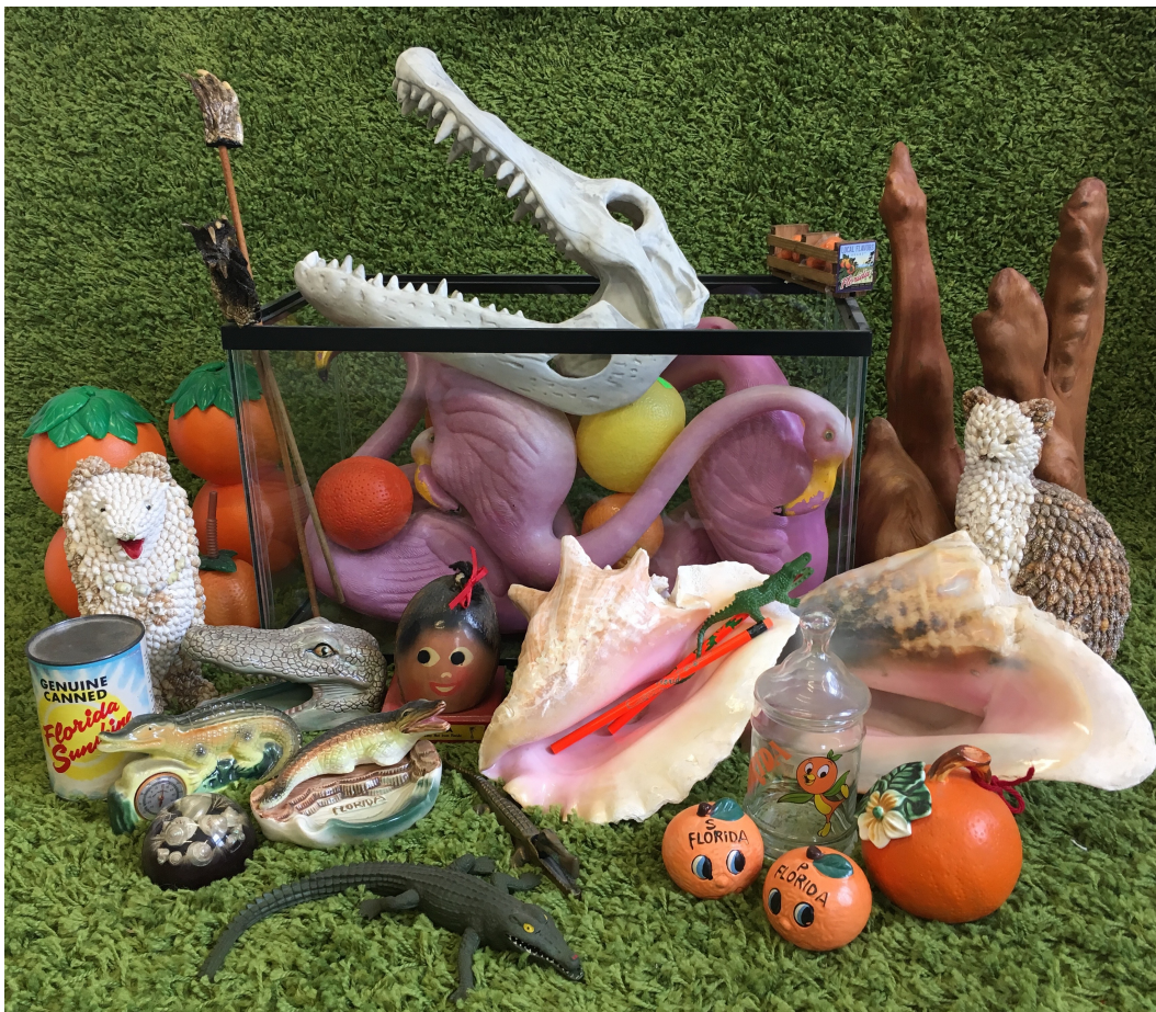
Figure 1. Selection of Florida souvenirs from my personal collection.

Florida is built on the artificial. The state is heavily reliant on tourism, selling itself as a tropical paradise where palm fronds sway in the breeze as you sip an ice cold mojito on the beach. Take a stroll through any of the palm tree-lined streets and you will find front yards dotted with hot pink plastic flamingos, Florida's true local wildlife. Kitsch is the state's number one export. Stop at any gas station, grocery store, or seaside motel and I guarantee that you will find a delightfully tacky souvenir that perfectly encapsulates what it is to be in Florida.