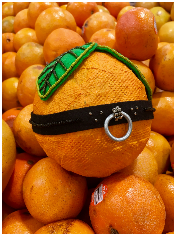
Figure 11. Juicy Fruit , 2018. Papier mache, felt, glass beads, wire, 4 inches round.

how a Queer orange, specifically would look. How could I put a little of my Queer Floridian self into the orange? I wanted to give the orange a fresh twist, to squeeze out the rotten, homophobic past, and make it a citrus for all. I have this one collar I purchased from a designer in Chicago. It's sparkly black vinyl with a small O-ring hanging off of the front. I had it sitting on my desk and then the thought crossed my mind: what if I put my collar on the orange? So I did. I fashioned a miniature version of the collar out of felt, beads, and metal and placed it around the body of a brightly painted papier mache orange.