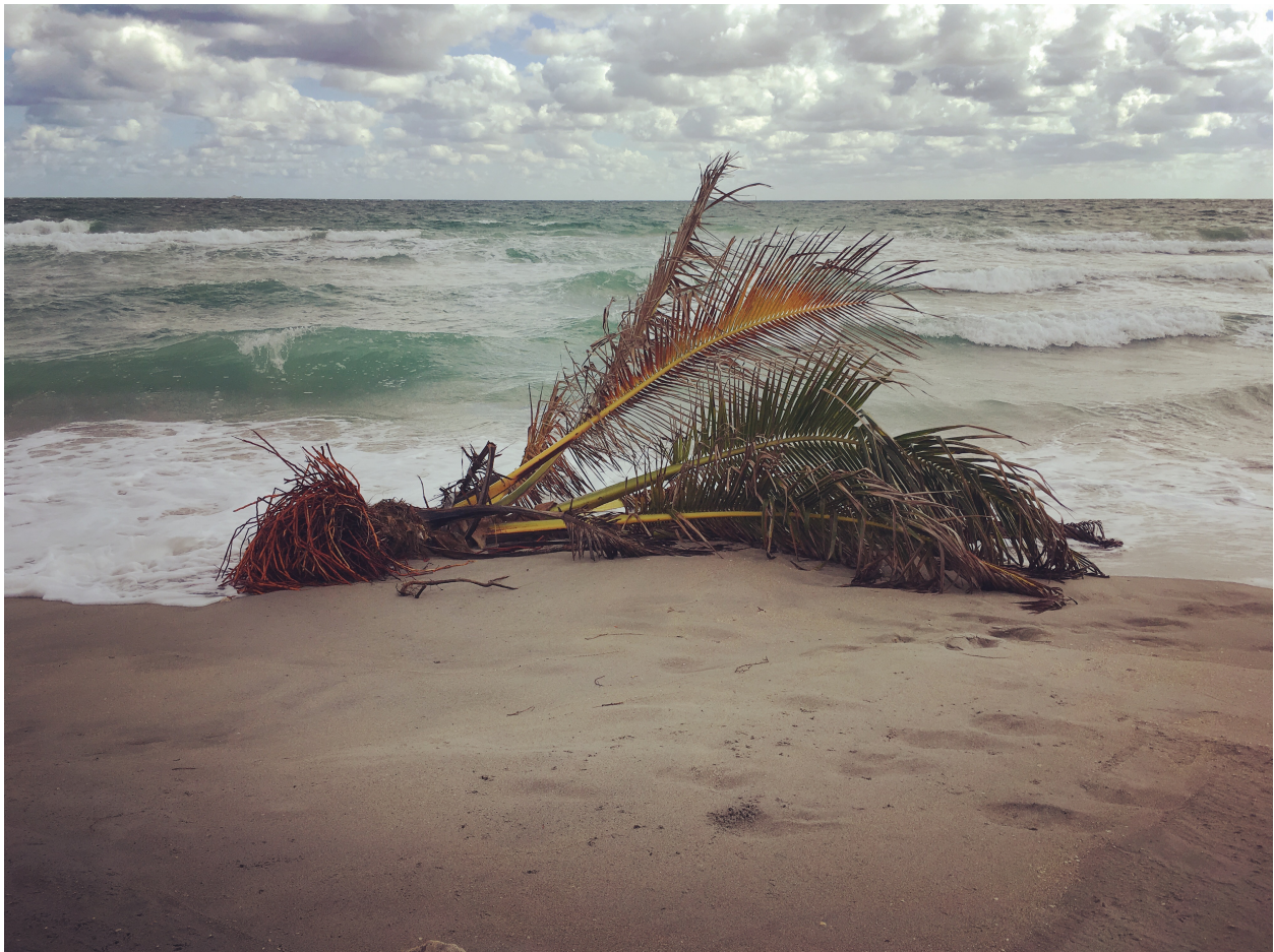
Figure 8. An uprooted palm laying at the water's edge. Hollywood, Florida.

Sand reflects the stars at night. Sitting close to the ocean's edge, one can scoop away the top layer of sand, made warm by the rays of the sun earlier that day. One can swiftly drag a hand across the freshly exposed sand and take in dozens of quick, little light blips. Tiny little bioluminescent Noctiluca wake up and glitter for barely a moment in time before they gently fade back to their unlit state. The faster you create friction in the sand, the more it reflects the night sky, a whole universe just beneath your feet.