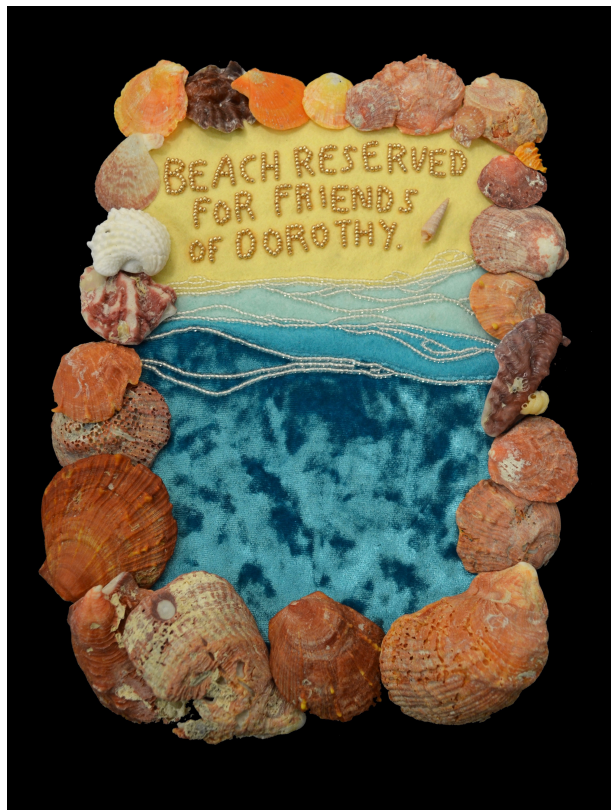
Figure 7. Dorothy , 2019. Fabric, glass beads, shells, 7x10 inches.

Like many Queer landscapes, the gay beach is endangered. With the ever expanding effects of global climate change, Queer beach communities are under threat from rising sea levels. These places are low-lying sand patches that are barely above sea level. When the water begins to creep in, these spaces will drown. The histories that have shaped these Queer places will vanish with it.