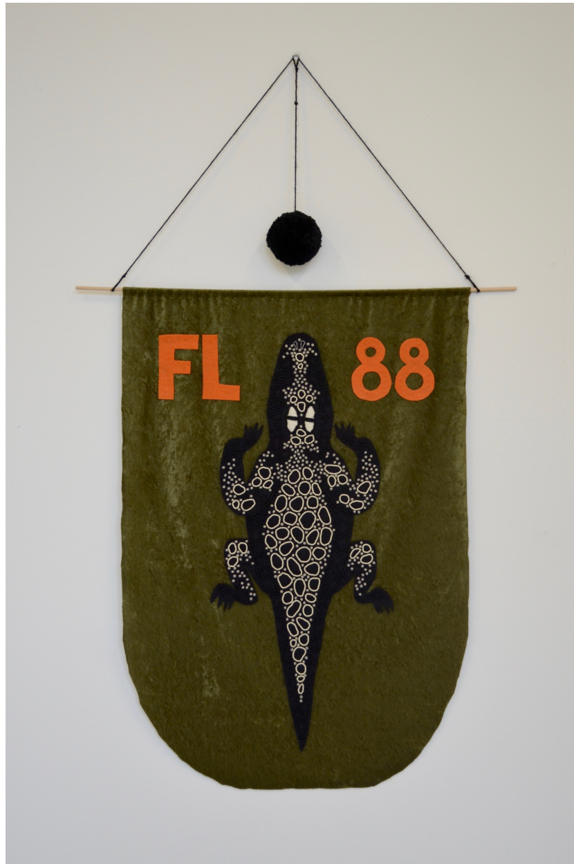
Figure 5. Birth , 2018. Fabric, glass beads, felt, yarn, 40x21 inches.