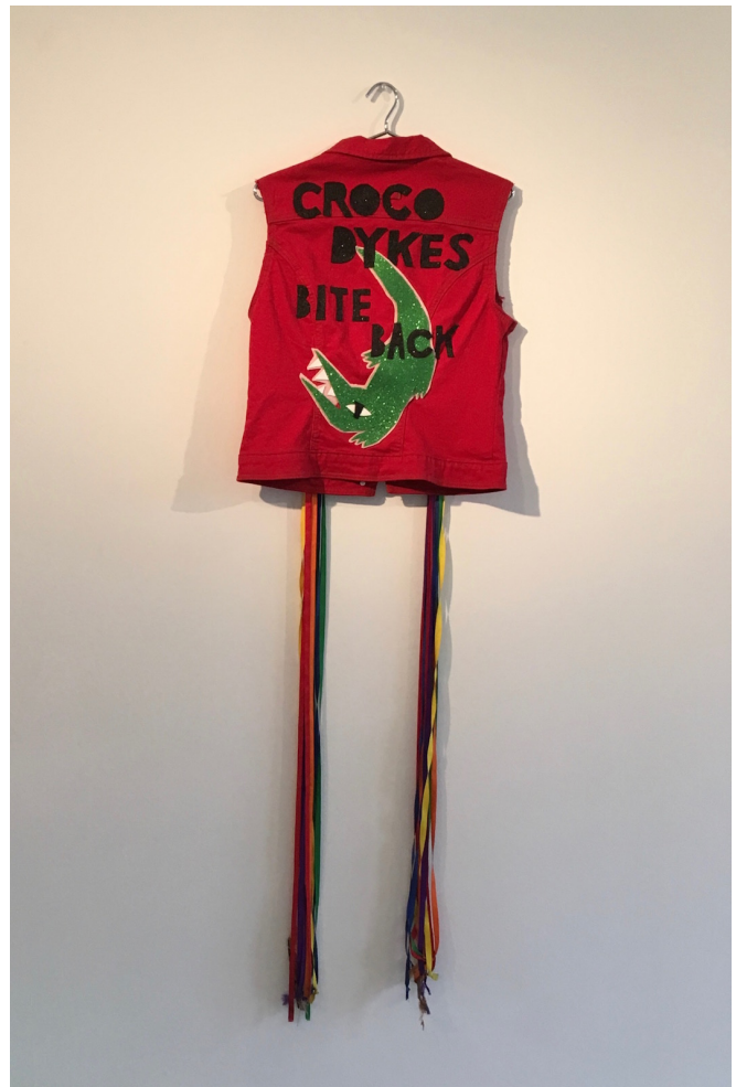
Figure 13. CrocoDykes Bite Back , 2017. Jean vest, felt, ribbon.