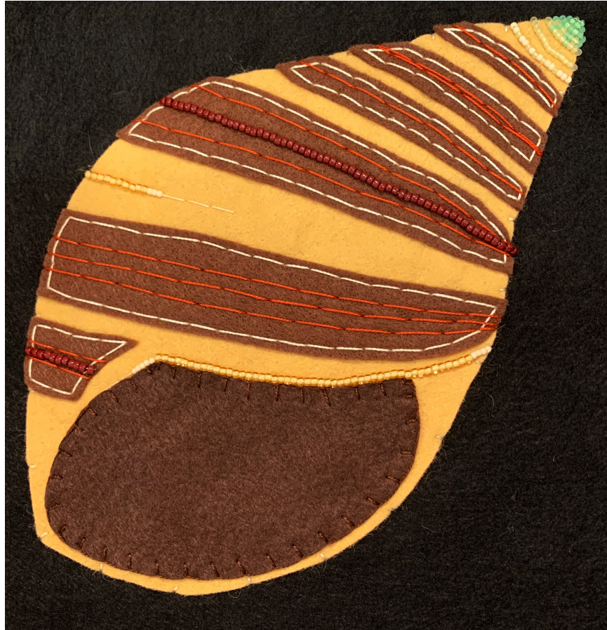
Figure 17. June 12, 2016 (quilt panel detail), 2019. Felt, glass beads, thread, 9x9 inches.