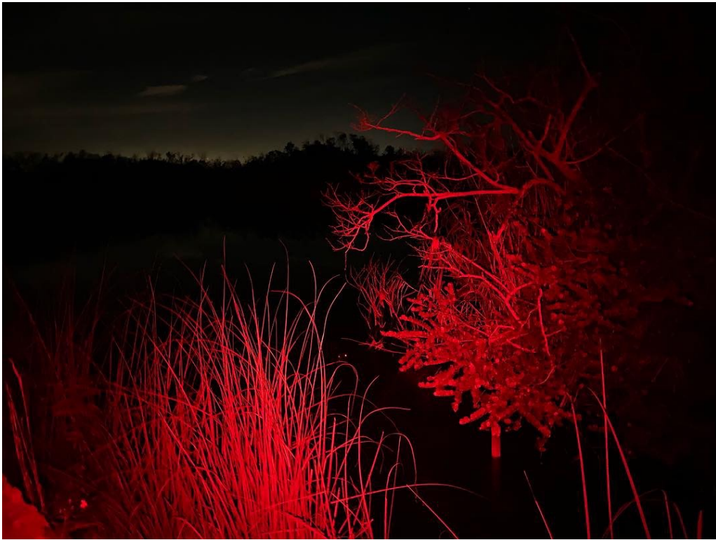
Figure 3. Alligator peeking out from a pond at night in the Everglades.

The alligator has become a fixture within my work, in particular, within my sculptural, installation-based work. In the fall of 2017 I created Darla, an alligator who lived within an installation critiquing Anita Bryant and Florida orange juice. At first, the alligator was a stand-in for what a Queer person looked and acted like according to Anita Bryant. She believed that Queers were scary and evil, and were trying to “recruit” children. Similar things have been said about gators, except they are accused of eating children as opposed to recruiting them. All of these statements are simply not true.