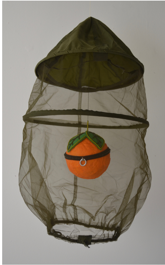
Figure 10. Mosquito Mesh Hat No. 1: Citrus Queen , 2018. Mosquito hat, papier mache, felt, glass beads, wire.

No matter how many times people have taken actions to ensure the silence and erasure of the LGBTQIA community, the queers have risen up. We've fought hard. We, the Queers, have always existed and evolution has made us unforgivingly resilient.