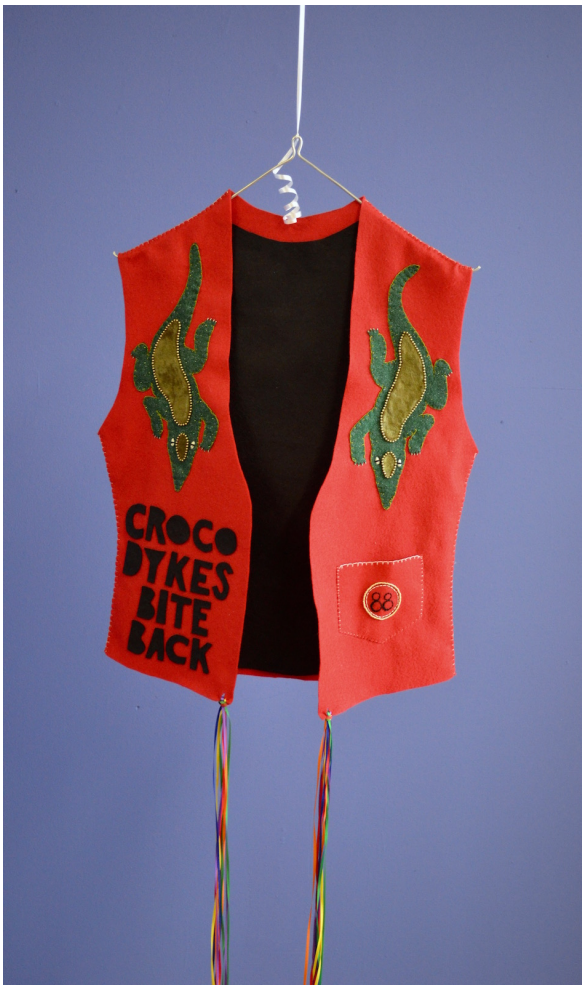
Figure 12. CrocoDykes M.C. , 2018. Felt, glass beads, thread, ribbon, wire.