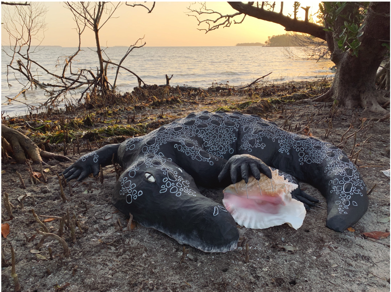
Figure 6. Come to Me (Spring 2012) , 2018. Papier mache, wire, conch shell.