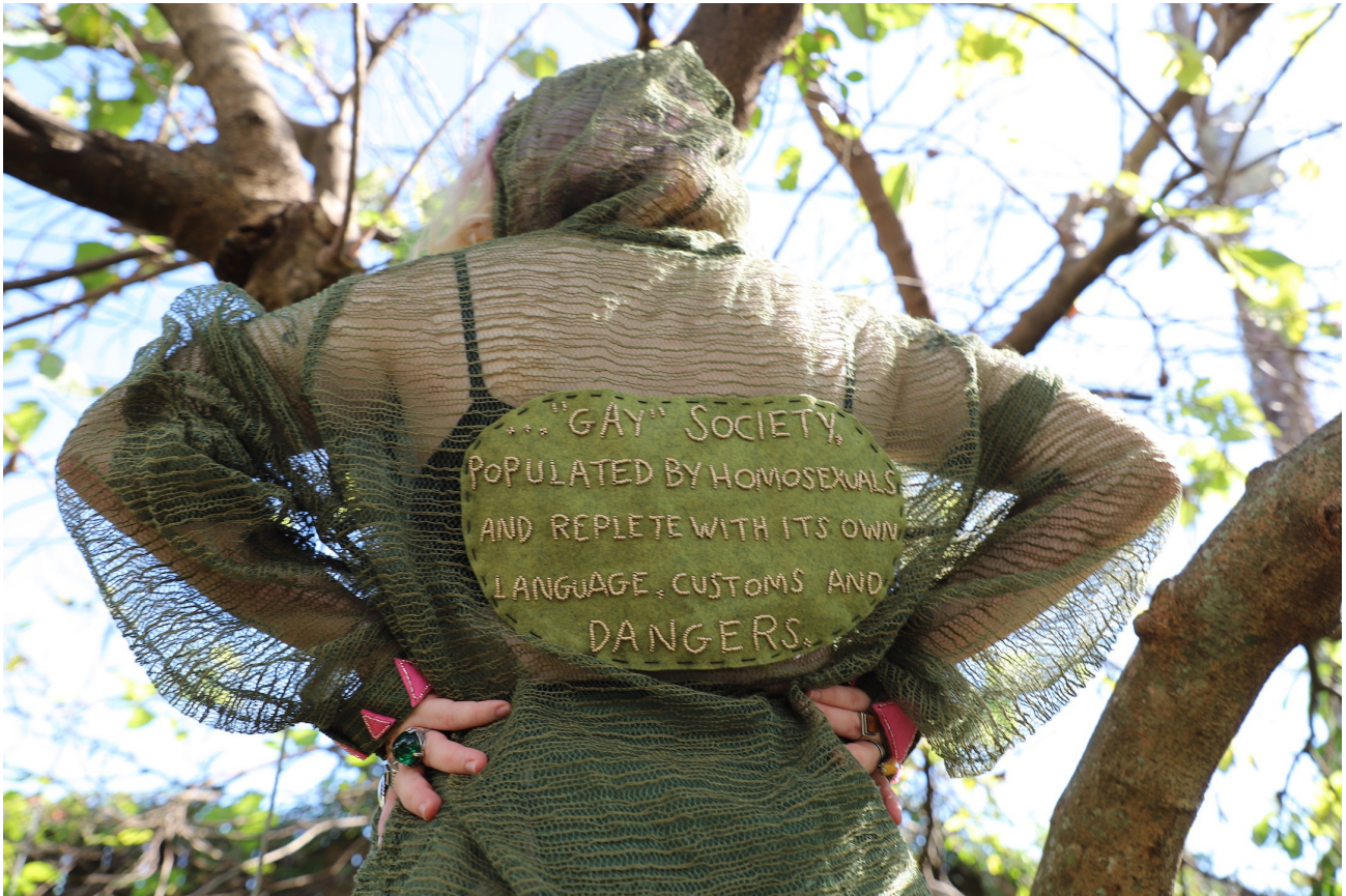
Figure 9. Mosquito Mesh Jacket No.1 , 2018. Jacket, glass beads, felt.

Mosquito Mesh Hat No. 1: Citrus Queen serves as a symbol for protecting the Queer life. Queer existence is represented by a small kinky orange inside of the hat. It floats gently in the center of the hat, protected by the mesh which represents the power of LGBTQIA community. It also important to note that according to The Leatherman's Handbook , mosquito netting is used to flag for outdoor sex. 14 Flagging is a form of nonverbal communication within Queer spaces. It's a language purely based on colors, textures and accessories. Outdoor sex was and still is prevalent in the LGBTQIA community, especially in cruising culture where people often meet in parks and open spaces looking for anonymous sex.