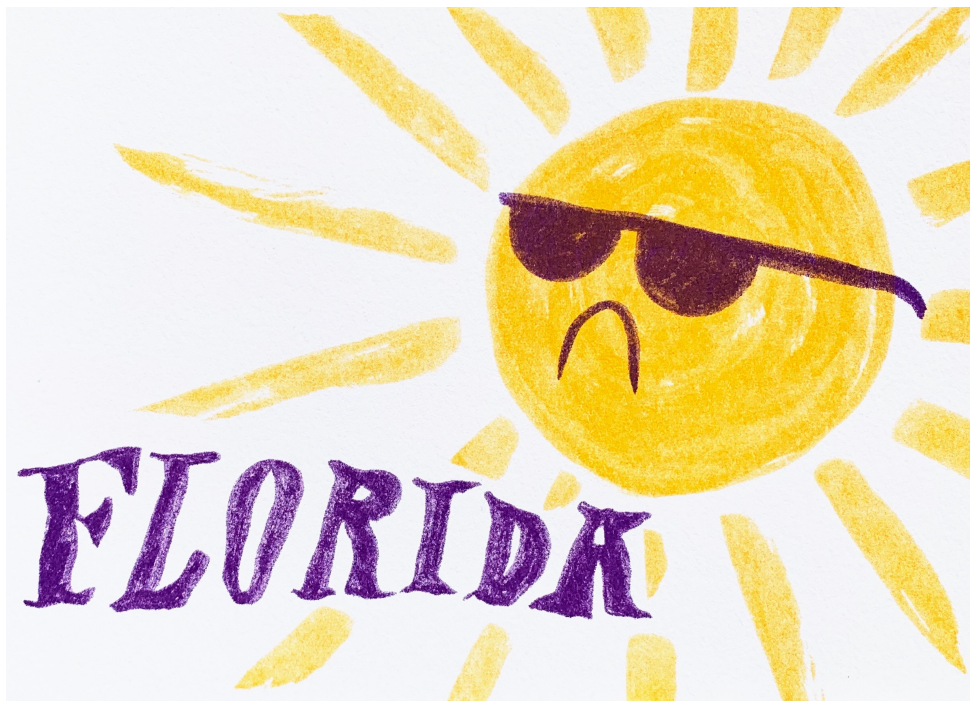
Figure 2. Bitter Baby Sunshine , 2019. Risograph, 5x7 inches.

My studio is my habitat. It's my home away from home. It's a place that is filled with cozy shag rugs dyed a soft shade of grass green. The walls are covered in Florida memorabilia: photos of the Everglades, postcards from Miami Beach, and plastic citrus. And I'm not the only one who calls my studio home. Two very large papier mache alligators reside in my creative space. Florida's kitsch is designed to bring joy to peoples' lives. My work is heavily inspired by the things people buy in order to remember their time in the state.