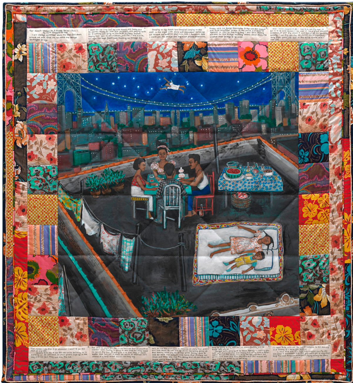
Figure 14. Faith Ringgold, Tar Beach (Part I from the Woman on a Bridge Series) , 1988. Acrylic on canvas, bordered with printed, painted, quilted, and pieced cloth, 74 5/8 x 68 1/2 inches.