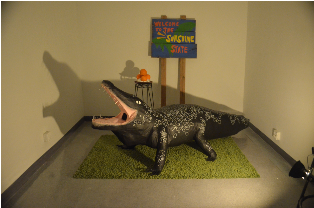
Figure 4. Give Her What She Wants , 2017. Installation including Darla the alligator.

hurt anyone. The alligator I've created to fill in for me is highly stylized. It maintains a fairly true-to-form body but instead of being a dark, blackish green, it is black with white line circles. The form is simplified and is a reference to my appreciation of the graphic nature of printmaking (a discipline I studied for several years in undergrad, and a field I went on to work in at several professional printshops).