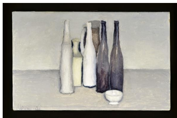
Giorgio Morandi, Still Life , oil on canvas, 10 1/16 x 15 3/4 in, 1957 11

With paint, Morandi creates a new identity for a wine bottle, or an empty jar. Often sitting in my studio, when I wonder about one fellow artist, my mind wanders to another. That is happening now as I write. Joan Mitchell comes to mind as I think about creating narratives among objects, creating a presence with paint, from an absence.