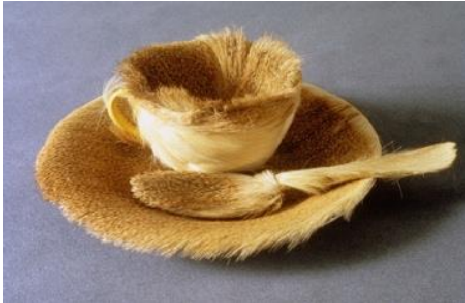
Meret Oppenheim, Object , fur covered cup saucer and spoon, cup 4 3/8" (10.9 cm) in diameter; saucer 9 3/8" (23.7 cm) in diameter; spoon 8" (20.2 cm) long, overall height 2 7/8" (7.3 cm) 1936 17

W. J. T. Mitchell asserts that “painting is likened to a shedding of feathers and the smearing of shit and the principal function of the eye is to overflow with tears....there are not purely visual media because there is no such thing as pure visual perception in the first place.” 18 My lamp hats shed feathers to the tune of “tchk tchk tchks” and Meret Oppenheim’s cup grows fur at a different speed with a wholly different frequency of sound altogether. This takes us back to the discussion of “ginger ale.” Oppenheim’s cup is not a functional one. Because the cup grows fur, it takes on the narrative of a creature, a living thing. As far as I am concerned, it is visual ginger ale, and thus begs the question: what sound does a furry cup make?