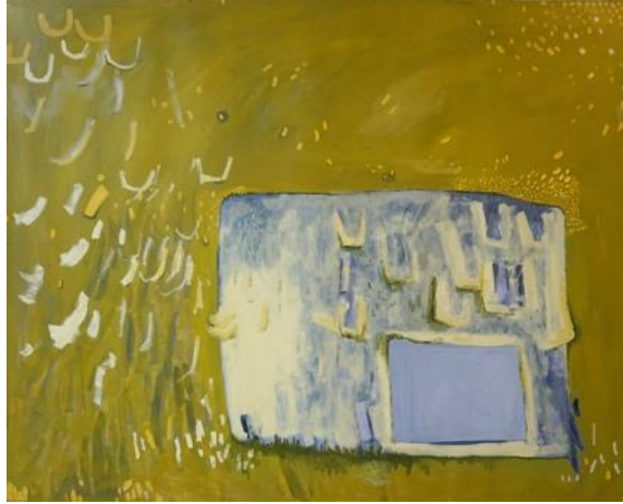
Sara Weinger Feathers , oil on canvas 56 x 70in, 2018

There is an exterior, the physical house, the structure, the frame, that which we can see. The house itself is composed of materials, wood, steel, the foundation, the plumbing, the walls, the insulation. Once inside the house there are rooms. The rooms are filled with objects. The house is made up of many things and those things too, of many things. Inside the finite object of the house, within its interior spaces, exist infinite objects and spaces. The object of the house is not singular.