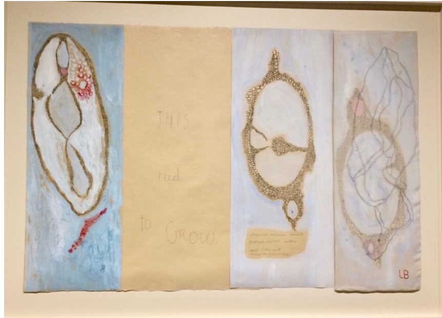
Louise Bourgeois close up photograph I took from The Red Sky at Hauser & Wirth Los Angeles

One can enter a room filled with the work of another artist and sense the thread that holds her in place within one's own artistic lineage. There is something about seeing artwork in real life, visually bumping into it, walking into a room and feeling something, having an experience that lets me know I am working with this person, sitting at their table, we're talking about something, I am an artist, she's an artist and I have never met her but I can feel her. When I am in the studio, I am talking to her and when I am in front of her work she is talking to me.