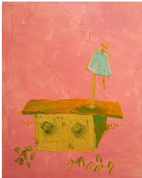
Sara Weininger Dresser Drawer , oil on panel, 10 x 8in 2017

I sat on the floors on many rooms when I was very little. I could hear people talking about things bigger than me. To escape these things I dug for crayons and paper in a crowded knapsack. With these, I made my first drawings.