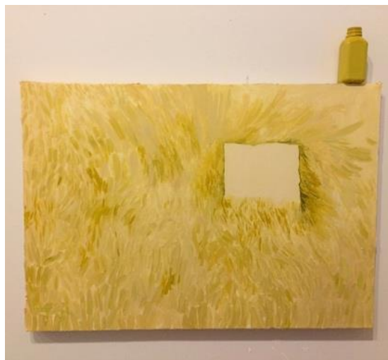
Sara Weinger, Blonde Feathers oil on canvas 26 x 37in 2018

There is an exterior, the physical house, the structure, the frame, that which we can see. The house itself is composed of materials, wood, steel, the foundation, the plumbing, the walls, the insulation. Once inside the house there are rooms. The rooms are filled with objects. The house is made up of many things and those things too, of many things. Inside the finite object of the house, within its interior spaces, exist infinite objects and spaces. The object of the house is not singular.