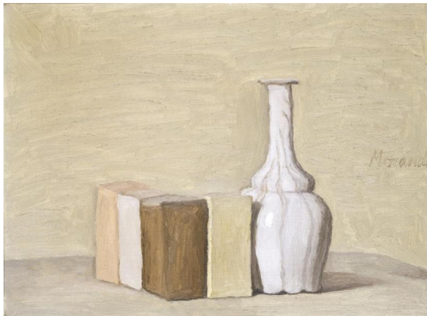
Giorgio Morandi Still Life oil on canvas, 12 x 16 in 1955 6

There is an impossibility to a still life. I assert that the still life doesn't exist. Objects hold within them accumulated experience, experience and meaning formed by human interaction. “Before beginning a new still life painting, Morandi would arrange the objects, many of which he had already transformed by covering them with paint.” 7 This inclination to alter objects is a familiar