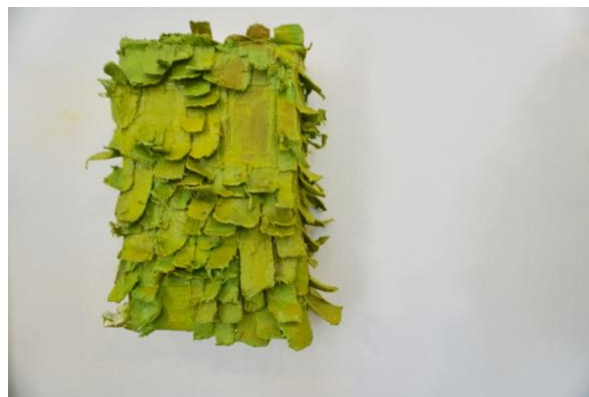
Sara Weininger, Green Bird Box House , oil on canvas on cardboard, 8 x 6 x 2in, 2018

The material that makes up the hat is often indistinguishable from the material that comes out of the lamp. The life of these objects is cyclical. Tiny marks make up the exterior of the hat and yet tiny marks come out, land on the floor and become the material of the floor, some time passes, and the empty coffee cup left on the side table begins to grow these marks too, so does the dresser drawer, marks crawl up the walls of room, down the hallway and blanket the whole house. Panning closer in on the material reveals marks resembling feathers, a few steps back again reveals a bird box house.