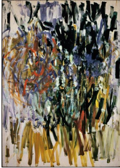
Joan Mitchell Straw 108 1/4 x 77 3/4 inches 33

To put it in terms of my work, Mitchell created the paint-bike, an approach to painting embodying the non-singularity of painting and riding a bike. To ride a bicycle without hands is objectively careless. This is true only if we consider the bike on singular terms. I am concerned with the paint bike, not a bike. The concept applied to the act of painting, that is, to paint and painting with no hands, requires that the artist handle the paint as if she is not consciously handling it at all. The poetry in the original statement comes when both bicycle riding and painting are held together at once.