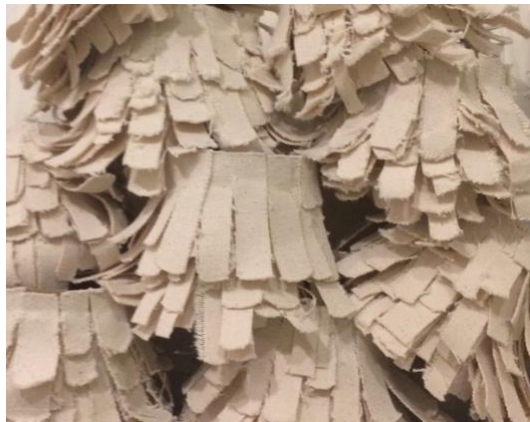
Sara Weininger, Pile of Bird Adjacent Creatures , canvas on coffee cup sleeve, various dimensions, 2018

subconsciously in my mind while trimming the canvas to become the feather, the right feather at the right stage in time. The truth is, not all feathers grow the same. Sometimes the ends are squared and sometimes they are rounded. Still, the decision to cut happens in the moment of making the thing.