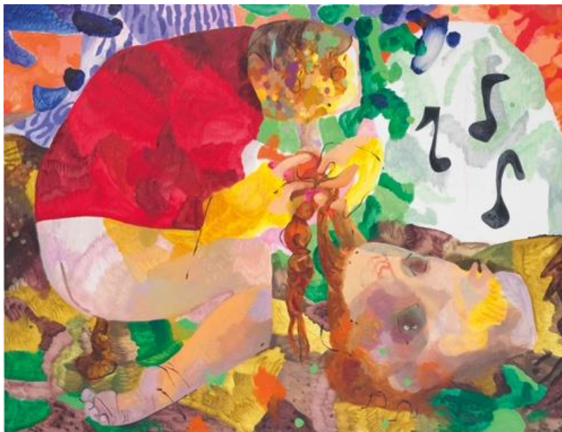
Dana Schutz (b. 1976) Crapping, Braiding and Whistling 2009 oil on canvas 58 x 76 in 2

in charcoal covered hand, I continued down the block. I quickly became aware of two figures walking a short distance behind me down the same block. I heard some words like “canvas” and “studio” and my ears perked up. Then I saw the curly hair and there was an oddly familiar voice that I recognized from the YouTube talk. I hurried not so casually to the end of the block and waited for them to catch up to me. When they finally did I spoke: “Hi, um, you're Dana Schutz, right?” (I had her exhibition catalogue from her solo show at The Rose Art Museum at Brandeis University in my canvas bag.) I told her how I was on my way back to my aunt’s house in the neighborhood, the reason I had charcoal all over my face and hands, that I was a rising senior at Brandeis majoring in studio art and that I was a painter. We talked briefly about how cool it was to have a museum right next to the art studios and to be able to walk over and look at her work steps away from a Phillip Guston and a Robert Rauschenberg. Eventually I stopped talking and I apologized for interrupting her. She smiled, laughed and was flattered that I recognized her. She offered me some words of encouragement about being an artist and we parted ways.