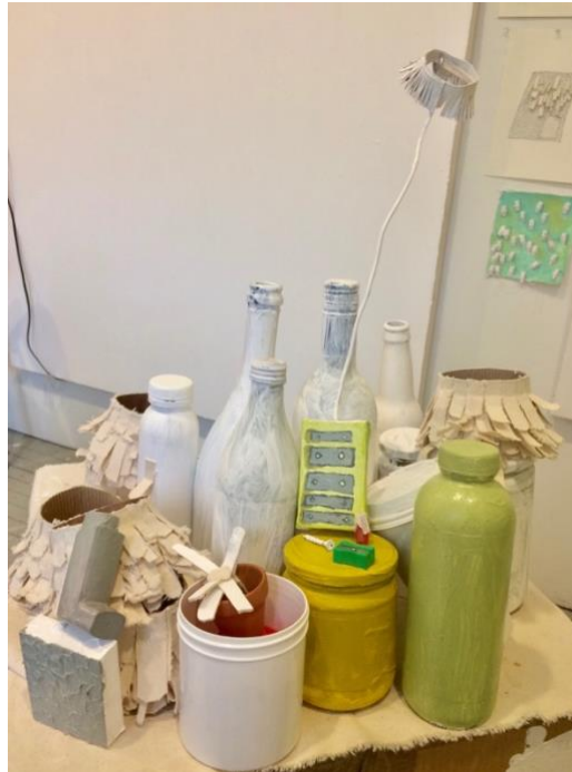
Sara Weininger (Early Version) Shared Shelf with Morandi , 40 x 18 x 18in 2018

through repetition and the specific use of paint as the conductor, that Morandi is able to create a language. This too, is how I create mine.