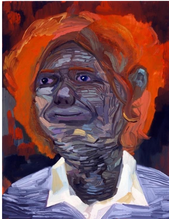
Dana Schutz Self Portrait as a Pachyderm 2005 oil on canvas 23 x 18 in 5

What draws me to Schutz's work is her recognition of the non-singularity of people, things and ideas. Schutz says about her paintings "I definitely like the fact that they could be at the beginning of something or at the end." 3 She points out two opposing ideas, "the beginning" and "the end," calling attention to the ability of a painting to depict each concept simultaneously. There is no beginning without an end and no end without a beginning. She holds two ideas close together that are in most senses seen to be at a great distance. Schutz's work also contends with the "slippage between something being very actual and imaginary." 4 She demonstrates in her work the potential of paint to hold conflicting disparate realities constant. Pushing further the idea that in a painting, things can be both up and down, dark and light. That individuals can be both human and pachyderm, and that we have the potential to crap, braid and whistle all at the same time.