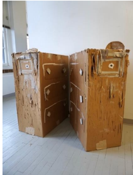
Sara Weinger Bearly , cardboard, acrylic, canvas (When Closed): 43.5 x 30 x 28in (When Open) : 43.5 x 15 x 56in