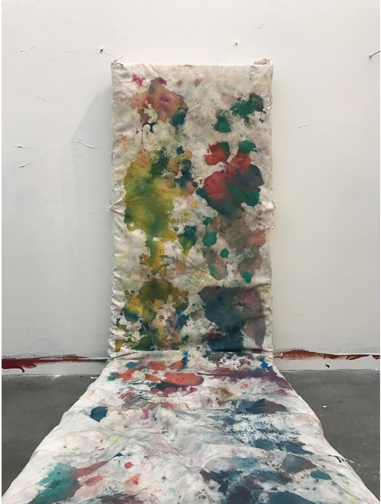
Fig 1. Jiyoung Megan Lee, The Presences at TIME in SPACE , 2016. (the aftermath of the interaction)