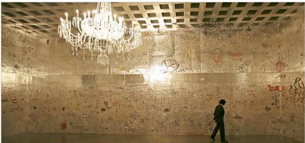
Fig 3. Rudolf Stingel, Untitled , 2007

Rudolf Stingel's application of interactivity as a source of image-making also allows "painting, but not by [his] assistants who carry out [his] concept but by a public that inscribes its own individual response in a material way into the work" (Tate, "Untitled, Rudolf Stingel, 1993."). Stingel's works emancipate the restricted distance in the relationship between the viewers and an art object. First presented at 2003 Venice Biennale, Stingel's Celotex insulation covered the entire walls of the exhibition space, and the viewers were invited to make marks, inscribe and even deface the surfaces of the Celotex (Robert 9). In his inquiry on by whom and how artwork is created, Stingel acts as a mediator who pairs a value into those marks generously made by the hands of the viewers (Robert 9). Although my practice and Stingel's Celotex insulation differ as I focus on the energy carried in the living body while he puts more emphasis on the natural reaction and interaction of the spectators, I resonated with his system of treating the marks of others also as indexical traces and eventually archiving them into a collective mass. The repurposed marks and traces dissolve into the singular authorship of the facilitator and so exist under the artist's own authorial gesture (Chrissie 23).