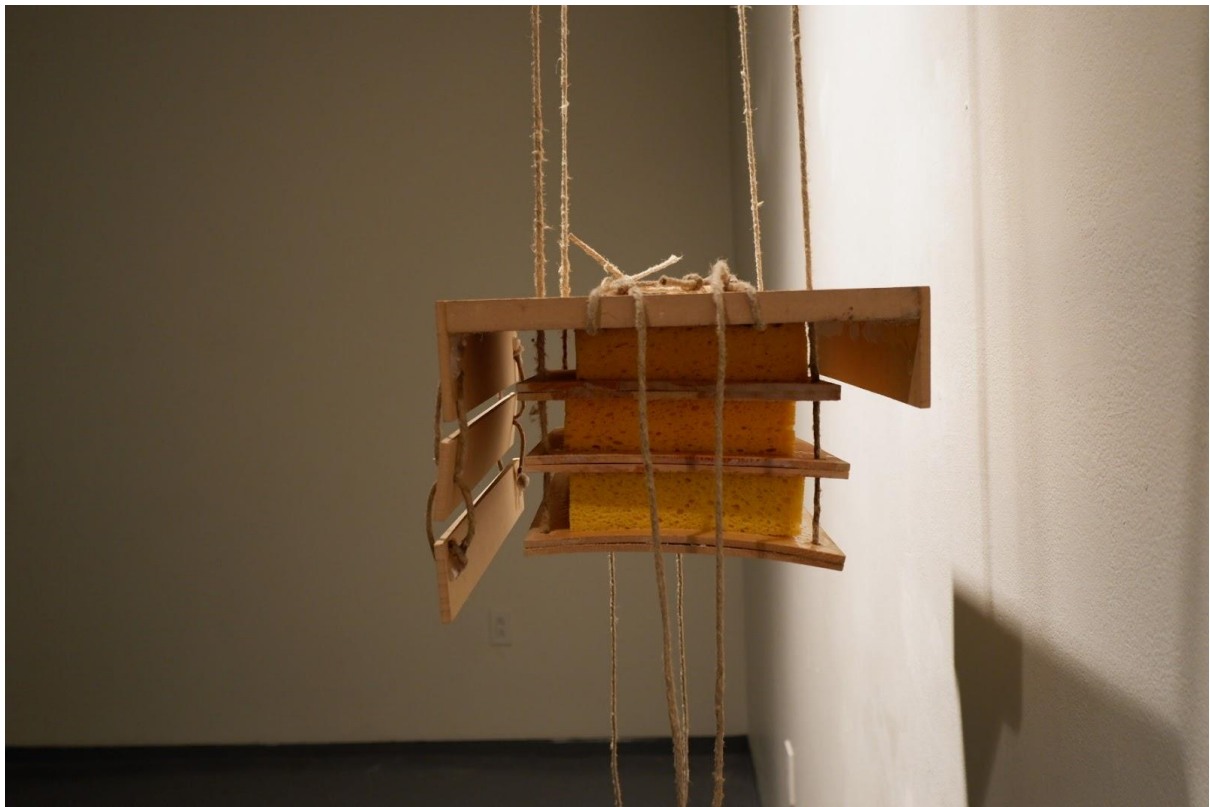
Fig 4. Jiyong Megan Lee, Untitled(2019) , 2019