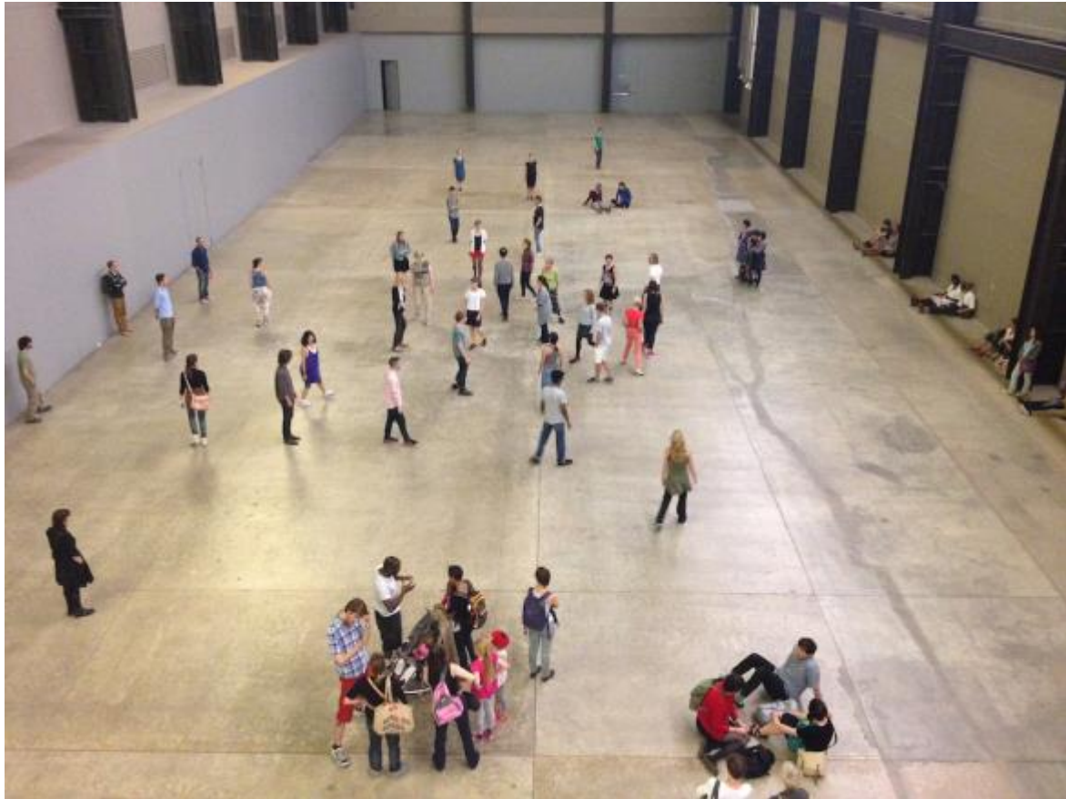
Fig 6. Tino Sehgal, These Associations , 2012

Sehgal, Tino. "These Associations." Image Object Text , imageobjecttext.files.wordpress.com/2012/08/sehgal-these-associations-2012-from-platform.jpg .