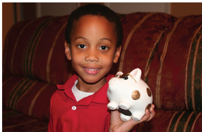
A student from Southern Good Faith Fund's SEED program proudly displays the bank where he keeps his allowance between trips to the credit union.

11. Savings plan structures, such as the federal Thrift Savings Plan or State College Savings (529) Plans, are potential platforms on which to build universal