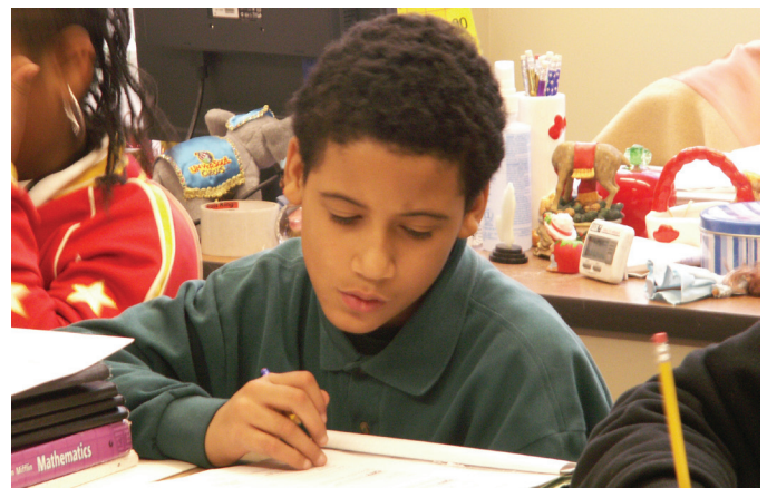
This student, along with others at People for People's SEED program, participated in entrepreneurship training and developed a business selling snacks to raise money for his SEED account.