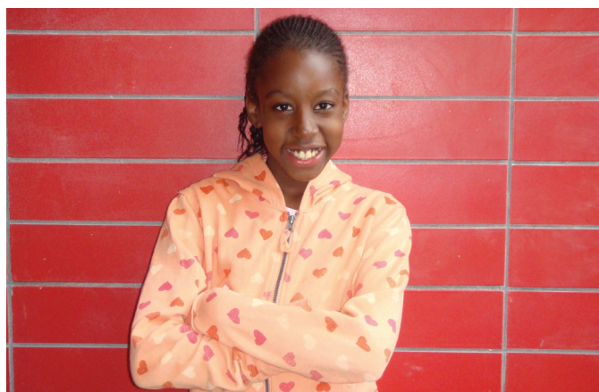
A participant in Harlem Children's Zone's SEED program smiles for the camera. This SEED program, like some others, provided financial education to parents as well as children.

In recent meetings with Obama administration officials to discuss greater inclusion in 529s, there has been considerable interest in not only the financial but also the psychological effects of saving for education. At the end of the day, saving