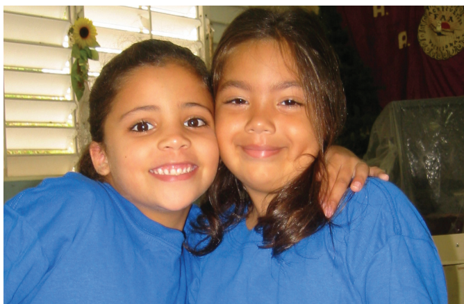
Students at Fundación Chana y Samuel Levis’ SEED program benefited from a Spanish-language financial education curriculum created by the agency.

Progressive. Progressive means lower-income populations