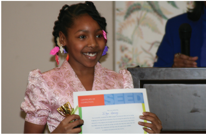
A student shows off a certificate she earned for her participation in the SEED program at Sargent Shriver National Center on Poverty Law.

exclusive policy that leaves low-income Americans behind.