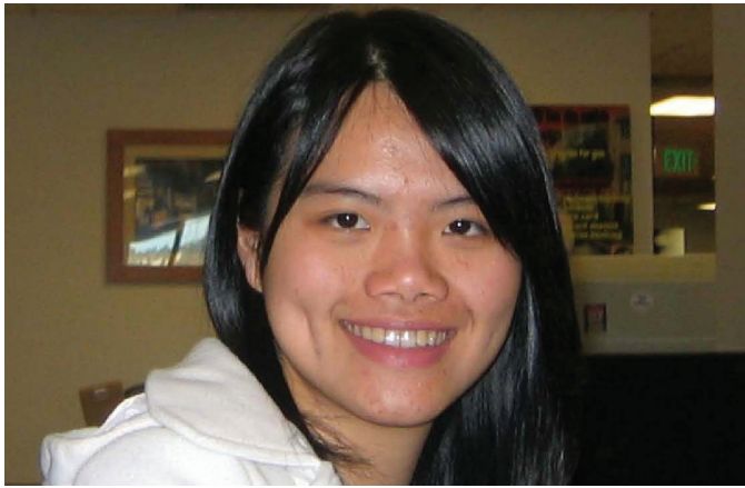
Participants in Juma Ventures' SEED program, like this student, held seasonal jobs and used their earnings as a source of deposits for their SEED accounts.

Perceptions about ability to afford college may also have impacted savings. Research found that SEED families lacked accurate knowledge of the cost of college. At baseline, for example, only 7% of parents at one program could roughly estimate the cost of annual tuition at the local community college (Marks, Rhodes, Townsend, & Olmsted, 2005). In addition, the vast majority of SEED parents overestimated the cost of tuition, usually by a large margin (Beverly, 2006). As a result of these mistaken perceptions of the cost of college, SEED families may have concluded that college was out of reach and, accordingly, saved less than they might have otherwise.