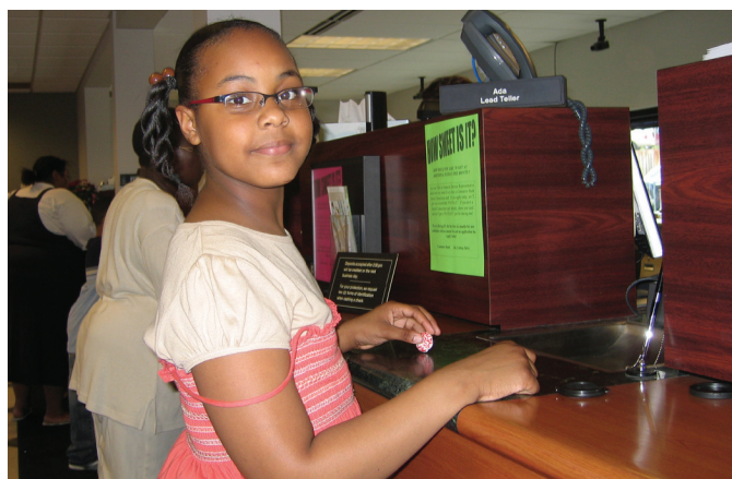
A student from Beyond Housing's SEED program makes a deposit into her SEED account. Students in SEED learned how to fill out deposit slips and read bank statements in financial education classes.

used for approved purposes. They also support accounts with an initial deposit made by the federal government that permits additional contributions and incentives for saving, and is allowed to grow tax-free. Close to seven out of every 10 respondents (69%)—and more than three-quarters of parents (78%)—articulate support for this idea (Peter D. Hart Research, 2007).