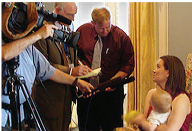
A SEED OK participant speaks to reporters about saving for her child’s college education.

A national system of CDAs is an opportunity to create an automatic investment structure that will mitigate financial service risk, and provide sound choices that can limit investment risk (e.g., the TSP and almost all state 529 plans offer a money market or guaranteed investment option, and we would assume that most financial providers in a market