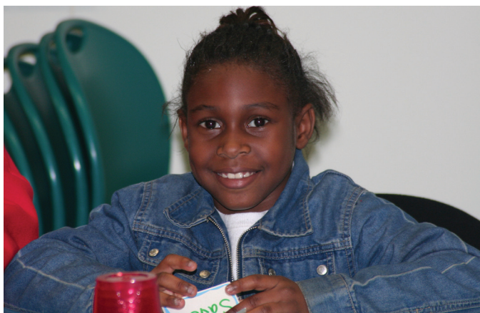
A student participates in a financial education activity, a key component of SEED programs.

The Saving for Education, Entrepreneurship and Downpayment (SEED) initiative was implemented in October 2003 after years of planning as a way to develop, test, document, and inform CDAs. Eleven community