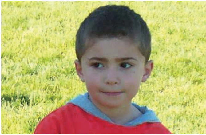
Students at Oakland Livingston Human Service Agency's SEED program were among the youngest participants in the initiative. In the SEED initiative overall, participant age ranged from 4 to 23.