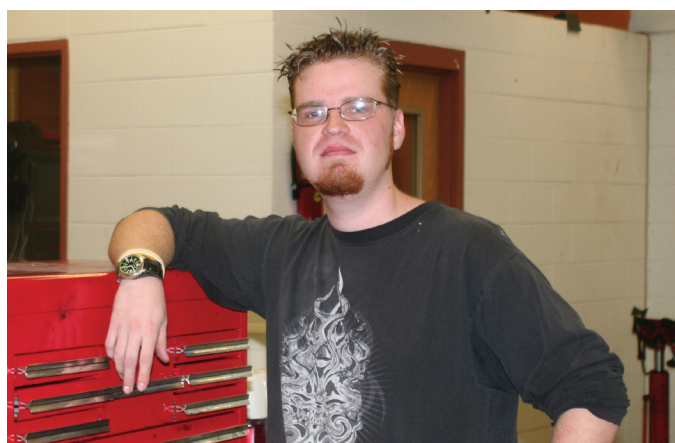
The Mile High United Way SEED program focused on high-school-aged youth transitioning out of the foster care system.

Inclusion in CDAs. As in all optional savings policies, optional enrollment in SEED is challenging. We would think that most families would be very enthusiastic about the financial incentives and savings for their children—and indeed many are—but a larger portion nonetheless sign up very slowly or