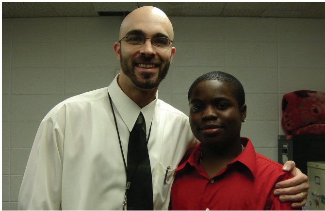
Staff at the SEED programs, like this staff member with Boys and Girls Club of Delaware, were critical to the success of the initiative.

choice approach would also offer a conservative option). At the same time, a universal CDA policy could deliver financial education on a large scale. This could occur through any of the major CDA policy options, but is most likely where public policy expresses itself via financial regulation and some form of inclusive savings plan.