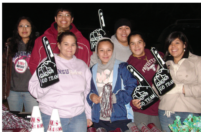
Students in Cherokee Nation's program show off the merchandise they sold at school events to raise money for their SEED accounts.

In-depth discussions with parents who had the opportunity to enroll their children in SEED but did not do so may be instructive. These parents remembered being offered SEED accounts, and understood basic details of the program. Their