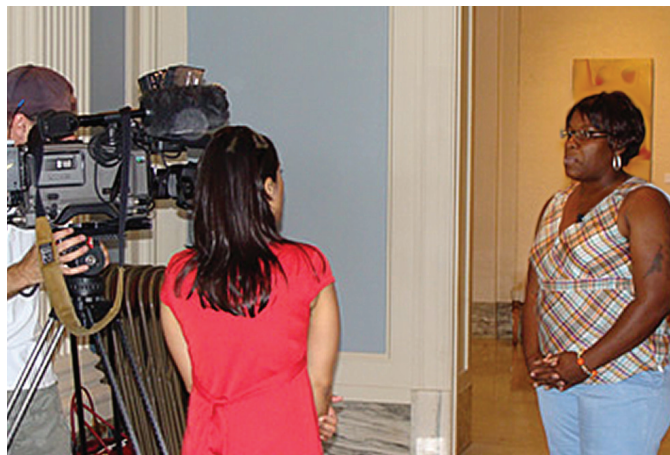
A SEED objective was to communicate CDAs to the media. Here, a participant speaks to reporters about SEED OK.