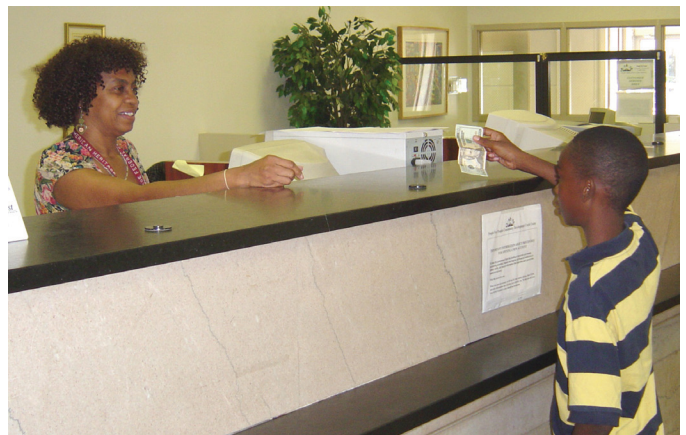
SEED participants made regular trips to the bank or credit union to make deposits in their SEED accounts.

Poverty and household well-being, particularly by race and