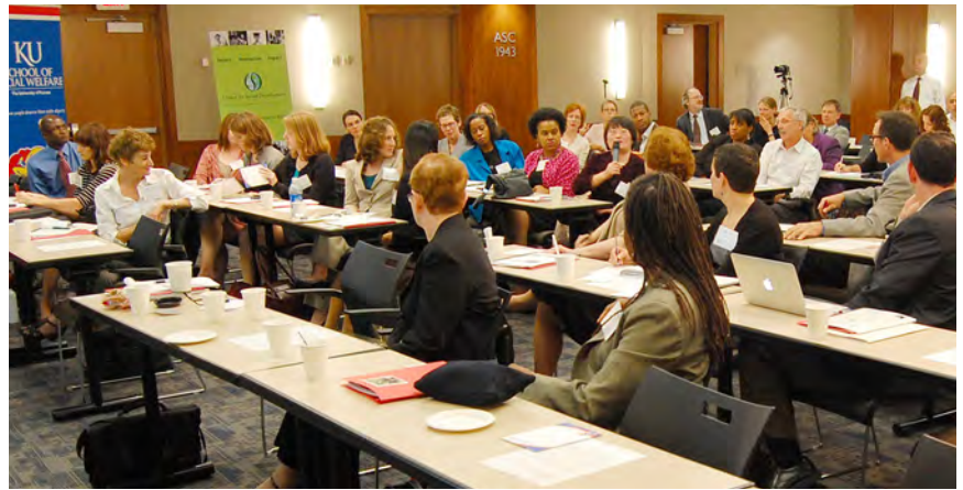
Symposium attendees participate in a Q&A session.