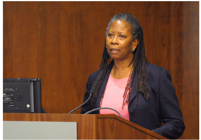
Kilolo Kijakazi of the Ford Foundation addresses Symposium attendees.

The second method for young people to obtain assets—saving for themselves—is constrained by young people having relatively little income. Also, saving is often difficult for young people because the desire to conform to peer group norms can create intense pressure to spend. Lastly, the attitudes, knowledge, skills, and behaviors that motivate young people to save and make saving possible are shaped to a large degree by parents (and other important adults). Many youth are at a disadvantage because they do not have adults who model and teach financial knowledge and skills.