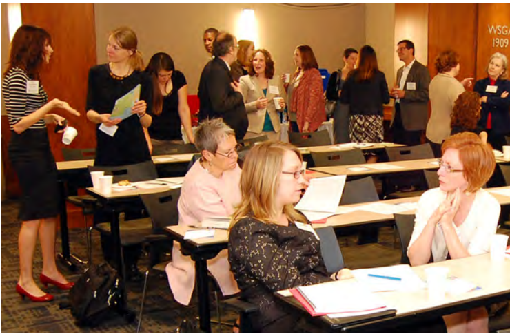
The Symposium offered time to network and discuss the issues at hand.