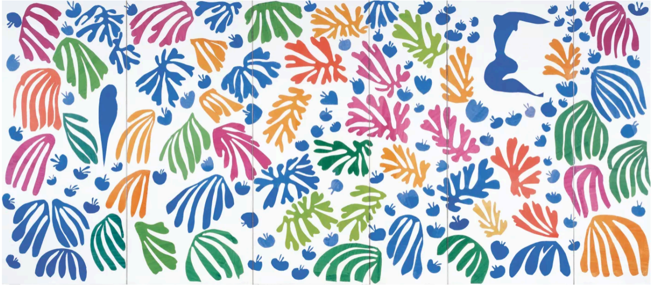
Fig. 11. The Parakeet and the Mermaid . 1952. Henri Matisse.