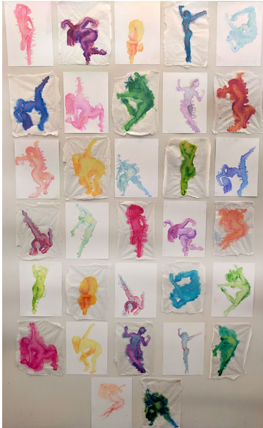
Fig. 17. Slow Me Down . 2018. Ryan Brandt

how a singular event can still be made up of different emotions, and how the passage of time is made up of singular, individual moments.