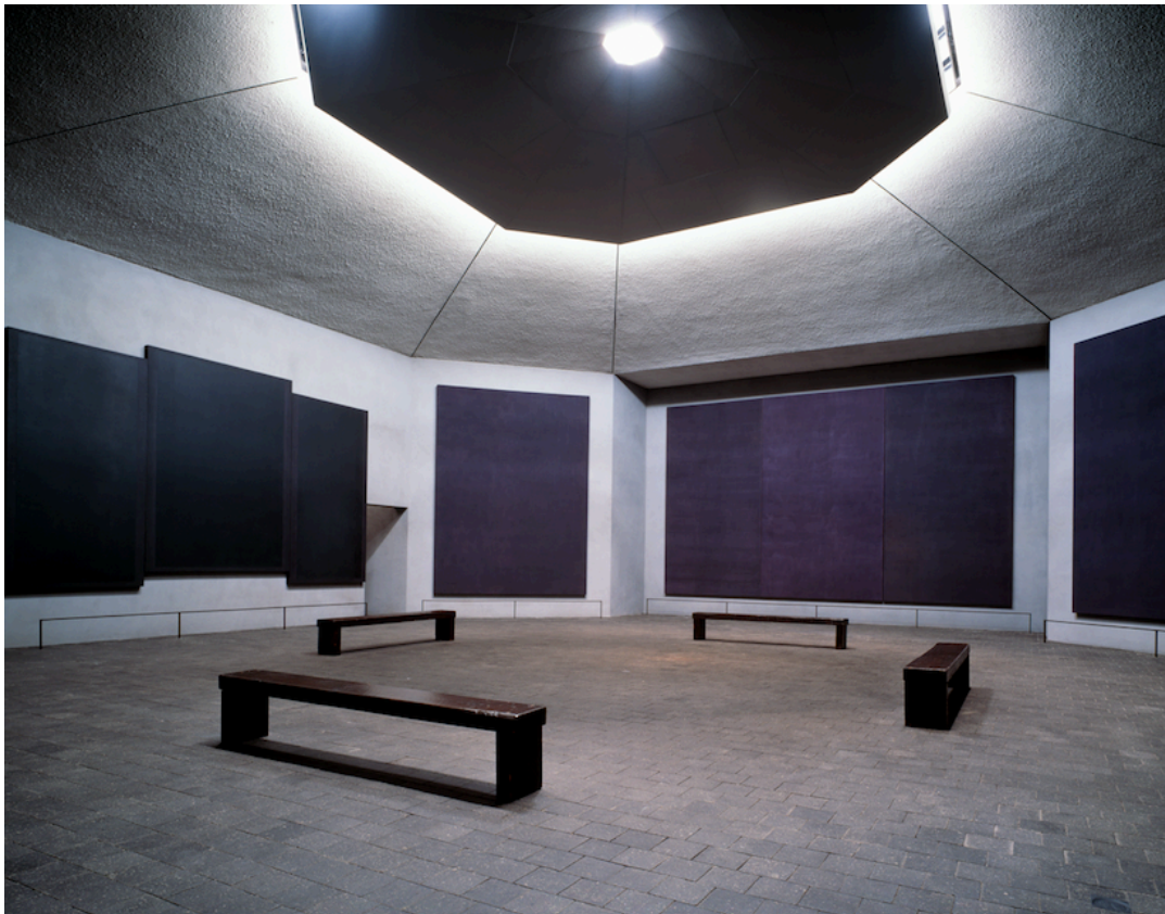
Fig. 8. Rothko Chapel . 1971. Mark Rothko.

sublime on the viewer, that there is something greater than themselves in the universe. This is an aspect of Rothko's chapel that I have continued to explore. Much like within meditation, experiencing this space involved the use of one's entire body. When trying to view the piece, the viewer will find themselves engulfed by canvas instead of walls, transported to a different world.