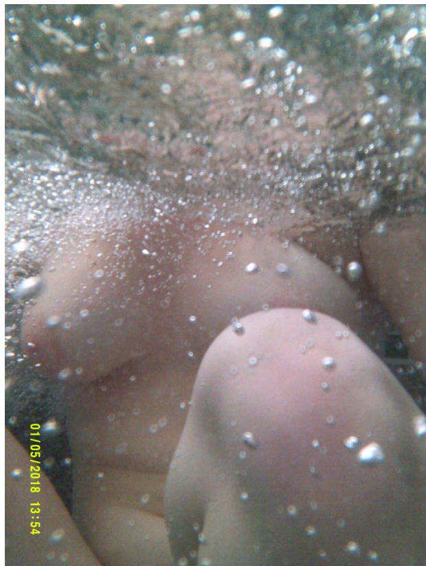
Fig. 3. (Right)