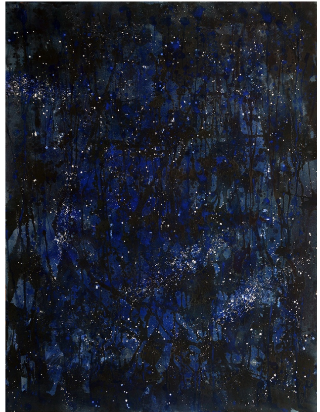
Fig. 16. (Right). Sky's Darkest Spot II . Ekaterina Smirnova.