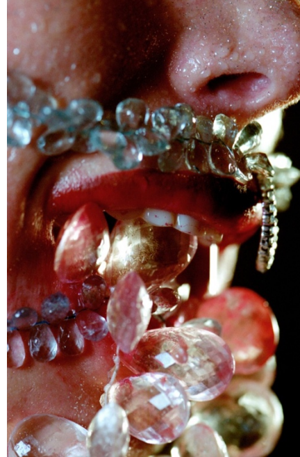
Fig. 5. (Left) Blade Runner . 2010. Marilyn Minter.