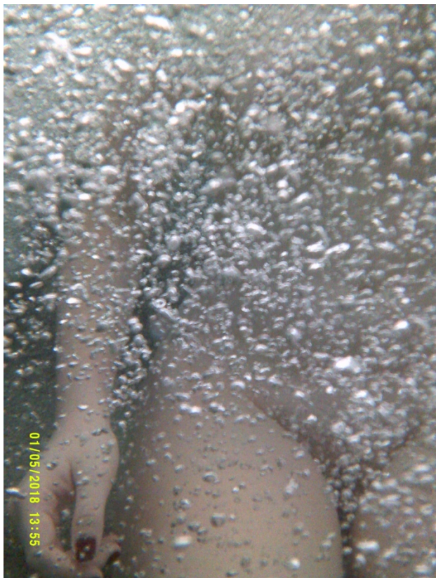
Fig. 2. (Left)