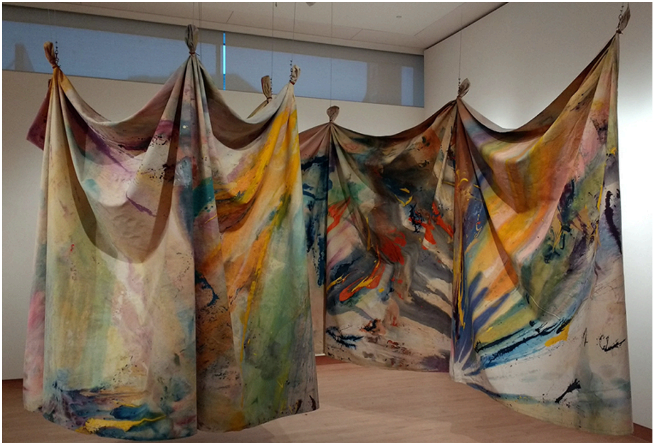
Fig. 14. Carousel . 1970. Sam Gilliam

Sam Gilliam also explores this notion of evolving work, as he says “Each time my work is installed, the composition changes.” (Gilliam et al.). This compilation of silhouetted bodies has no set composition in my mind. It can be constantly changing, in the same way that the world is constantly changing as we continue to explore. This constant evolution reinforces the idea that the present is fleeting, and though we make think what is current is the most important, in fact the present will soon become the past, and many of the things we think are so important will become irrelevant. I used water based media to depict these figures, and to represent the way that water and this installation are constantly changing and flowing.