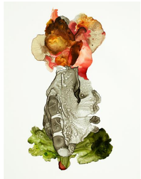
Fig. 9. (Left). Creeper (Wall installation at Storefront Ten Eyck). 2014. cut, assembled pieces of painted mylar, ink, tape, mounted on wall. Julie Evans