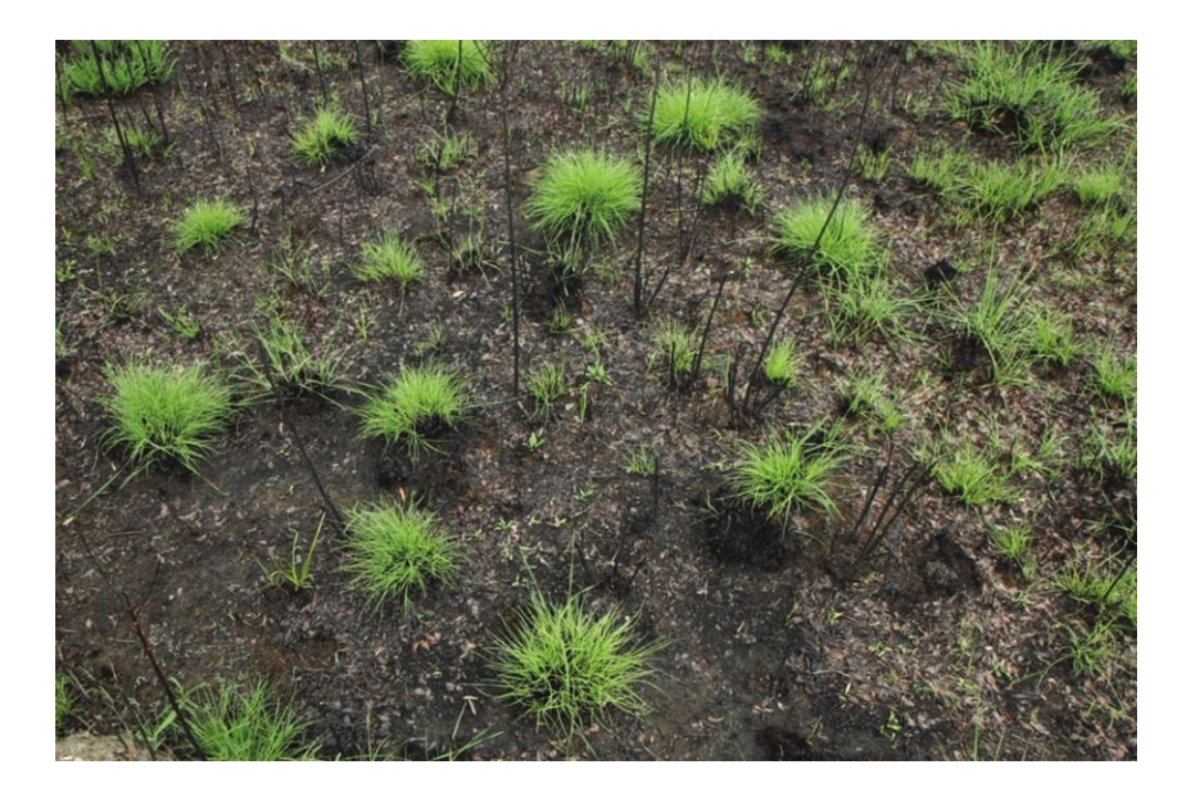
Figure 1: Muhlenbergia expansa bunchgrass tussocks 1 month postburn, June 2009, Lake Ramsay Preserve, LA. (Charred black stems are Ilex glabra .)

2009). In sessile communities, where individuals are subject to the conditions of their immediate surroundings, the meanfield assumption is especially likely to be violated (Tilman 1994; Barot et al. 1999). If individuals are aggregated by species, they will encounter heterospecifics in lower proportion than predicted by the mean-field assumption, reducing interspecific competition in the community (Stoll and Prati 2001; Hart and Marshall 2009; Raventós et al. 2010). If individuals within a species are overdispersed, they will encounter heterospecifics in higher proportion than predicted by the mean-field assumption, increasing interspecific competition in the community (Hart and Marshall 2009). Furthermore, if individuals within a physically and competitively dominant species are overdispersed, the resulting increase in heterospecific encounters and interspecific competition between dominant and subordinate species may increase the effect of dominant species on community dynamics relative to their abundance.