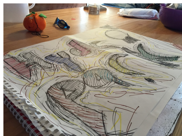
Figure 11 Hyde Park event 2014, photo by Dre Steele