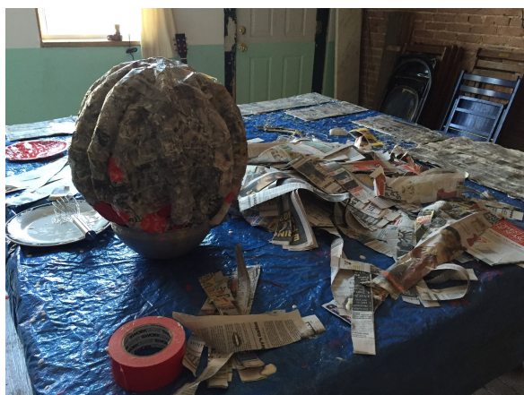
Figure 10 Hyde Park event 2014, photo by Erica Garland