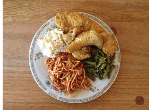
Figure 7 Hyde Park event 2014, image by Eileen Cheong