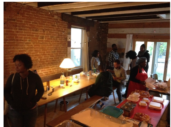
Figure 9 Hyde Park event 2014, photo by Dayna Kriz