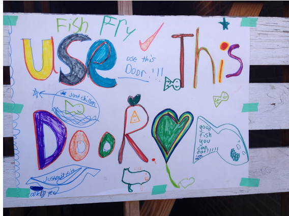
Figure 6 Hyde Park event 2014