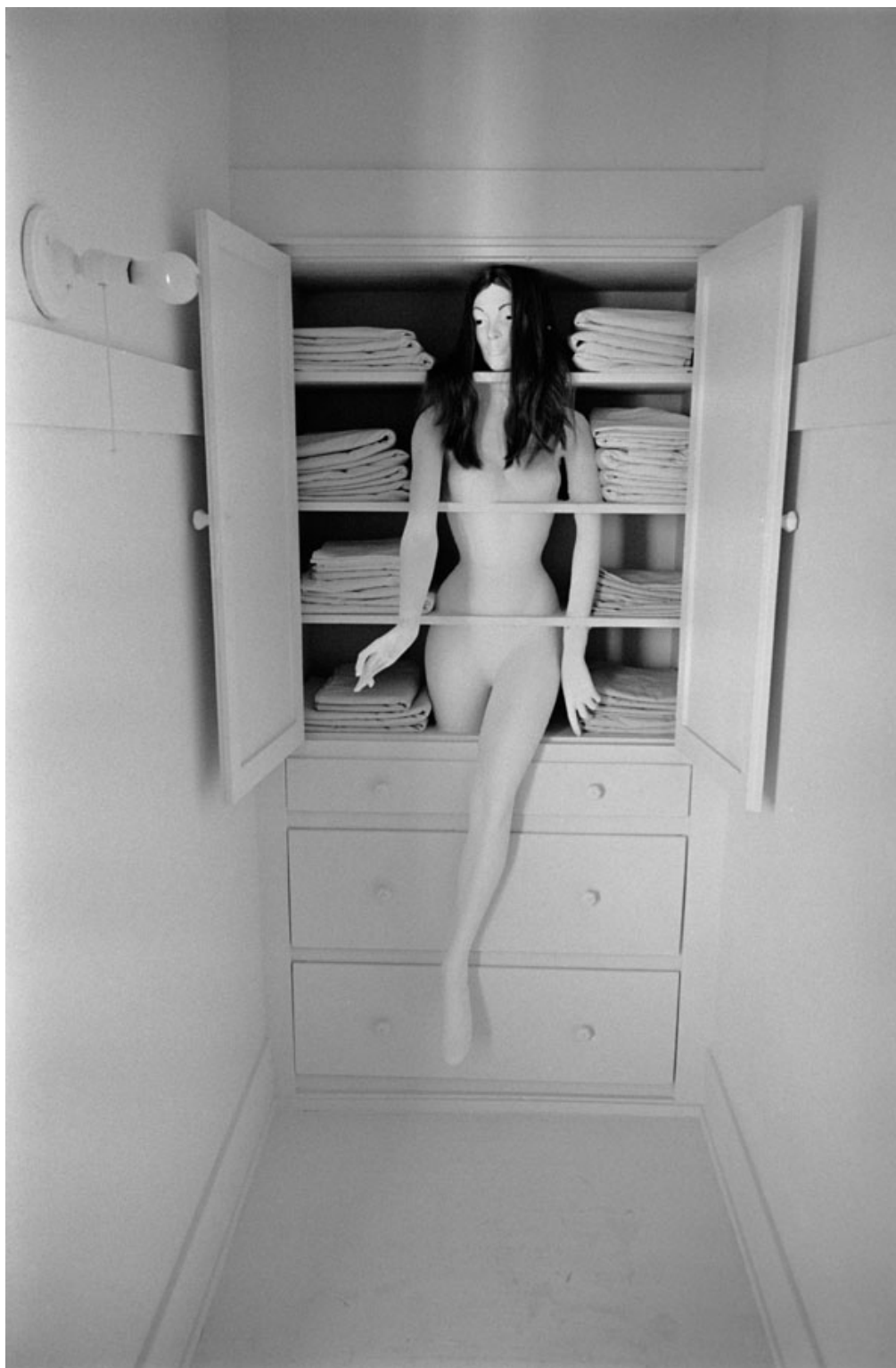
Figure 5 Sandy Orgel, Linen Closet , 1972, Womanhouse