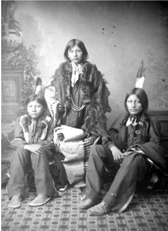
Figure 2 Three Lakota boys on their arrival at the Carlisle Indian School.