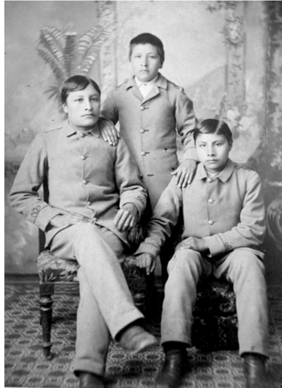
Figure 3 The same three Lakota boys begin the process of deculturation at the Carlisle Indian School. Source: Smithsonian Institution, National Anthropological Archives [#57,490].