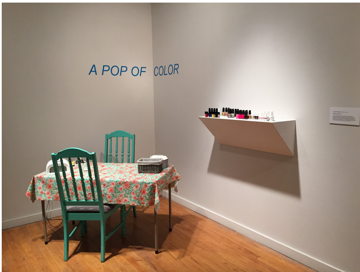
Figure 14 Shaniqua Washington, Pop of Color , pop up nail salon Parabola:Collabora