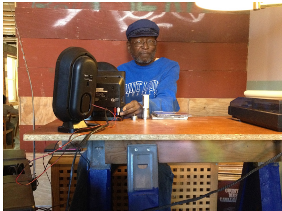
Figure 8 Hyde Park event 2014