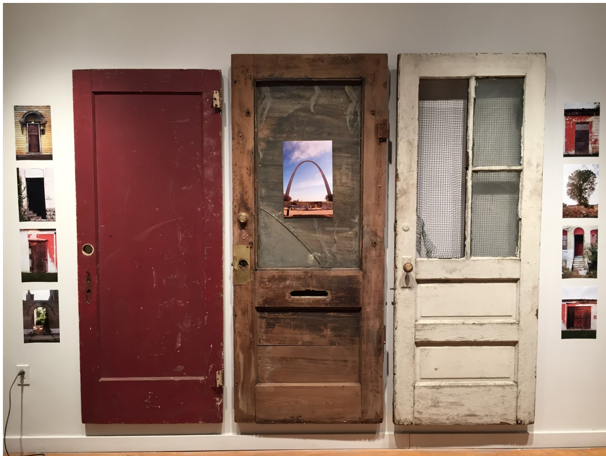
Figure 13 Andrew Johnson, Doorways Series , 2014, doors, photos Parabola:Collabora, photographic installation