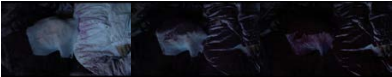
Retrospect in Black , 2016, Film stills Two-channel video, 37' 21"

In the works, Meditation in Black and Retrospect in Black , I visualize traumatic memories on the outer skin of the body. Rose, that was once a flourishing life, is used as a metaphor for pain, violence and destruction, as its dried and ground up powder is rubbed on to the skin. Rose is also representative of the emotion that fades eventually through time. In this case, powder of rose is violently erasing or burying the figure— representing destruction. The murmuring sound is another alteration of the original sound file I had from 2015. By layering multiple audio files on top of each other, it distorts and loses its agency to the original context.