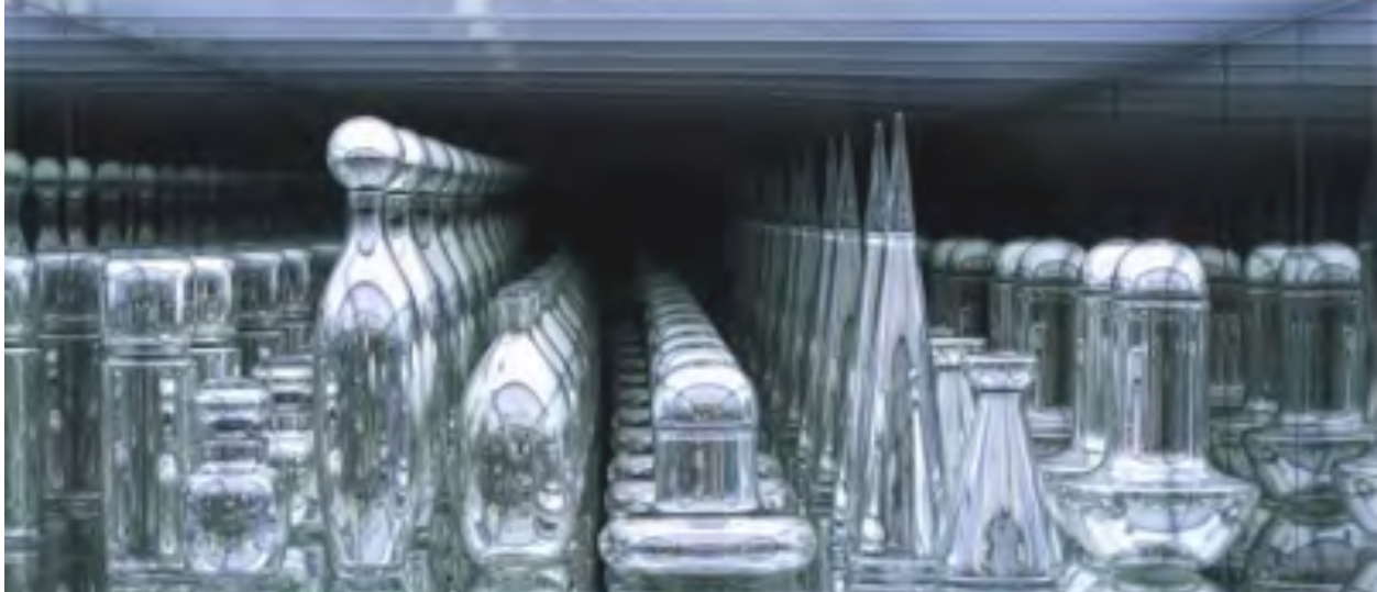
Endlessly Repeating Twentieth Century Modernism , 2005 Josiah McElheny blown glass, mirror in installation

Josiah McElheny creates finely crafted, handmade glass objects that he combines with photographs, text, and museological displays to evoke notions of meaning and memory. Whether recreating miraculous glass objects pictured in Renaissance paintings or modernized versions of non-extant glassware from documentary photographs, McElheny's work takes as its subject the object, idea, and social nexus of glass: