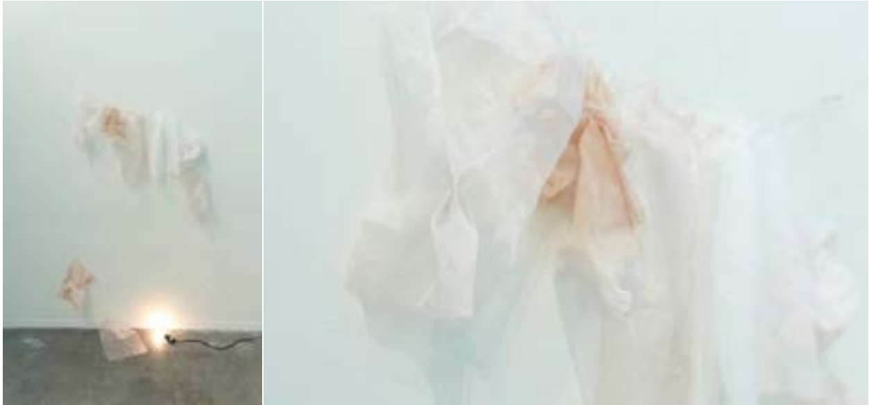
September or Rose, 2017 rose powder, chiffon, wire and light bulb

again in the present. A reality she describes as resounding within the silence of each individual who gazes upon it.