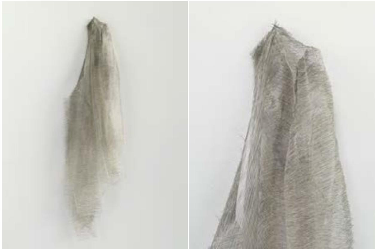
Disremembered IV, 2015 Doris Salcedo Silk thread and nickel plated steel 35 1/16 x 21 5/8 x 6 5/16 in.

motion, change, and transformation. In the infinite void of darkness, memories are like free flowing fluid or a projection of the past in a fog like display. It has life of its own, that transcends the individual's control. June 27, 2015 is singularly experienced in an empty room where the painting hangs and the sound plays in the background. Sound carry the viewer forward in time but also its ambient sound helps the mind to engage with the painting as the reflected light shifts, changes and transforms. Salt is used as a metaphor for ephemerality of memory. It is an agent that preserves but also decays. Salt is responsive to the humidity in the air or the conditions of the environment which it is situated in. Thus it will alter and transform, and decay as time passes.