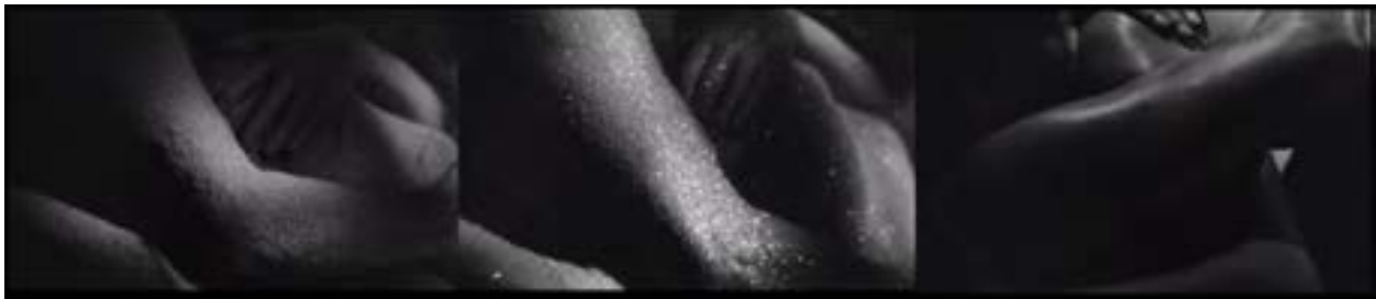
Hiroshima mon amour, 1959, film stills

Implicit memory [is] the unconscious influence of past experience when the past, so to speak, leaks into, or contaminates, behavior and ongoing cognition (Schacter 1995: 19). 4