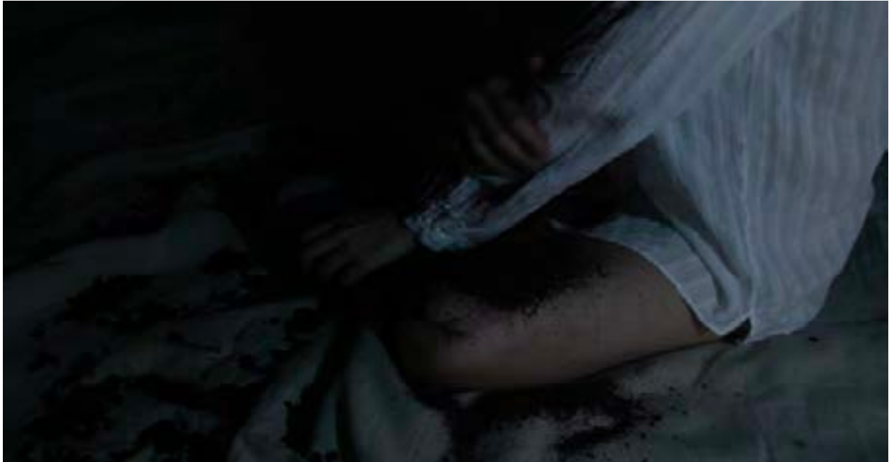
Meditation in Black , 2016, film still Two-channel video, 23' 40"