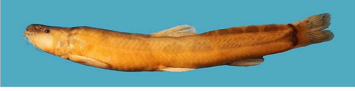
Figure 2. Paracobitis vignai, about 25 cm in TL, Sistan basin, Iran.

complete, reaching to base of caudal-fin, with 118-121 pores. Cephalic lateral line system bears 9 supraorbital, 4+15 infraorbital, 13 preoperculomandibular and 3 supratemporal pores. Nostril is slit-shape and flap does not covers the nostril.