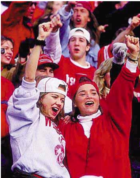
Original photo from University of Wisconsin-Madison football game