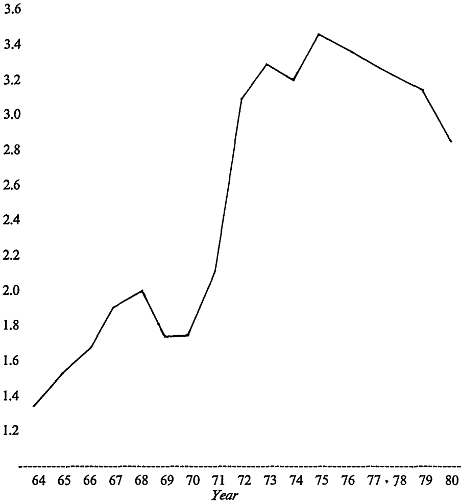
Ratios of Previous Year LSAT Administrations to Fall First Year Admissions