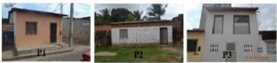
Figure 2. Construction patterns of brick houses P1, P2 and P3 in the Vila Cruzado neighborhood.

Understanding the vulnerability as a process that involves several social and environmental conditions, we see that different social groups are subject to a higher or smaller degree of problems affecting their routines. However, the city's inordinate growth causes the low income portion of the population to occupy risk areas. The socio-spatial segregation not only increases the risk of diseases, deaths, and economic losses, but also environmental problems.