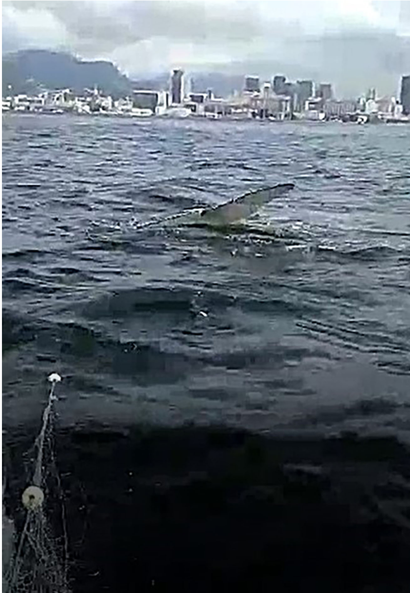
Figure 3. Yearling humpback whale ( Megaptera novaeangliae) entangled in a gillnet set off Icaraí, Niterói, mouth of Guanabara bay, Rio de Janeiro on July 6th, 2018.