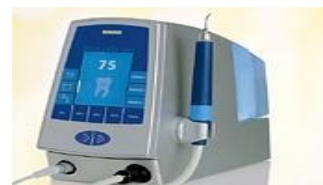
Fig. 3: PerioScan with Electronic Probe