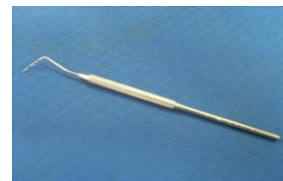
Fig. 1: WHO Probe

(ii) Electronic probe from SiRona dental system Perioscan using sound and light signal (Figure 2 and 3) detected calculus in subgingival areas. A blue light indicated presence of calculus and green light indicated no calculus.