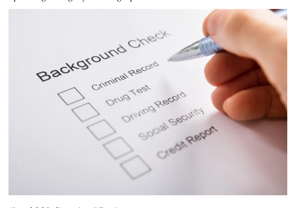
"Youthful Indiscretions" Forgiven

These examples suggest that candor is absolutely essential at all stages of the process. Continued dishonest or unethical behavior will not convince the Committee that an applicant is capable of upholding the dignity of the legal profession.