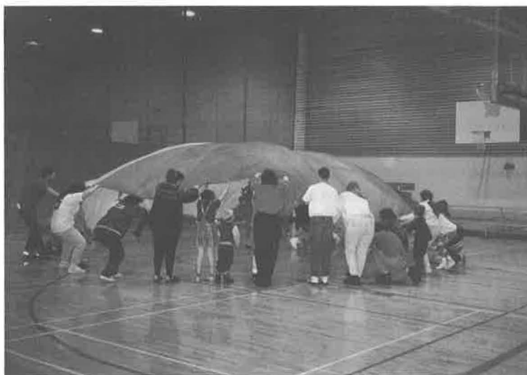
Family Focus Coalition and WSU/Spokane County Cooperative Extension

In response to this lack, the Girl Scout Council adopted innovative procedures to meet the needs of girls and to introduce neighborhood families to the benefits of Girl Scouting. A professional staff member is organizing and leading troop