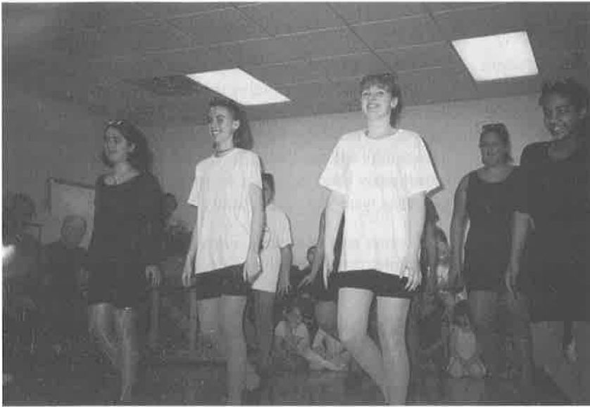
Family Center girls put on a show for seniors.

The primary means of implementing these approaches was through: