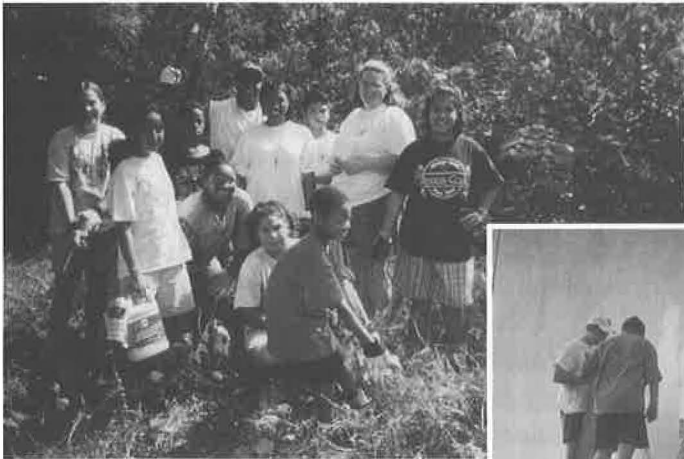
Arlington Teen Center kids do yard work for older residents.

out” is used to discipline a child whose behavior is disruptive. Staff are unambiguously instructed to locate a time out close to the activity in which the infraction occurred. During the time out, the disciplined children are required to sit quietly with their legs crossed and their hands folded in their laps until they are calm enough to rejoin the activity.