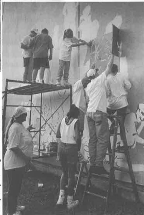
Youth pitch in to brighten up outside of Arlington’s Teen Center.

They have recommended that all adolescents participate in the program, which they are quite sure helps “the younger kids” be safer in the nonschool hours.