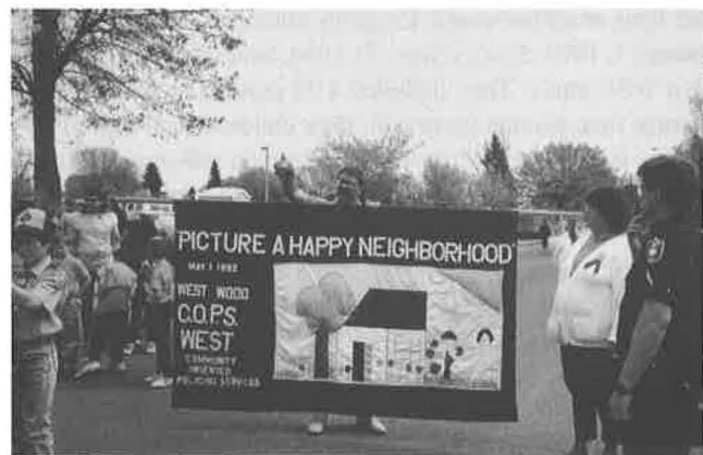
“COPS West Neighbor Days” parade features quilt made by COPS West volunteers from an elementary school student's design.

Key to Spokane's community policing approach is the chief's strong encouragement of actions by officers that go well beyond traditional law enforcement and crime prevention approaches, particular those addressing problems involving Spokane's children and teens. As a result of the motivation