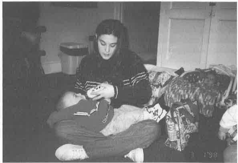
Family Center in Bristol, Connecticut

Frequently, typical adolescent stresses come to the fore—emotional stresses such as the need to establish an independent identity leading to conflicts with their own mothers and fathers; social affairs involving boy friends, best friends, and dating; and academic subjects involving future career choices. To address these concerns, trained Family Center staff provide case management and individual counseling. Close and