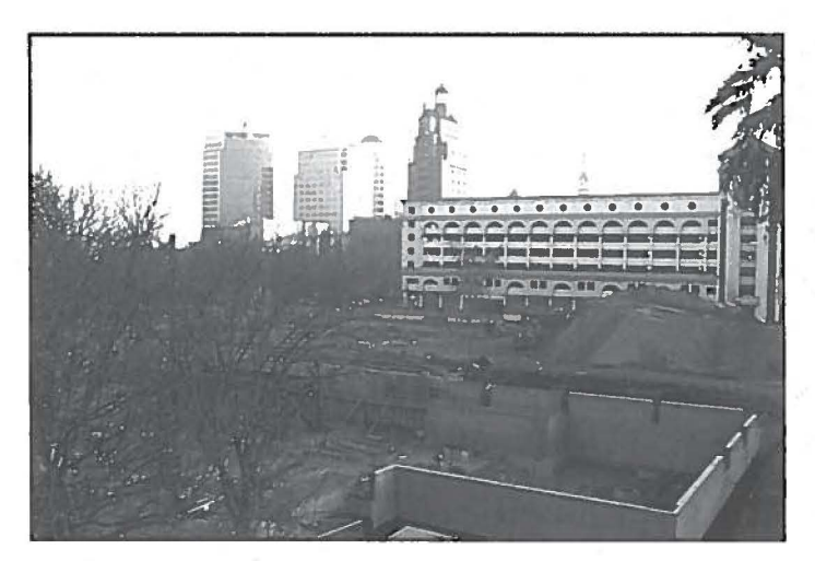
At the downtown Sacramento site of the future CallEPA headquarters, the foundation and basement walls are starting to outline the footprint of the 950,000 square foot structure.

Finally, I also want to extend my most sincere holiday wishes for good health and fortune to each of you and your families. Remember the spirit of the season, take care of yourself and others, and, again, thank you.