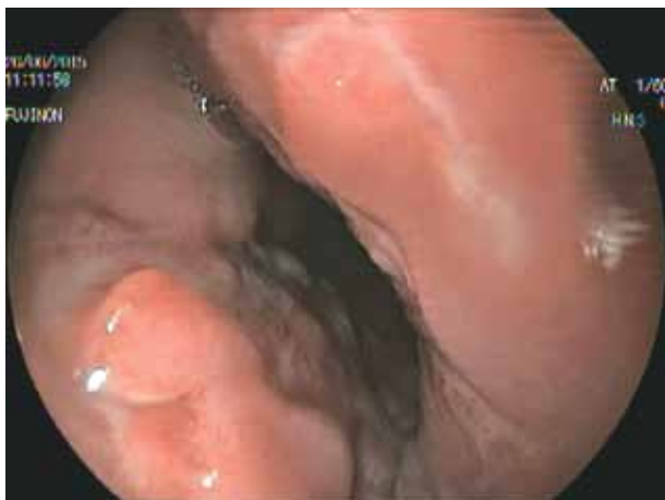
Figure 1 Endoscopic finding demonstrated a large esophageal ulcer

A 28-year-old female internist was evaluated due to insidious onset of chest discomfort and odynophagia for 1 week. The pain was radiated to the back. She also had dyspepsia for 1 month and 2-kg weight loss. She denied history of esophageal motility disease. Two weeks before her symptoms had occurred, she had taken a 5-day course of doxycycline ingestion to treat acne vulgaris. She took the pills with less than 100 cc water. Physical examination was unremarkable. Complete blood count, liver function test, and radiology of chest were normal. Endoscopy revealed a large ulcer at the lower esophagus. It involved about 80% of circumferential area (Figure 1).