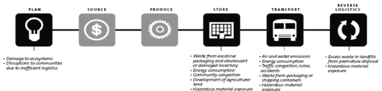
Fig. 1. Environmental and Social Impacts of Sustainable Supply Chain Activities

The negative effects of supply chain activities are shown in Figure 1. “The answer to reducing these impacts is not to constrain supply chain activities, but to manage them proactively through sustainable supply chain practices” (Sustainable Supply Chain Logistics Guide, 2011,p. 5). It should lead to the formation benefits in financial (economic), environmental and the societal dimension (cf. fig. 2).