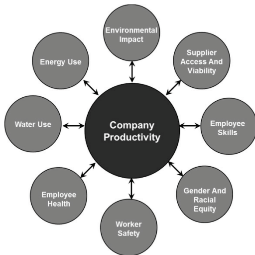
Fig. 3 Societal Needs and Economic Value Creation Source: Porter, Michael E., and Mark R. Kramer. "Creating Shared Value." Harvard Business Review Jan., 2011