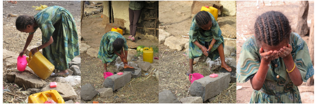
Fig 2. Girl washes with soap before school during a typical morning washing routine involving the feet, legs, hands, arms and face.

https://doi.org/10.1371/journal.pntd.0007784.g002