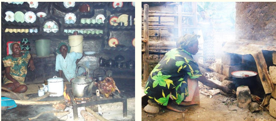
Figure 3: Left: A model CHC kitchen hut in Zimbabwe showing shelving made of clay, individual family utensils and covered drinking water with ladle. Right: In Rwanda, a traditional cooking shelter outside, with no CHC improvements.

Zimbabwean households usually have a dedicated kitchen with an open fireplace in the centre of the round thatched cooking hut. Seating for men is a moulded bench around the walls, whilst women and children sit on the ground by the fire, and chickens enter freely. The hut is usually very smoky causing a high rate of acute respiratory infections ( See Figure 2. ). Traditionally, cooking huts were highly decorated with built-in clay shelving in the walls and this practice has been reinvented by the CHCs with all members upgrading their kitchens in ever increasing levels of excellence.