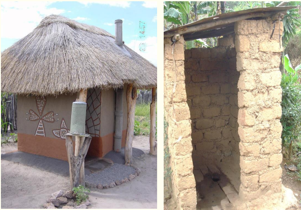
Figure.2. Left: Subsidized Ventilated Improved Pit latrine (VIP) in a CHC home in Zimbabwe with lined pit, concrete slab and vent pipe - a fly trap which eliminates smell and a hand washing facility. Right: An unsubsidized traditional pit latrine in Rwanda, unlined and open pit, log floor giving open access for flies.

Hygiene and sanitation standards between the two countries vary considerably. In Zimbabwe the Government recommended standard for sanitation is a Blair Ventilated Improved Pit (BVIP) latrine which usually has brick lined pit with cement slab, whilst the superstructure is likely to be permanent constructed in bricks, often plastered with cement with a tin roof and vent pipe primarily used as to draw a fly trap so reducing fly breeding but also draws off the smell.