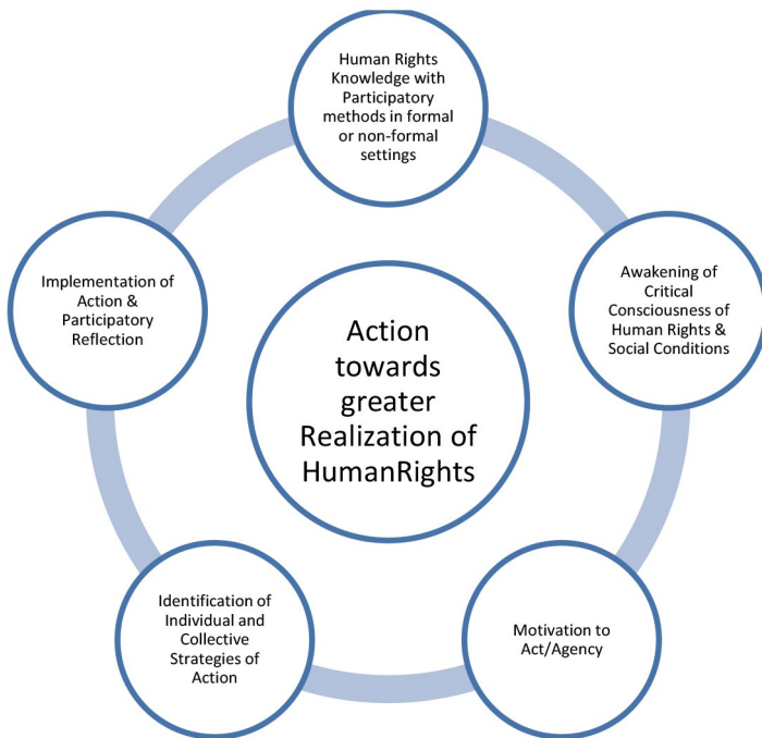
Figure 1: Participatory Dimensions of Transformative Human Rights Education

THRED can happen in formal, non-formal and informal settings. Many HRE scholars and practitioners have been inspired by the participatory educational model in their work (see, for instance, the work by Marks 1983, Meintjes 1997; Claude 1999, 2000; Koenig 2001; Lohrenscheit 2002; Tibbits 2002; Suárez 2007; Print et al. 2008; Bajaj 2011). Some have been successful, within their contexts, in bringing the THRED approach to the school context (see the India case that follows in this Appendix, Bajaj 2012), demonstrating how this can bear positive results. While the existing literature mostly focuses on the formal settings, there is still much to learn about the potential of THRED in non-formal settings. Initial research suggests that in non-formal settings THRED has the potential to reach sectors of the population that do not have access to formal education; research also shows that their participation can be highly beneficial both to them and to others in their setting (see the case of Tostan in this Appendix).