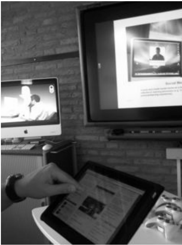
Figure 1: Multi-interface environment with personal (front) and social interfaces (back).