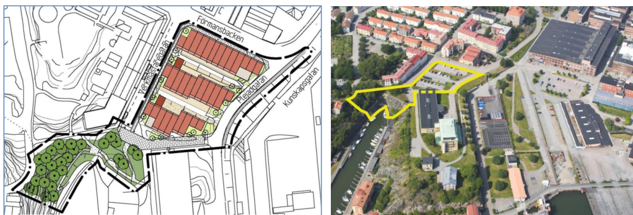
Figure 9 and 10. The illustration and photo show how the area for the detailed developer plan has moved toward the dry-dock, which is included in the national interest for cultural environment at Lindholmen.

In the detailed development plan, compensation measures are included as its own rubric. According to TPO, no compensation is needed, as the exploitation does not take up any nature or recreation spaces. It is a view of compensation that is to be found in the policy of 2018. The design demands in the detailed development plan are not viewed as expressions of compensation measures and functions with the support of the general plan. The governance of architecture of the dwellings in the plan regulations is treated as a way to adapt the planned built environment to the area of national heritage interest. The restoration of the stairway to the dry dock is not viewed as a compensation measure either. The underlying aim with design demands and design regulations is to remove objections to the planned exploitation in the national interest. Compensatory measures and functions are hidden in the planning process as changes to the plan proposals that facilitate the building of dwellings in the area.