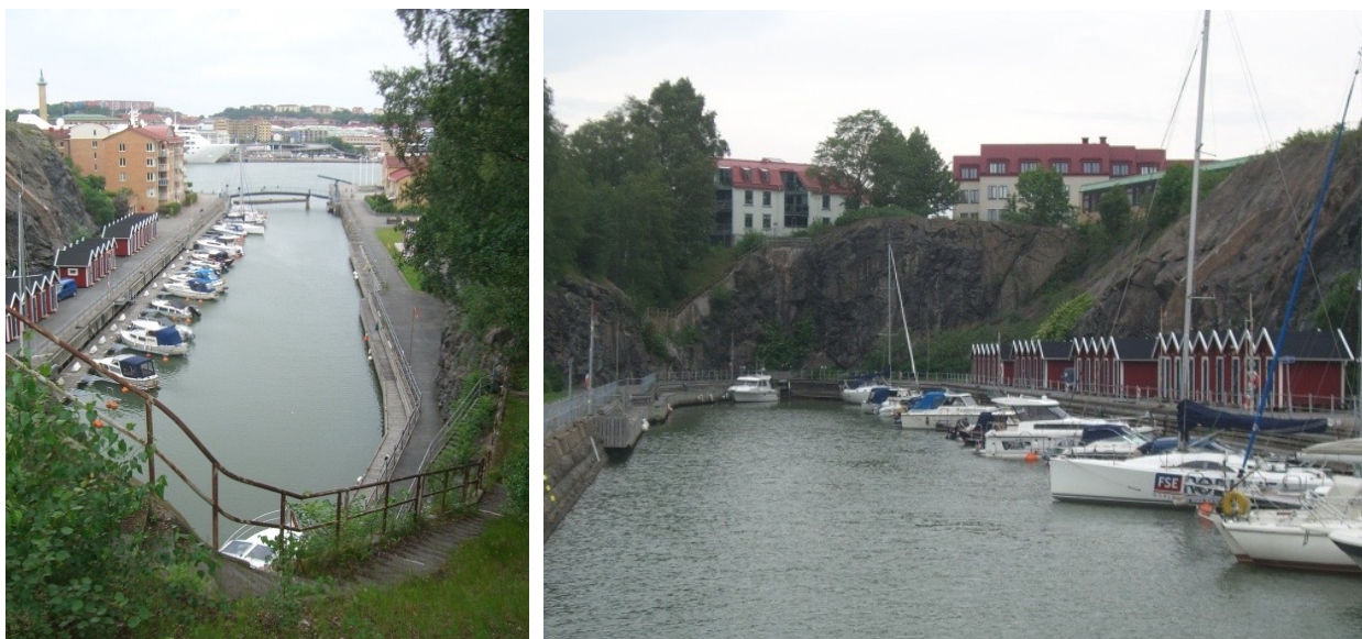
Figure 11 and 12. The photos show the dry-dock turned into a harbour for small boats seen from the top and from the river. The new buildings can be seen at a distance of the wright.

accept the detailed development plan. Accordingly, there is no chance of success with the complaints from the side of the citizens through alleging damage to the national interest.