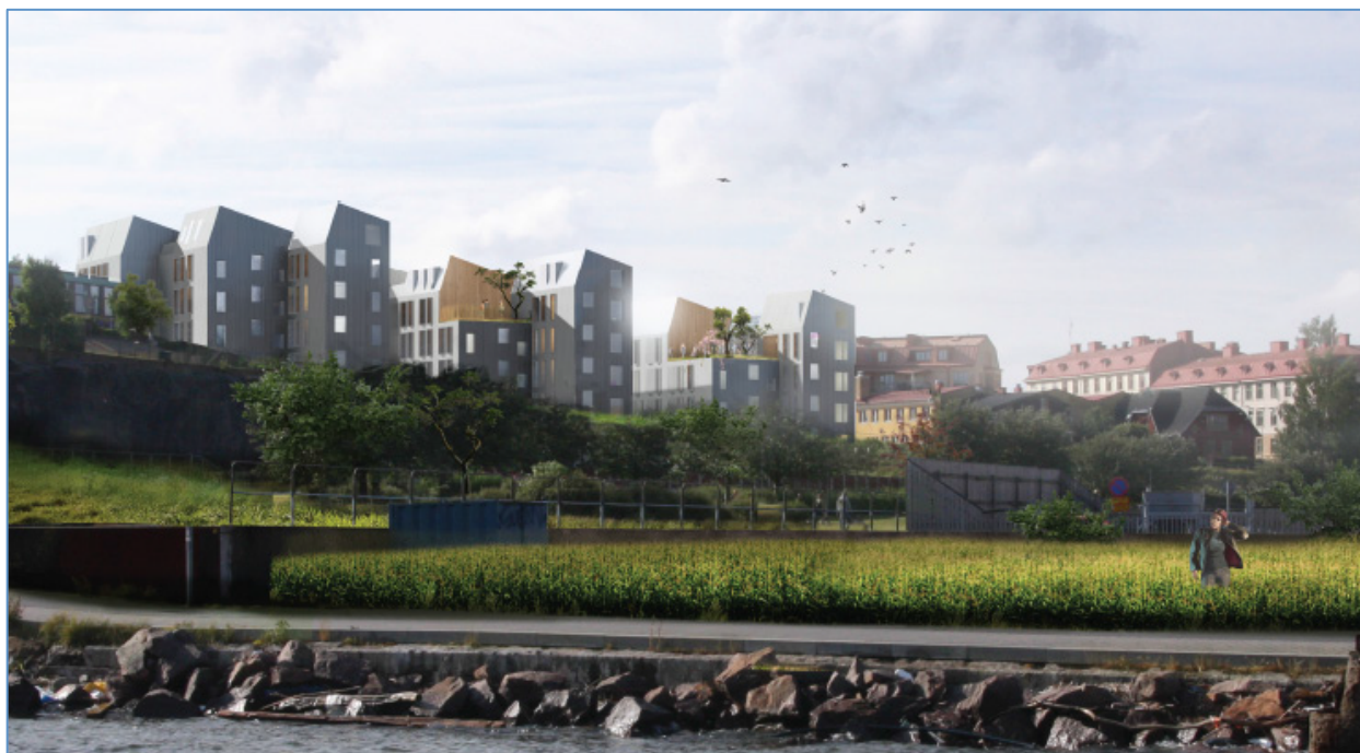
Figure 1. Winning design. Bird perspective. Illustration: Lindbäck's bygg AB and White Arkitekter, 2013.