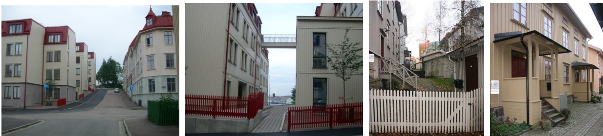
Figure 5, 6, 7 and 8. The winning design in its context. Photo: Magnus Rönn, no 4 and 5. On the right, two photos showing traditional buildings. Source: Melica and Detailed Developer plan, Gothenburg City 2014.