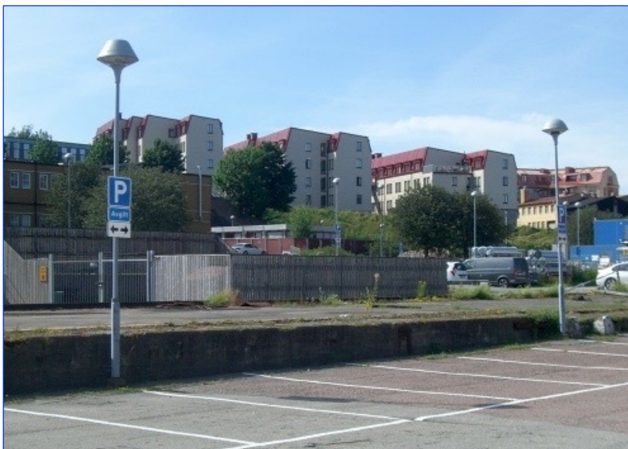
Figure 2. Winning design implemented as built environment in Lindholmen.