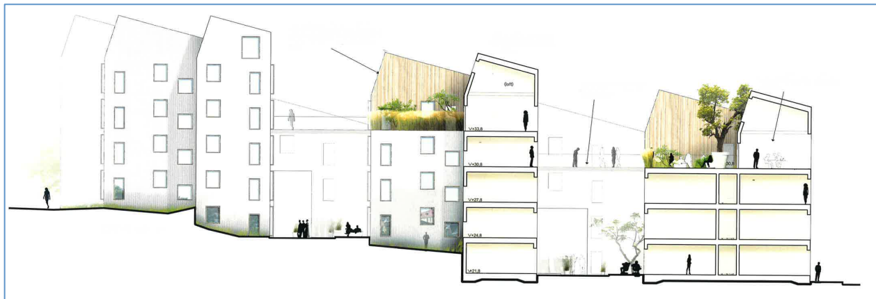
Figure 4. Winning design. Cross section showing the "hubs" on top of the building. Illustration: Lindbäck's bygg AB and White arkitekter 2013.