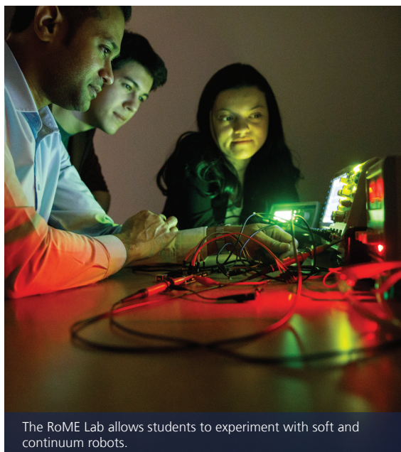
The RoME Lab allows students to experiment with soft and continuum robots.