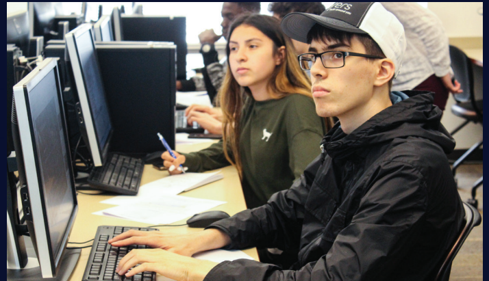
CPS students get a crash course in data science at the Data Science Academy.

Survey results indicate that students were very pleased with the academy overall. "It was fascinating to see how graphs could tell a story about data," one student noted, while another said, "I loved learning new applications and ways to analyze and visualize data."