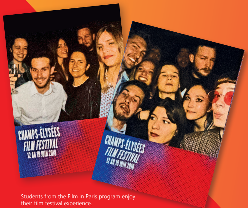
Students from the Film in Paris program enjoy their film festival experience.

To succeed in this internship, students must be adaptable, eager learners, as well as self-starters. Each day brings different challenges and opportunities. In the weeks leading up to the film festival, students tackle prep work, such as assembling welcome packages, researching filmmakers and delivering posters around the city. Then, once the festival begins, students work up to 16 hours a day helping to make sure everything runs smoothly.