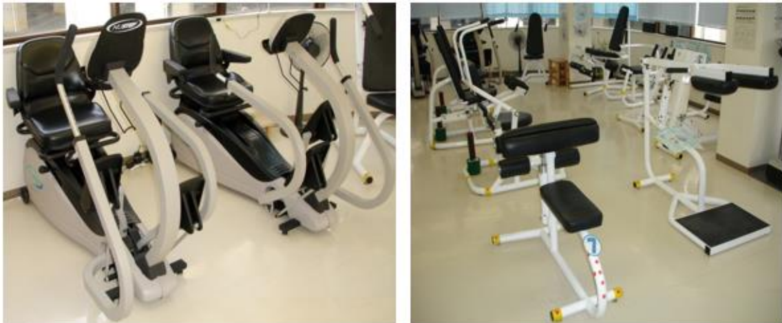
FIG. 1. Exercise machines for anaerobic training.