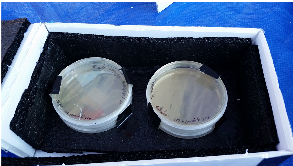
Fig. 2 The interior layout of ATOMIC featured two sets of bacterial cultures inside a foam-core enclosure.

than expected with regards to design. The first design choice of importance was the selection of which bacterial species to use. E. coli , as a commonly occurring bacterium, was a logical choice due to its adaptability and pervasive nature in the environment. Bacillus subtilis was also chosen due to its hardy nature and ability to sporulate if overly stressed, and its presence in the natural environment. Classroom-grade strains that were certain to be non-pathogenic and completely harmless were selected for both species, and were ordered in freeze-dried form from Carolina Biological Supply.