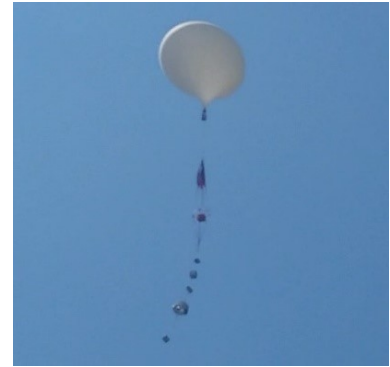
(c) An image of PHANTOM 2.0 at a launch (bottom payload on string).