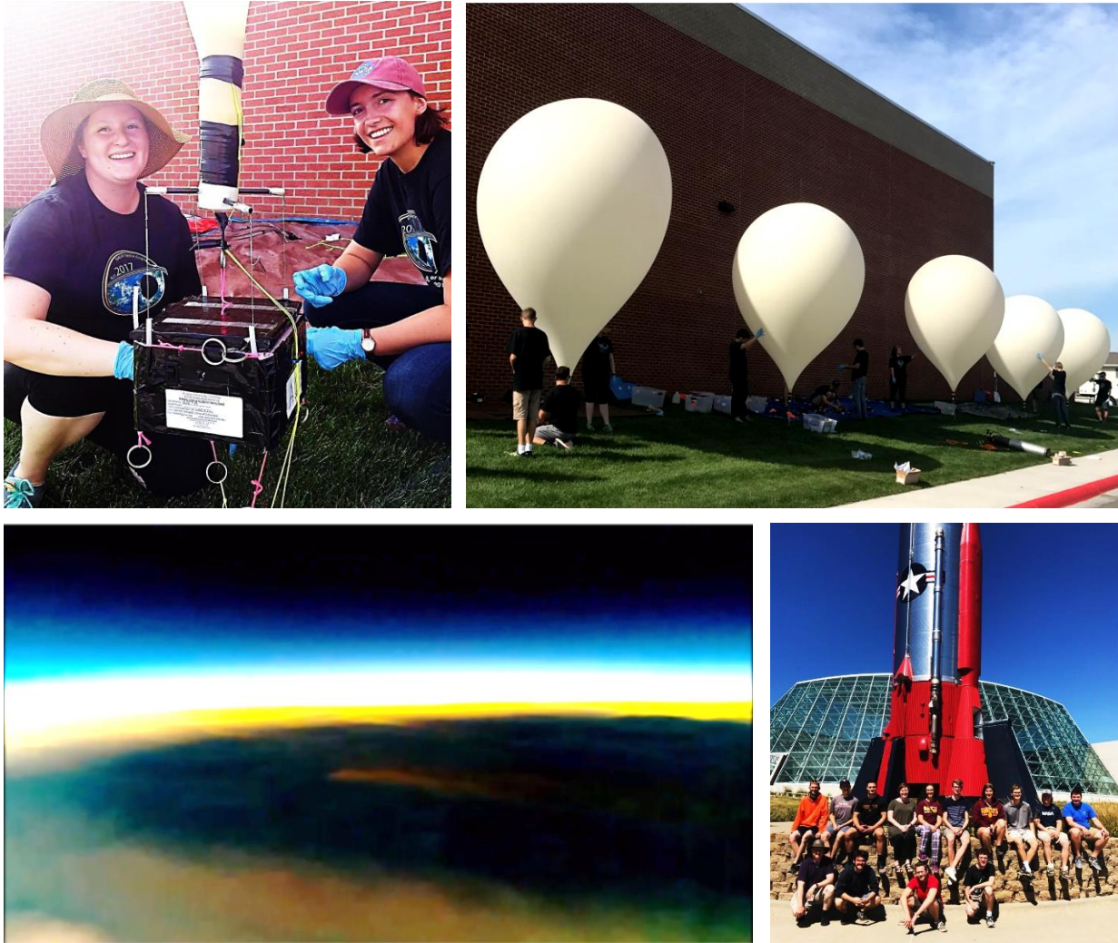
Fig. 4 Images from eclipse trip (left to right then top to bottom): (a) passive anti-rotation device, (b) line of balloons, ready to release, (c) view of receding eclipse shadow from 66,000 feet above Grand Island, Nebraska, and (d) UMTC team (most of it) at Strategic Air Command (SAC) museum on return trip to MN.

The balloon inflations, tethers, then timed launches went very smoothly, especially considering the fact that our team had never tried a five-balloon launch and about half the people at the launch site were not actually on the summer 2017 ballooning team (though most did have past experience with ballooning). One balloon – the very last one to be launched – looked distorted even during inflation and ultimately popped early at 49,000 feet, about 15 minutes before totality. Prior to burst that balloon had a good video feed to the ground station in Grand Island.