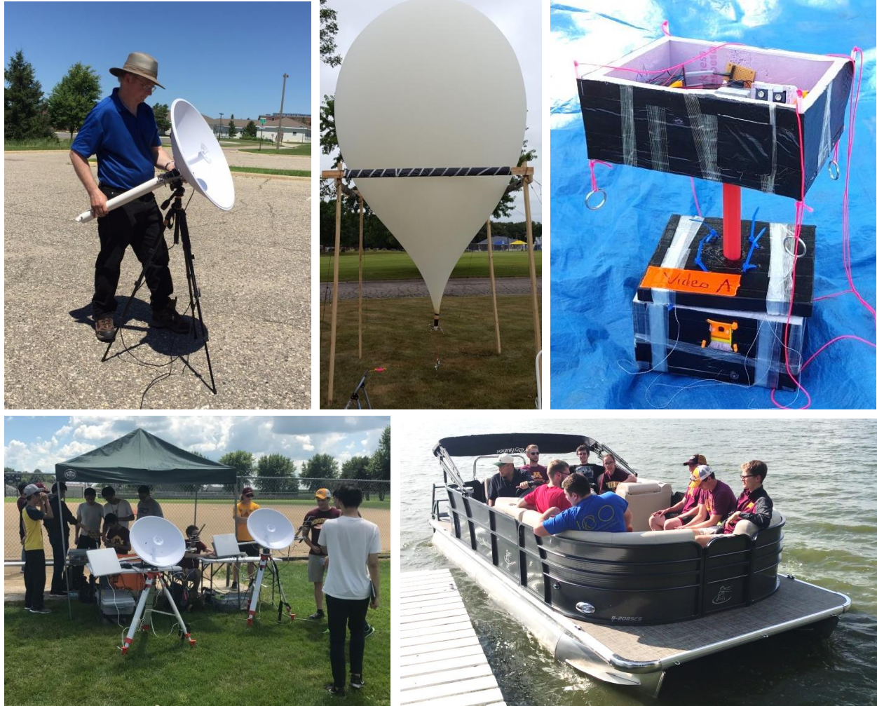
Fig. 3 Testing images (left to right then top to bottom): (a) manual pointing of a video-telemetry antenna, (b) a balloon-tether “corral”, (c) a video-telemetry system attached to an active-pointing CHAD device, (d) a down-range ground station, and (e) setting out on a lake-recovery one week before the eclipse.

On eclipse day ground stations were set up (and staffed by students) at the Stuhr Museum of the Pioneer Pioneer in Grand Island and at The Leadership Center (where the team was staying) in Aurora, about 20 miles farther east. Five balloons, three with video-telemetry stacks, were inflated and launched between 90 and 60 minutes prior to totality from Kenesaw (to the southwest) so as to be visible from both Grand Island and Aurora and ascending between 60,000 and 90,000 feet when totality arrived at 1 p.m. local time (see Fig. 4). Winds were light and cloud cover was intermittent right up to totality but, in fact, all team members on the ground did ultimately get a clear view of totality, albeit from about a half-dozen locations scattered around the Grand Island/Aurora area. Kenesaw was near the edge of the path of totality, so the launch crew did not stay there once the balloons were in flight.