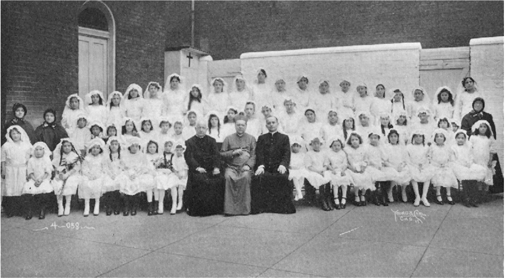
A confirmation class at Santa Maria.

Courtesy Sisters of Charity of Cincinnati, Mount St. Joseph, OH