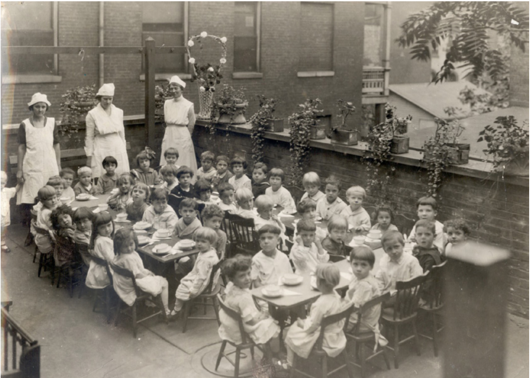
The open air dining room of the nursery in May of 1918.