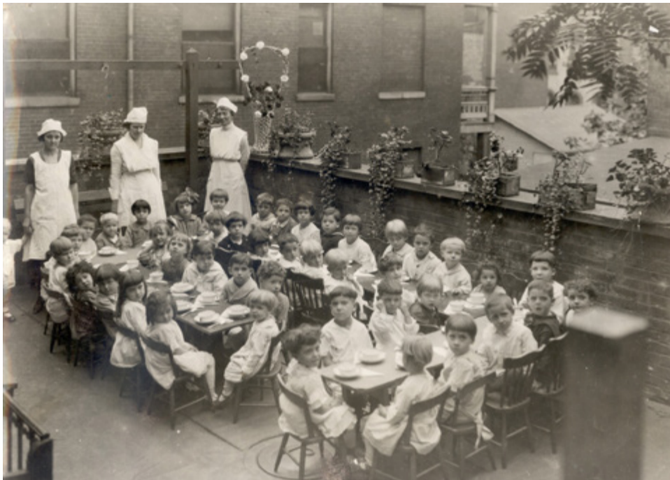
The open air dining room of the nursery in May of 1918.