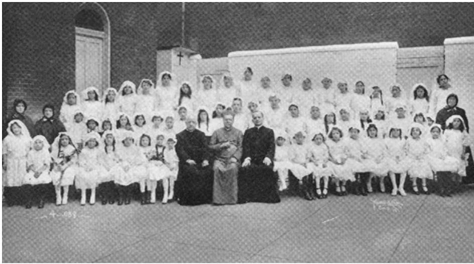
A confirmation class at Santa Maria.

Courtesy Sisters of Charity of Cincinnati, Mount St. Joseph, OH