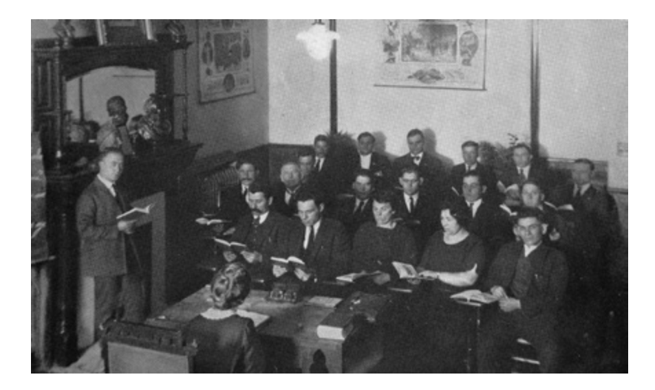
An Americanization class at Santa Maria.