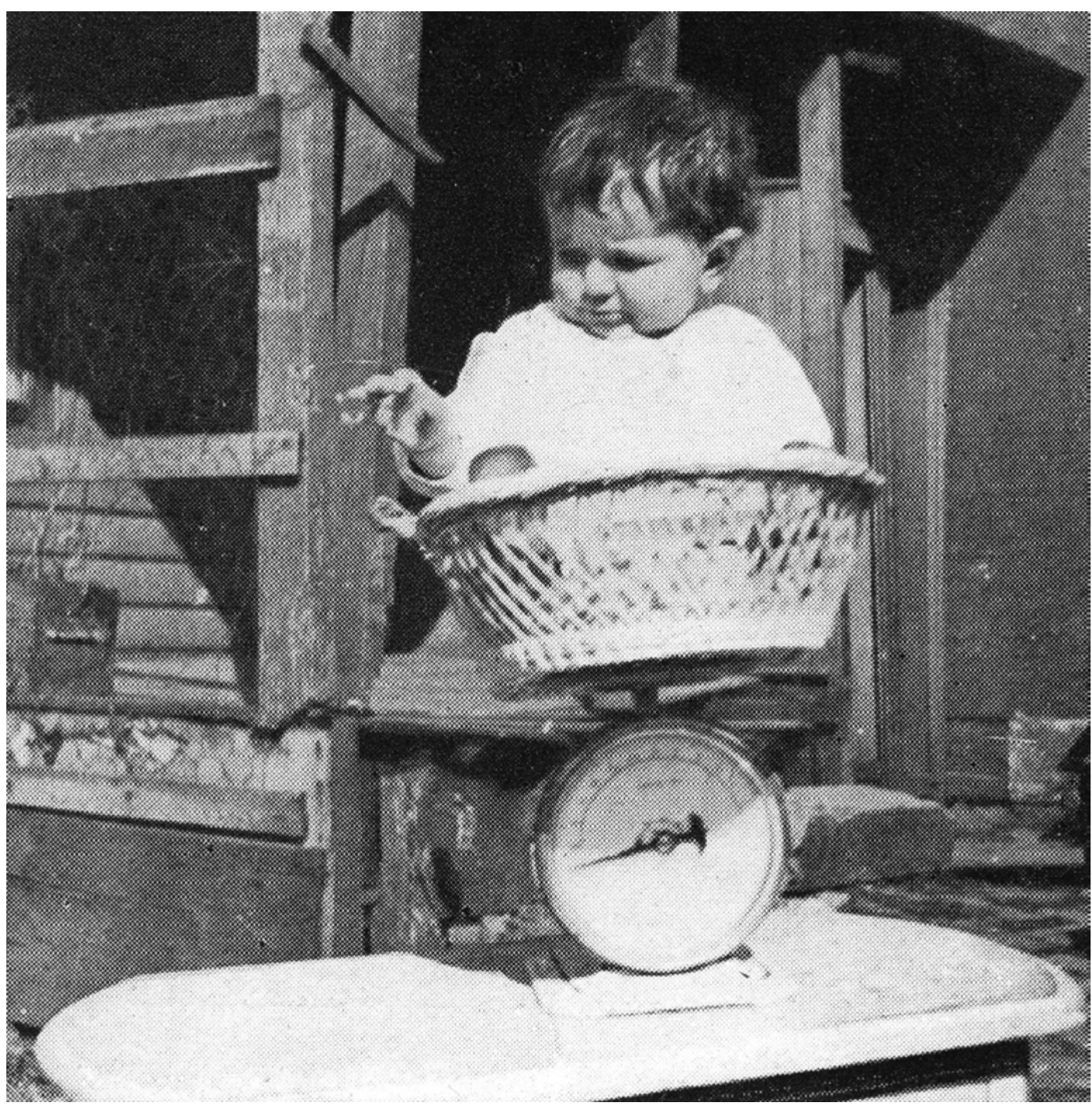
Santa Maria provided for infant welfare by sponsoring a milk station.