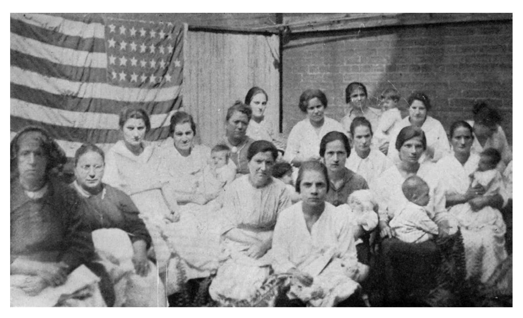
A mother's club at Santa Maria.