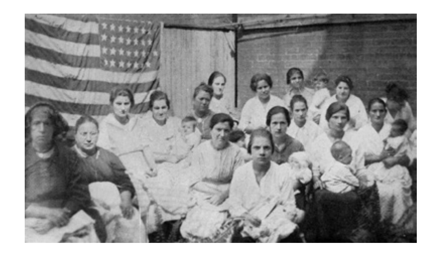
A mother's club at Santa Maria.