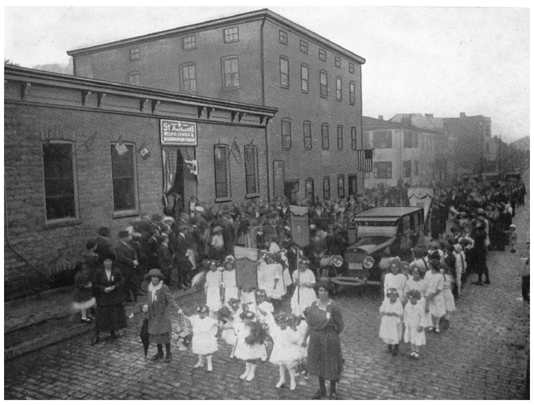
A parade passes in front of the San Antonio Welfare Center in South Fairmont.