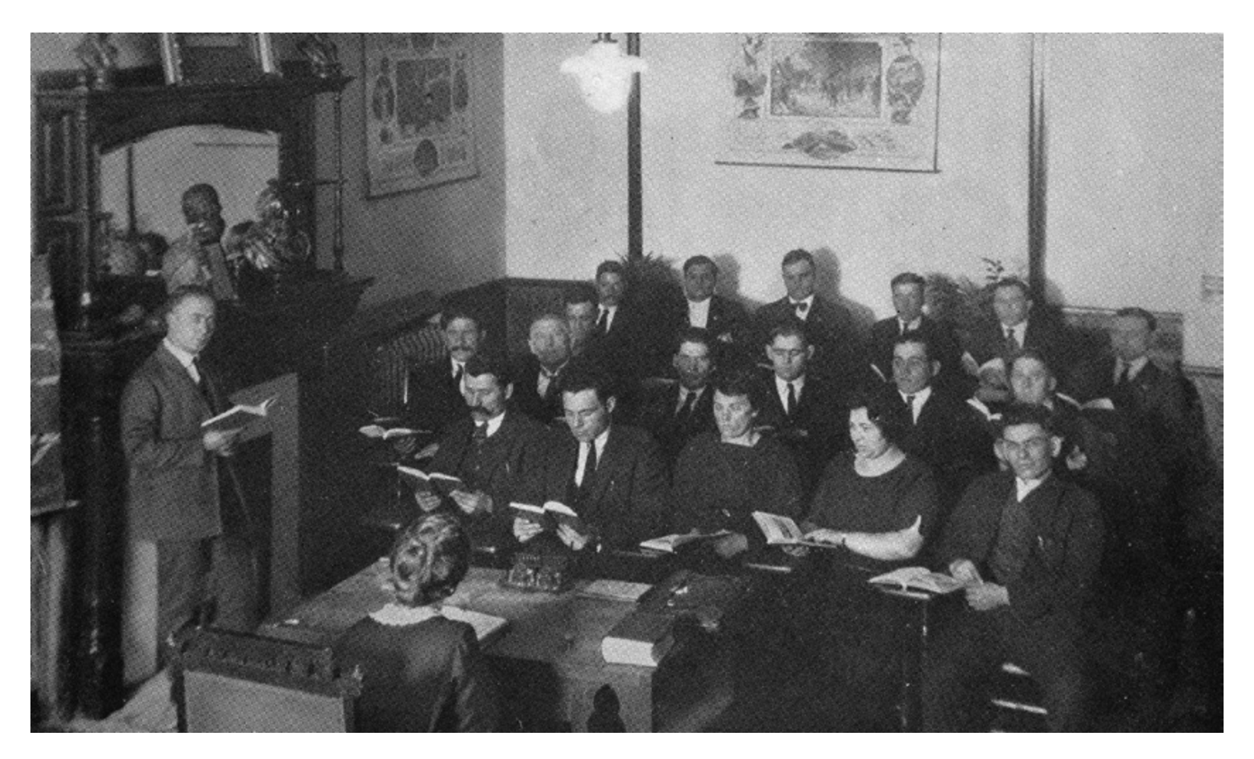
An Americanization class at Santa Maria.