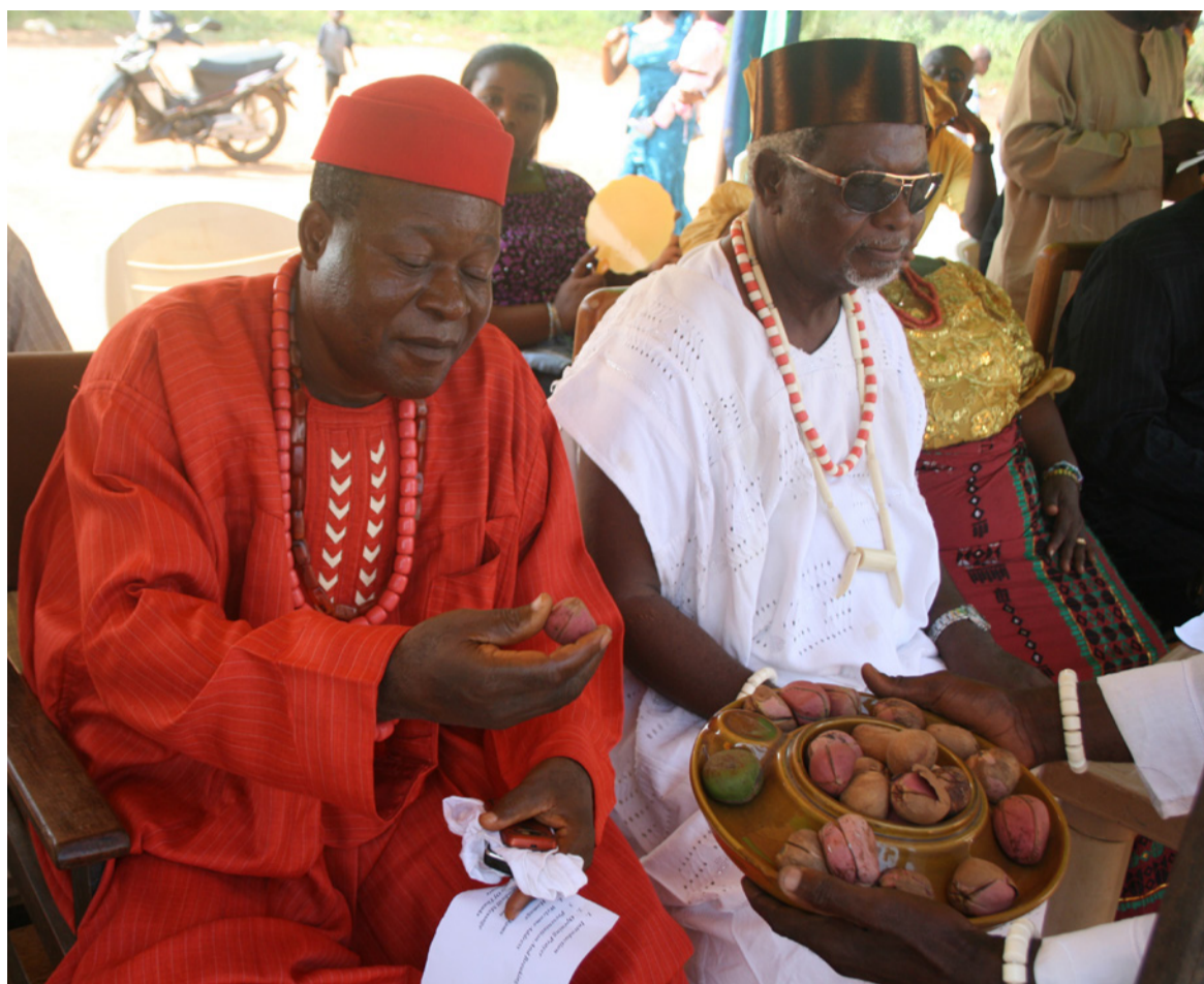
Igbo people participating in the ceremonial sharing of the kola nut.