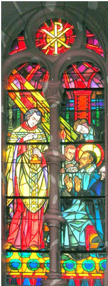
The dying Vincent receiving Viaticum. Stained glass, Église Saint-Vincent-de-Paul, Rolbing, France.