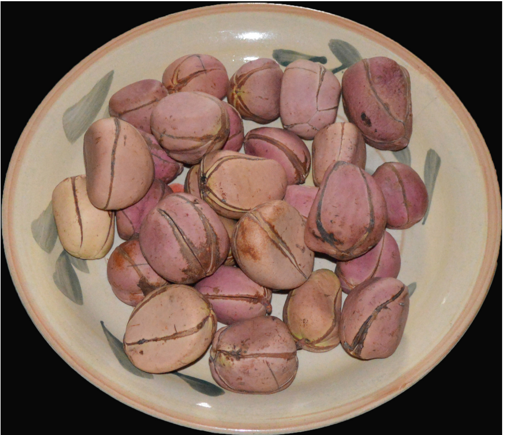
The kola nut. Public Domain