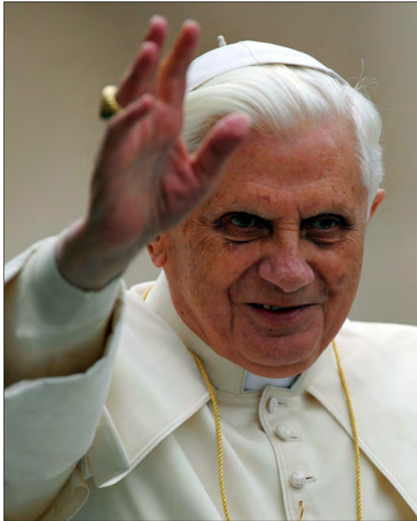
Cardinal Joseph Ratzinger, Pope Benedict XVI (b. 16 April 1927). Public Domain

Paul, and those he inspired, focused on justice and the many injustices within society. Finally, Vincent applied organization to the discussion of charity and justice. Solidarity with our neighbor requires it. Vincent de Paul and the Daughters of Charity were engaged in community organizing, recognizing that the poor often “suffered a great deal, more through a lack of organized assistance than from lack of charitable persons.” 4 What emerges is a model of cultivating solidarity through justice and charity as integral to the life of Christian discipleship.