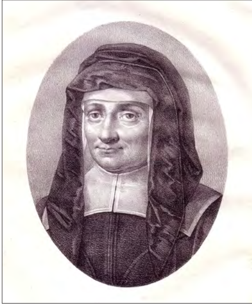
Etching of Louise de Marillac.