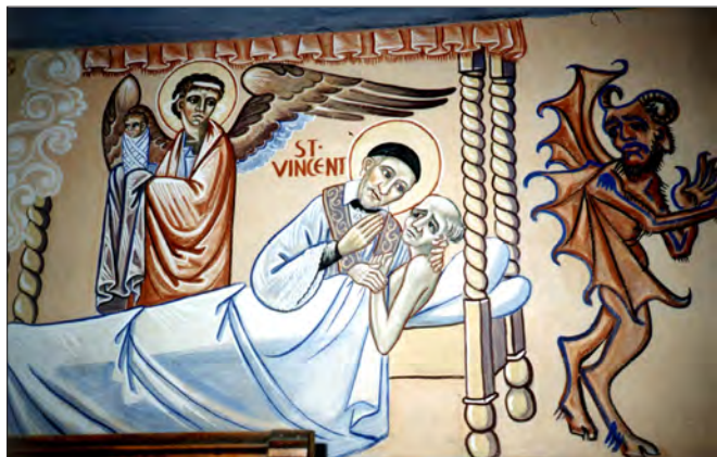
Mural, original in former Vincentian seminary chapel, Dax, France. Vincent hearing the confession at Gannes.

An angel holds the dying peasant's soul as the devil exits.