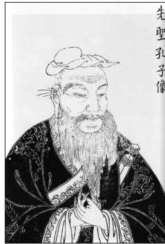
A portrait of Confucius (551-479 BC).