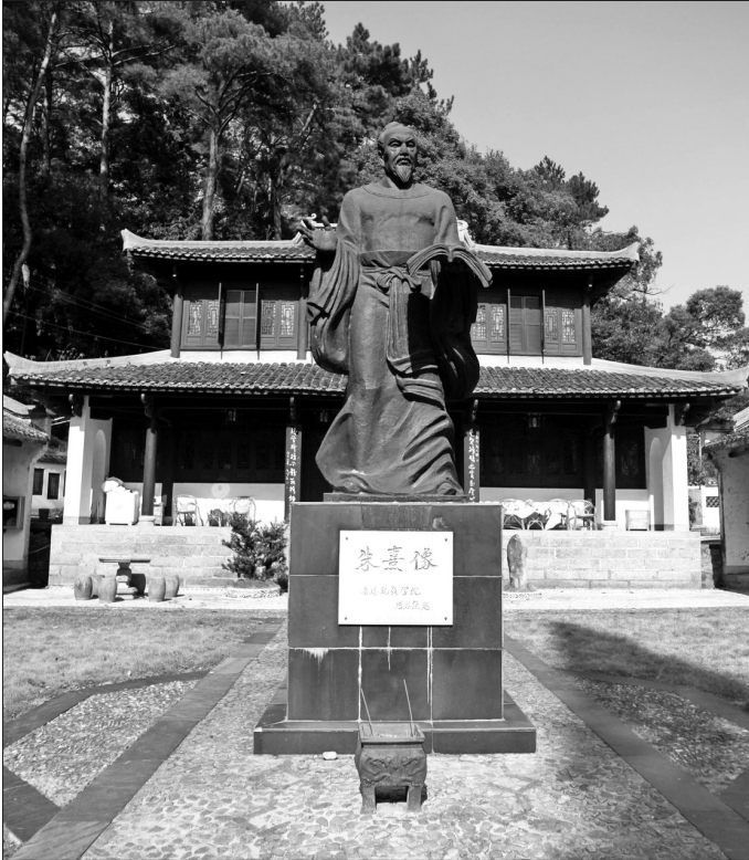
Statue of Zhu Xi, White Deer Grotto Academy, Jiujiang, Jiangxi province, China.

and indifference.... God is love and wants us to go to Him through love.” 29 It is clear that for Vincent the virtue of indifference is a pure disposition of heart, free from all the attachments which hinder us from perfect love. In reading the conferences, as his understanding of apostolic spirituality further deepened, his understanding of the virtue of indifference became more practical and concrete. The fruit of indifference is the freedom of heart manifested in every aspect of our life.