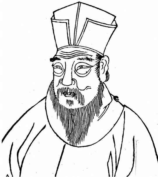
Line drawing of Cheng Yi (1033-1107).

From Confucius on, Confucians knew that if we really know something we love it and find happiness in it, so that things come naturally without arousing self-will (which can easily become selfish pride). It is noteworthy that even though Confucians have no notion of grace, the authentic state-of-mind unified with the principle of Heaven is to be achieved without self-will. Cheng Yi praised humility and gentleness as the most important human virtue. In his commentary on Hexagram 14, Dayou (大有), or Great Holdings, and 15, Qian (謙), or Modesty, Cheng Yi states that humility is the utmost virtue – a humble person always attains the mean and never surpasses the norm. If leaders maintain gentleness, the hearts of the people return to them.