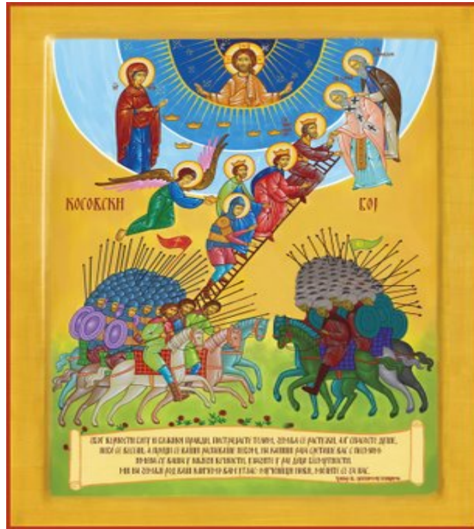
Figure 1. A Scene From the Battle of Kosovo