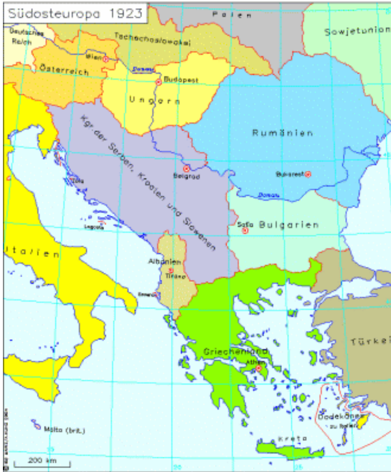
Figure 9. Southeastern Europe in 1923