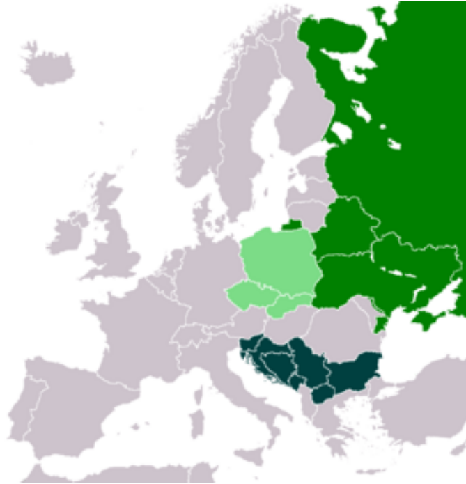
Figure 10. The Effects of Pan-Slavism in Europe