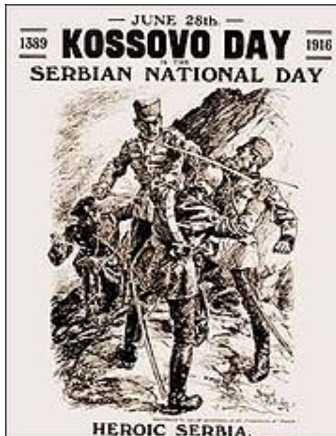
Figure 4. Vidovdan Celebrations During World War I