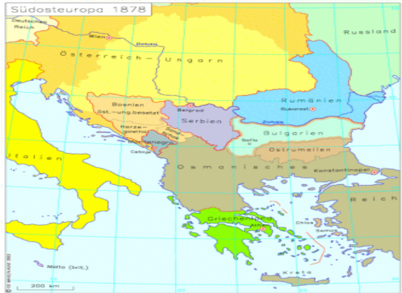
Figure 7. Southeastern Europe in 1878