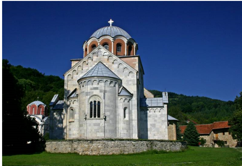
Figure 3. Serbian Orthodox Monastery Studenica