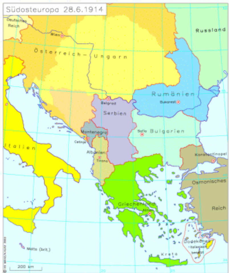
Figure 8. Southeastern Europe in 1914