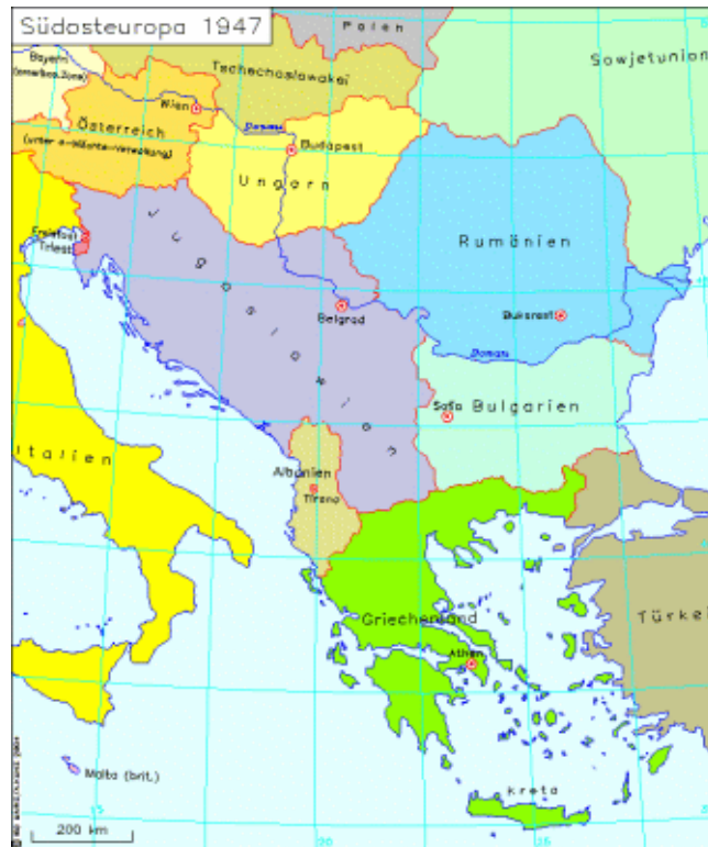
Figure 11. Southeastern Europe in 1947