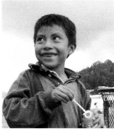
The indigenous people of Chiapas, Mexico's southernmost state.

1994 with the armed uprising of the Zapatistas and their temporary conquest of four towns, including the regional state capital. Subcomandante Marcos became, almost overnight, a hero to the indigenous poor of Chiapas and leftists around the world. I first visited Chiapas in late January 1994 as part of a delegation of North Americans seeking to observe the human rights situation and report on it. 13