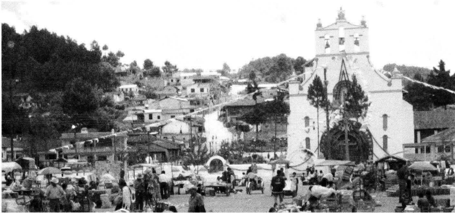
A village marketplace in Chiapas.