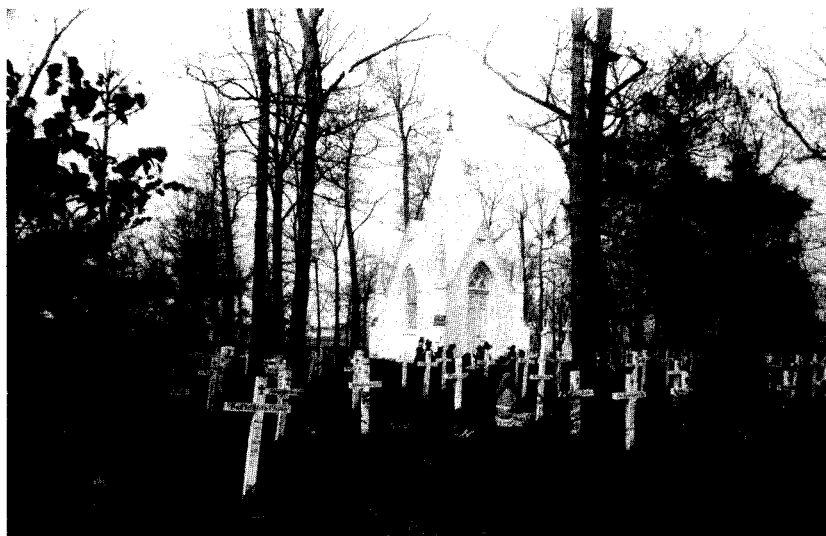
Original community cemetery prior to 1891 erection of marble headstones.

Shows mortuary chapel erected in 1845 by William Seton.