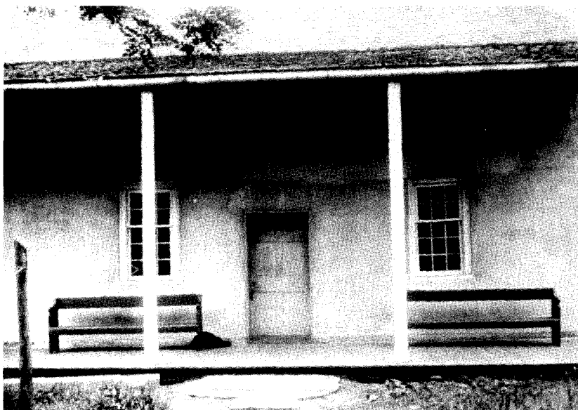
The old Fleming farm house constructed of stone c. 1750 in which the Sisters of Charity spent their first harsh winter of 1809 in Saint Joseph Valley.