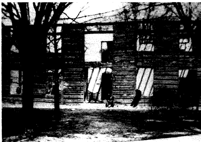
Front view of the log frame of Saint Joseph's House constructed in 1809-1810. It was restored in 1917 and relocated to its present site, now called the White House.

Men began to plaster the first story; we moved from one room to