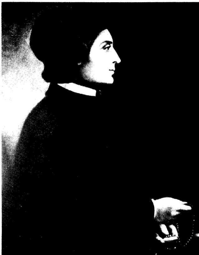
In this Filicchi Portrait, Saint Elizabeth Ann Seton is dressed in the "Widow's Weeds" customary in Italy when her husband died at Pisa in 1803.