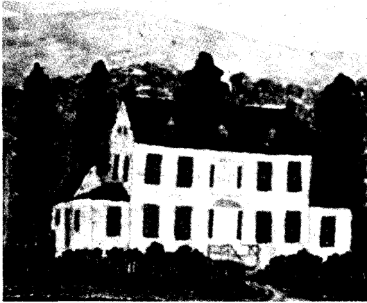
Depicted in embroidery, the first high mass was celebrated by Reverend John Dubois on 19 March in the new Saint Joseph's House, constructed by Mother Seton in 1810.

poor and miserable; were going to a free school and running the streets like so many little ragged beggars.