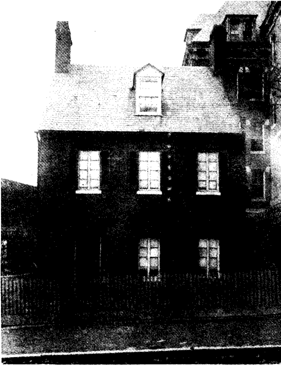
Mother Seton's home and school on Paca Street next to Saint Mary's College and Seminary in Baltimore, June 1808 - June 1809.