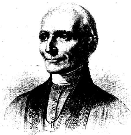
Reverend Simon Bruté, S.S., confessor and spiritual director of Elizabeth Seton at the time of her death.

Revolution. The Sulpician superiors inculcated and nurtured the Vincentian charism in the American community. Reverend Louis William Dubourg, (the first superior, 1809), preached the first retreat to the nascent community and oversaw their initial establishment. Reverend John Baptist David (second superior, 1809-1811) obtained the Common Rules of the Daughters of Charity from France and suggested uniting the American community with the Daughters of Charity in France. Reverend John Dubois (third superior, 1811-1826) modified the Common Rules to meet the needs of the Church in America and provided leadership to the Sisters of Charity, along with Elizabeth Seton, during the foundress' lifetime and during the important time of transition after her death until his elevation to the bishopric of New York. In a letter to his superiors dated 1816 Dubois mentioned the possibility of uniting the American community with the Daughters of Charity. Reverend John F. Hickey (fifth superior, 1830-1841) succeeded and also collaborated with Reverend Louis R. Deluol (fourth and sixth superior, 1826-1830, 1841-1849), who sought closer ties to the French