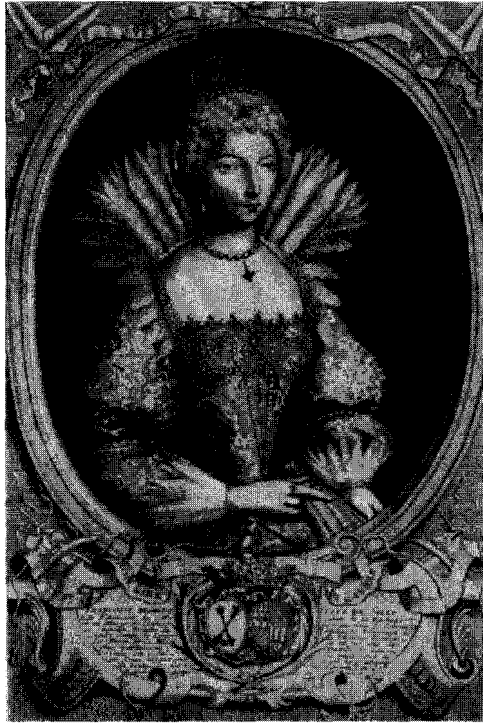
Françoise-Marguerite de Silly, Madame de Gondi in marriage.

If this description of the mission capital of the university is indeed as I describe it above, then DePaul University is already well on the way to ensuring that as the first lay woman or man becomes president and is succeeded by lay presidents, as the last Vincentians gradually retire from the university, and perhaps even as the Congregation of the Mission itself regretfully withdraws its canonical sponsorship and legal connections with the university, that DePaul will confidently move into a new era of its history as a Catholic, Vincentian and urban institution. There is much hard work