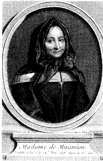
Period etching of Marie Bonneau de Rubelle (1629-1696), better known as Madame de Miramion. A woman of great wealth and privilege, a Lady of Charity, Madame de Miramion continued, even expanded upon, the social works of Vincent and Louise following their deaths.